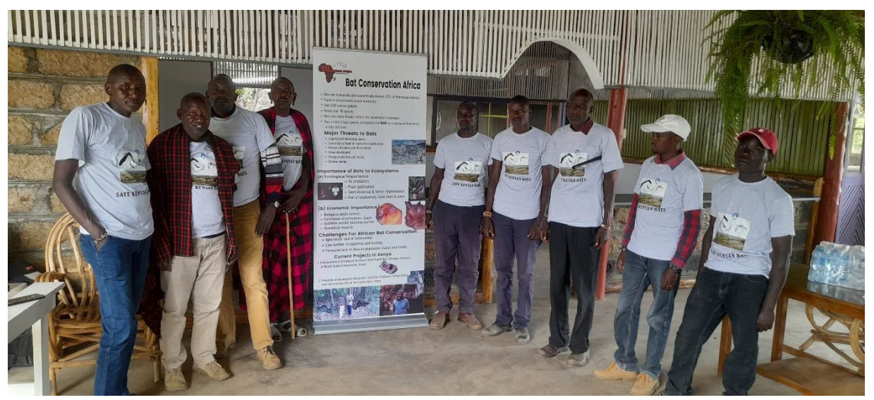
Figure 5. Consultative meeting with the local community members to carry out a community awareness programme.