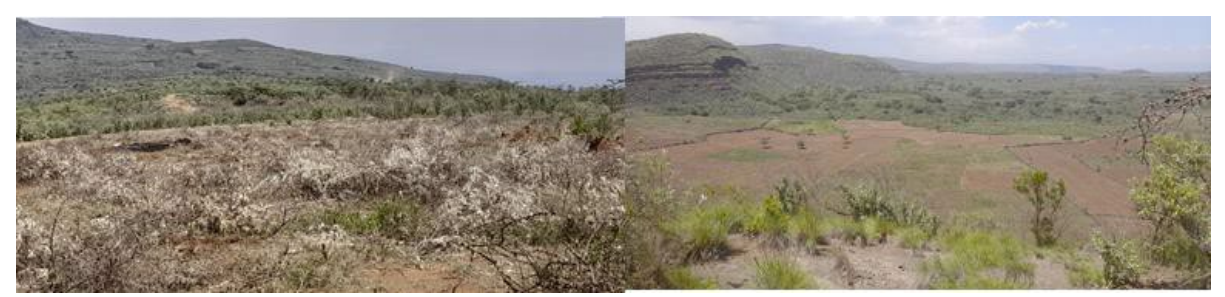
Figure 3. Clearance of vegetation to create room for agricultural production