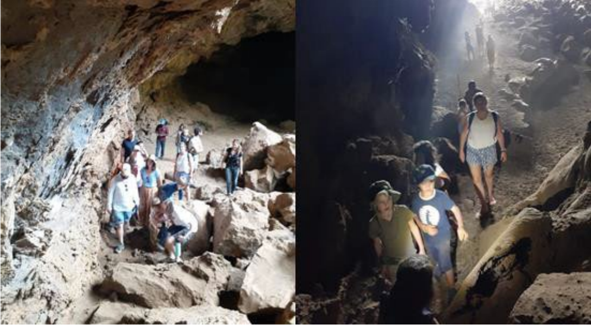
Figure 4. Tourists vising the Mount Suswa Caves

(c) Awareness was carried out through consultative meetings, printed information as posters, and t-shirts, based on the research findings to demystify folklores about bats and to highlight their importance in ecosystems (Fig. 5).