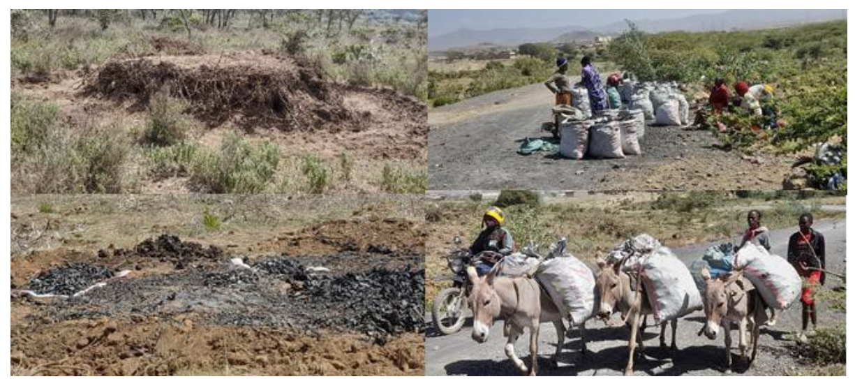
Figure 2. Burning of charcoal within Mount Suswa Conservancy