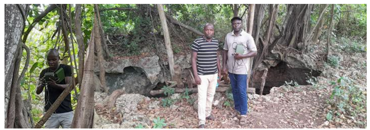
Figure 1. Recording echolocation pulses for bat species in the field

(a) Data collection involved recording echolocation calls, using SM4 bat detectors (Wildlife Acoustics, Inc., Massachusetts, USA) near caves and the surrounding habitats in the conservancy (Fig. 1)