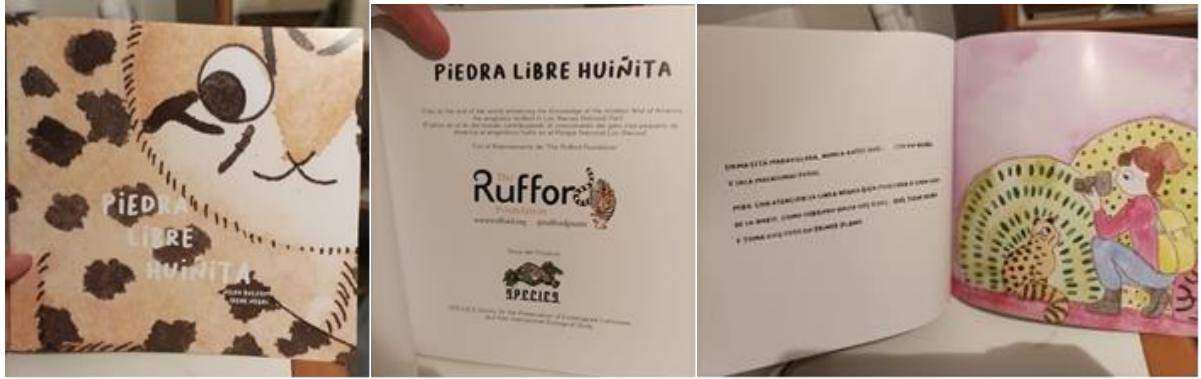
Figure 2. Some captions of the printed book "Piedra libre huiñita".

Figure 1. Map of Los Alerces National Park (light and dark green) showing the restricted area (dark green). Each square represents the location where a CT was deployed: red (Frey River), purple (Krugger trail), green (Menéndez Lake).