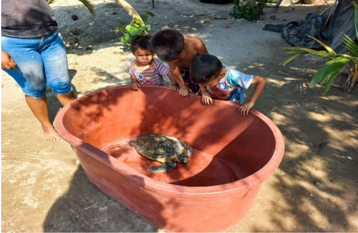
Figure 4. Local children were interested in our work during the measuring and tagging process.