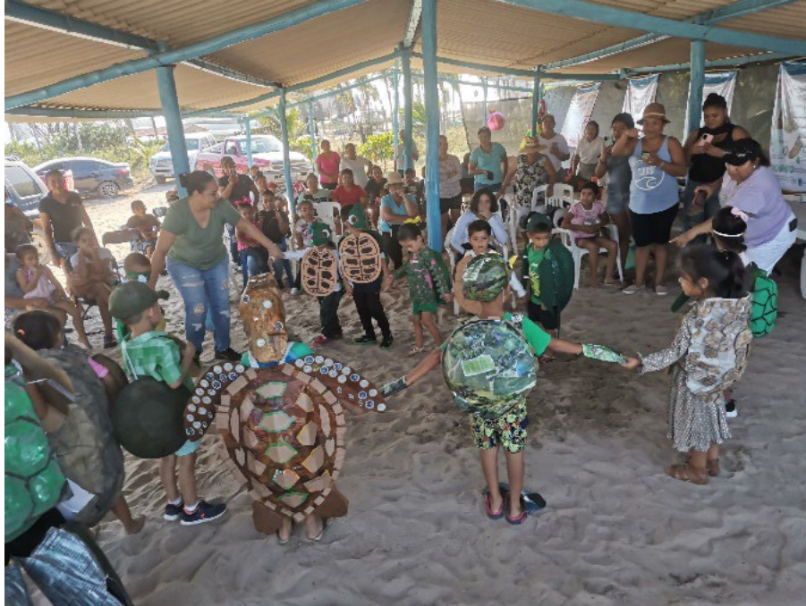
Figure 2. Children participating in the sea turtle costume contest, showing their costume to the judges.

The next day, we visited Punta Pérula, located about 80 km south of our study site; there we visited the islands inside the bay and did some exploratory dives (Fig. 3). Thanks to the site knowledge of our captain and previous collaborator, Cande, we were able to capture a juvenile hawksbill turtle (Fig. 4). The turtle was posteriorly cleaned, measured, tagged and released with locals.