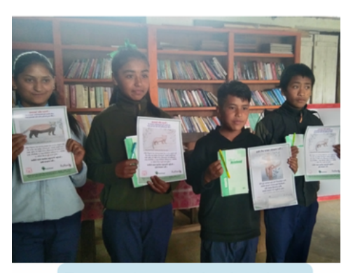
Posters given to school students

Schools pasted the posters in different classes, libraries, and offices.