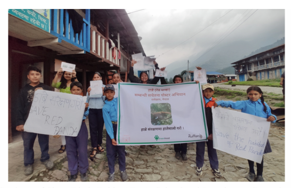
Students of Shree Bhale Pokhari Basic School and Jatteshwory Secondary School posing for a photograph at Garjang

Four different schools of Chuchure successfully conducted focus group discussion. Two FGD were conducted at Chuchure, one at Shivalaya and another at Garjang. Students led the programs at Shivalaya and Garjang. Each site had Secondary-level students and Basic-level students Local residents participated in the events.