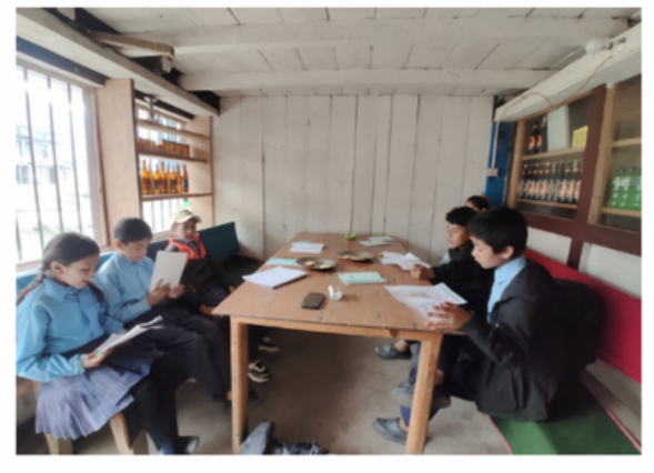
Students of Bhalepokhari Basic School and Jatteshwory Secondary School interacting with each other and discussing about the content for FGD in tea house of Garjang, Chuchure