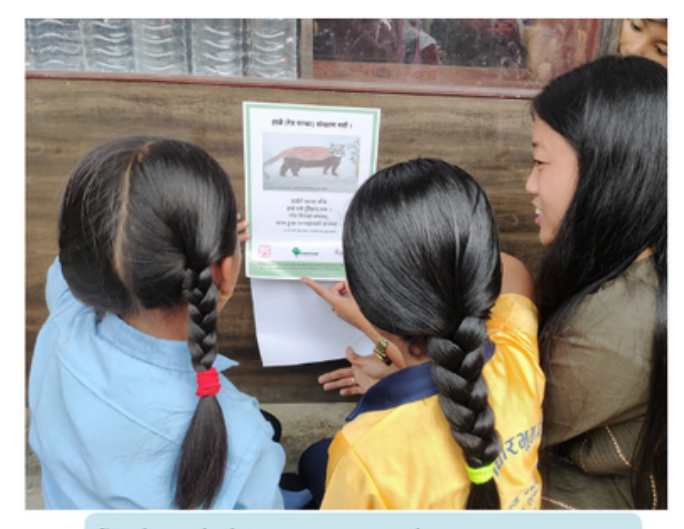
Students helping team member to paste poster