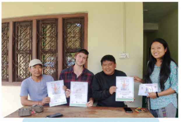
Poster handed to the official of Gaurishankar Conservation Area Region Office at Shivalaya