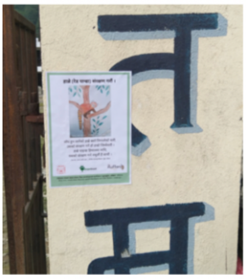
Poster at gate of Shree Shiva Basic School, Chuchure