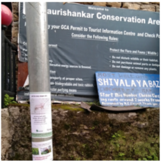
Poster near Gauri-Shankar Conservation's region office, Chuchure