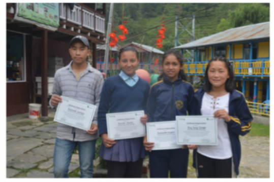
Students of Shree Shiva Basic School posing with their certificate of appreciation