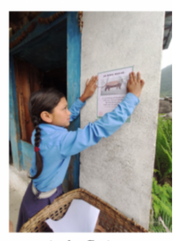
Student of Shree Bhale Pokhari and Shree Jatteshwory pasting posters in the Garjang