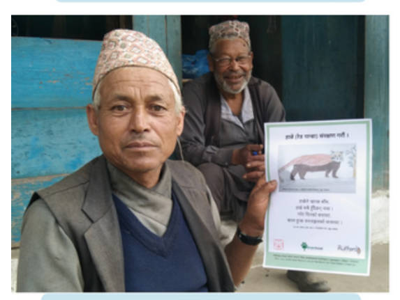
Poster given to an elderly person at Garjang