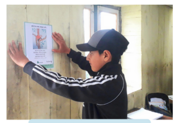
Student of Shree Seti Devi pasting poster in his class