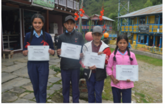
Students of Shree Seti Devi Secondary School posing with their certificate of appreciation