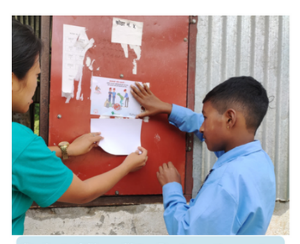
Student of Shree Shiva Basic pasting poster