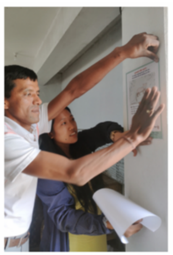
Teacher of Shree Bhale Pokhari pasting poster in the office