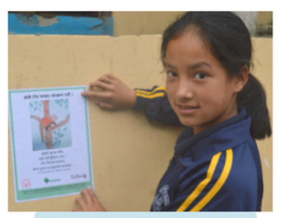
Student of Shree Shiva Basic School pasting poster at Tourist help desk