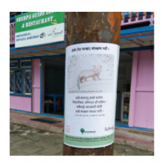
Poster at Shivalaya Bazaar, Chuchure