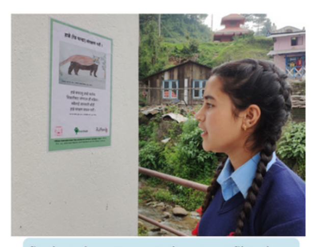
Student observing pasted poster at Shivalaya