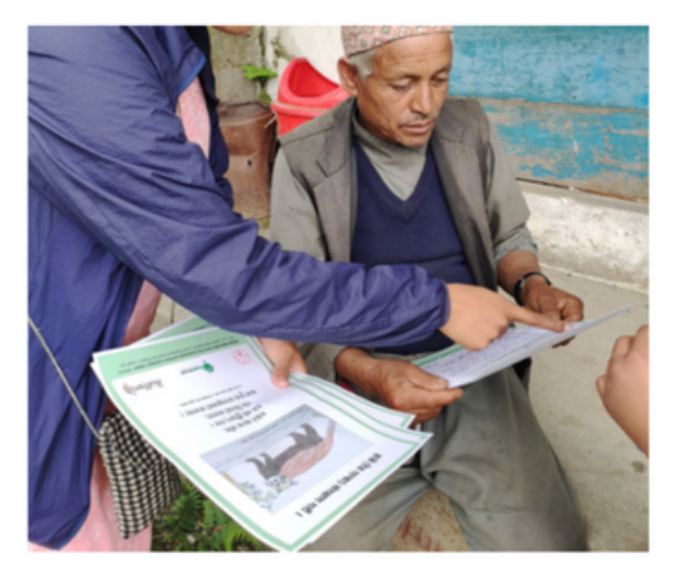
Team member describing the poster to an elderly person at Garjang's marketplace, Chuchure