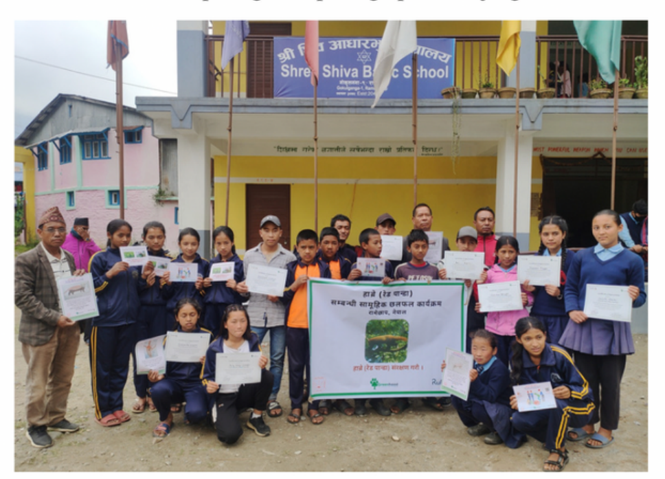
Students of Shree Shiva Basic School and Seti Devi Secondary School posing for a photograph at Shivalaya