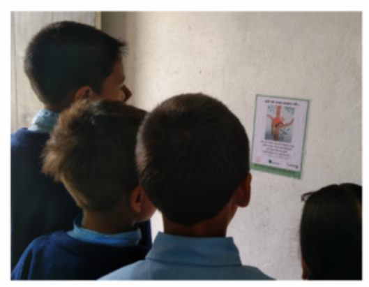
Student of Shree Bhale Pokhari observing poster in their classroom

School authority also assisted in pasting the posters in the teacher's staff room.