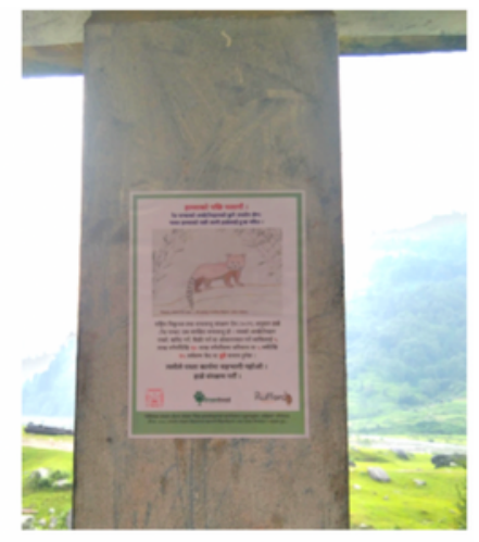
Poster at resting house near Garjang, Chuchure