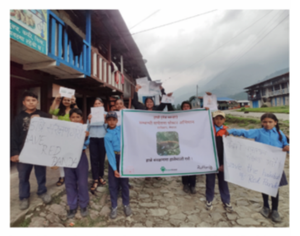
Poster campaign conducted done by school stud by school students of Shree Bhale Pokhari Basic School & Shree Jatteshwory Secondary School at Garjang, Chuchure