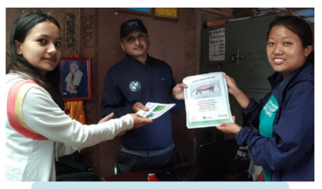
Shree Seti Devi Secondary School, Sangwadanda