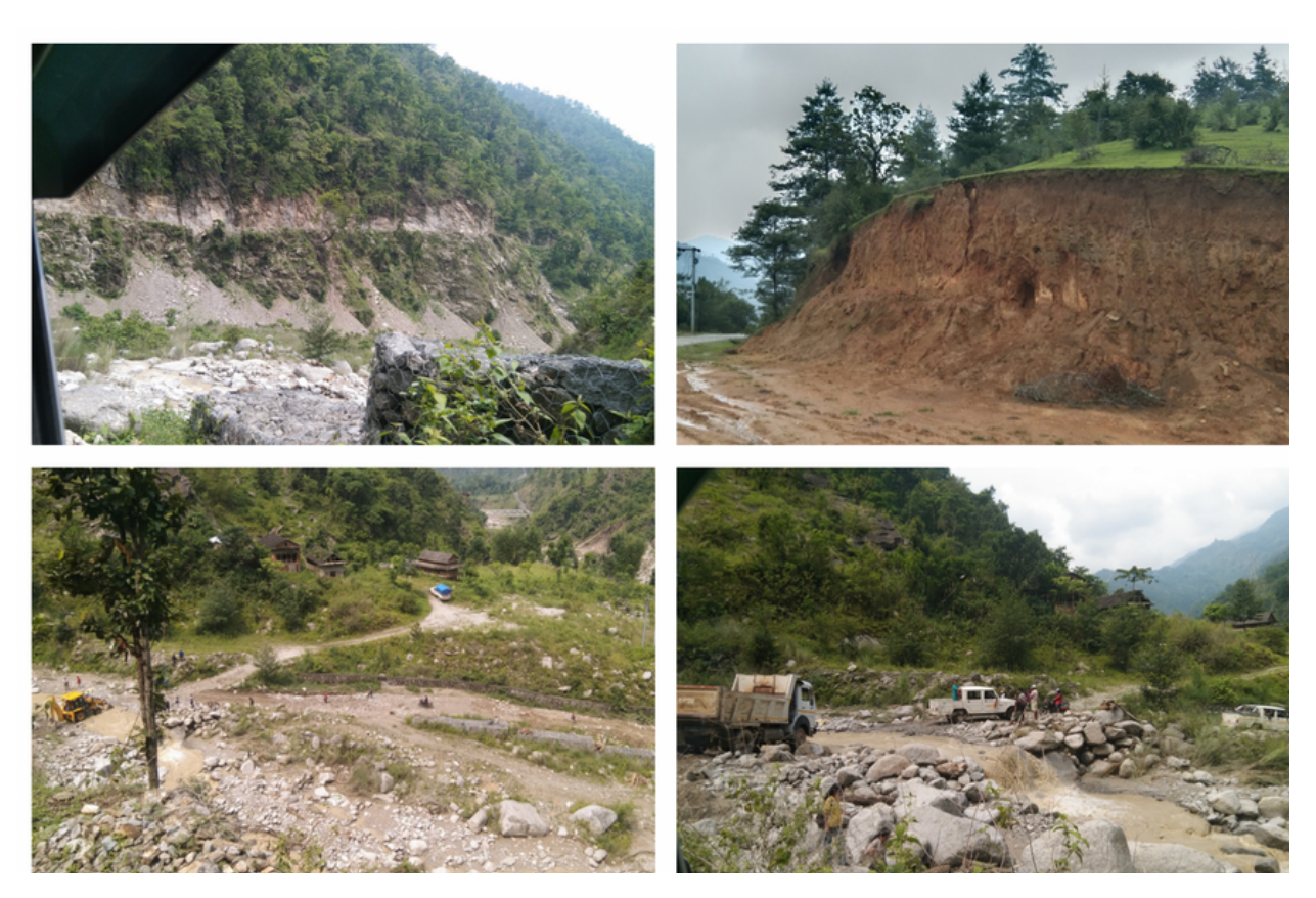
Road conditions to Chuchure from Kathmandu. JCB backhoe loader clearing debris collected in riverways in the downstage right image.

Taking this issue critically along with keeping safety of the team members in mind, the team planned to conduct third quarter project activities only in Chuchure. Even the roads to Chuchure were challenging as shown in the photographs below. Monsoon season also hinders schools. Schools at Ramechhap would be close in this season for a month due to monsoon rainfall. Despite these challenges, the team successfully completed projected activities in Chuchure in time.