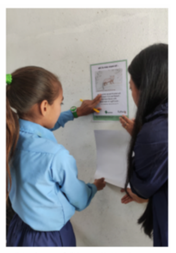
Student of Shree Jatteshwory pasting poster in their classroom