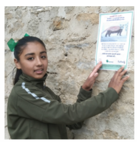
Pasting posters at different shops at Garjang, Chuchure