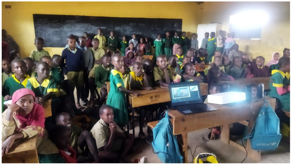
Training for School Children, Nanyuki, Kenya.