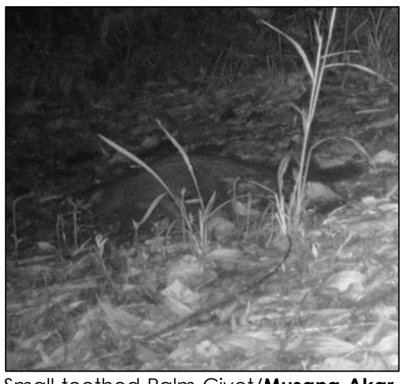
Smooth-coated Otter/ Memerang Licin (VU) (Lutrogale perspicillata) Licin Small-toothed Palm Civet/ Musang Akar (LC) (Arctogalidia trivirgata)