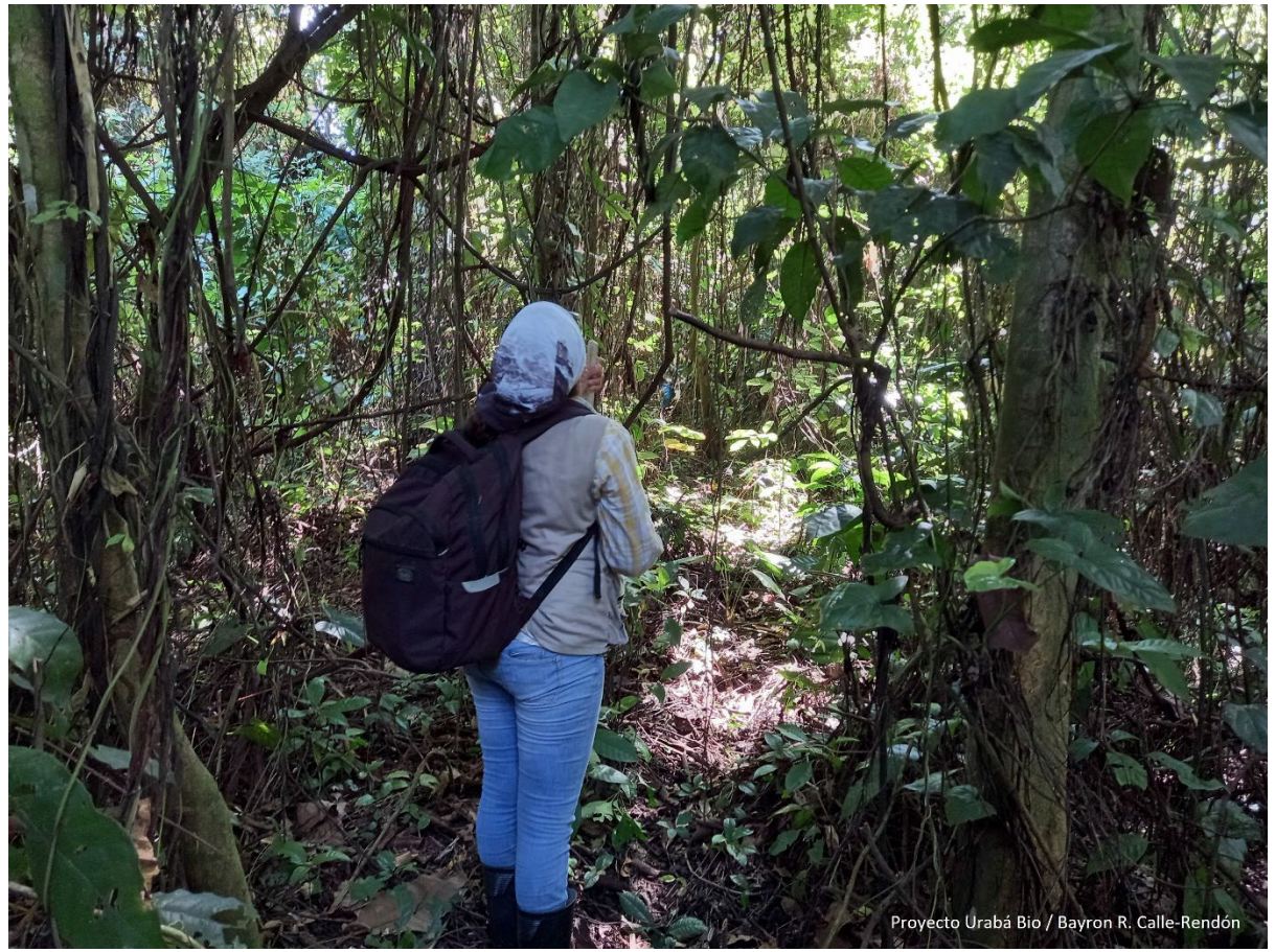
Team member.