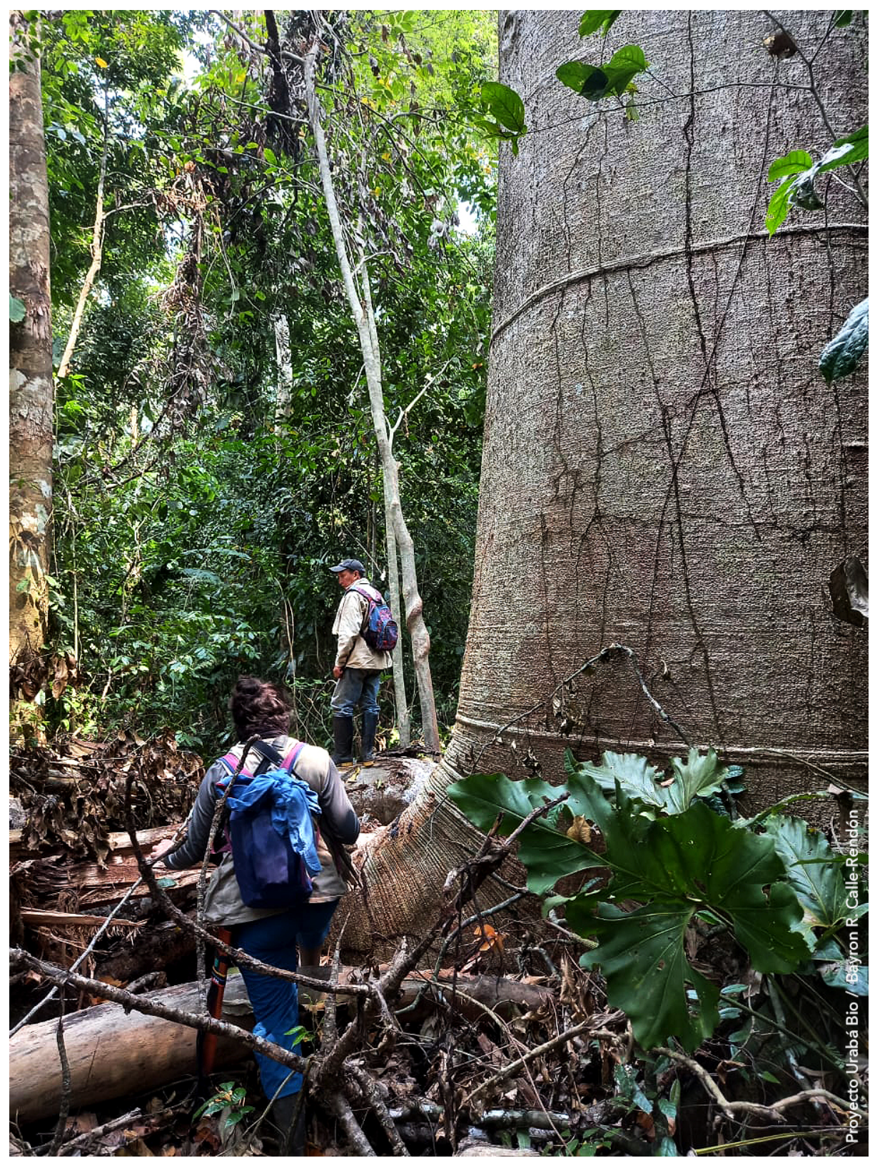
Team. © Bayron Rafael Calle Rendon.