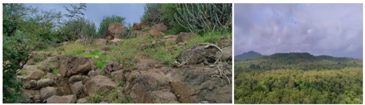
Field areas in Hingolgadh Sanctuary, Gujarat.

Field area in Sri Venkateshwara NP, Tirupati (L) and a hatchling found in the adjacent area (R).