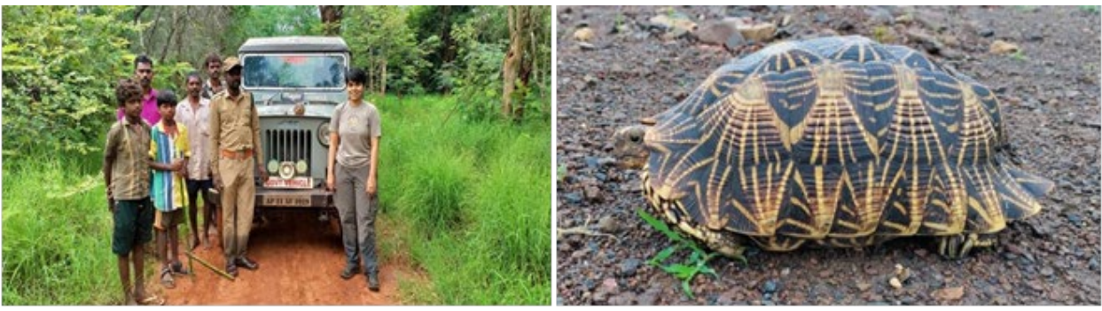
Field staff and locals in NSTR, AP (L) and first Star tortoise sighted in Gir NP, Gujarat (R).