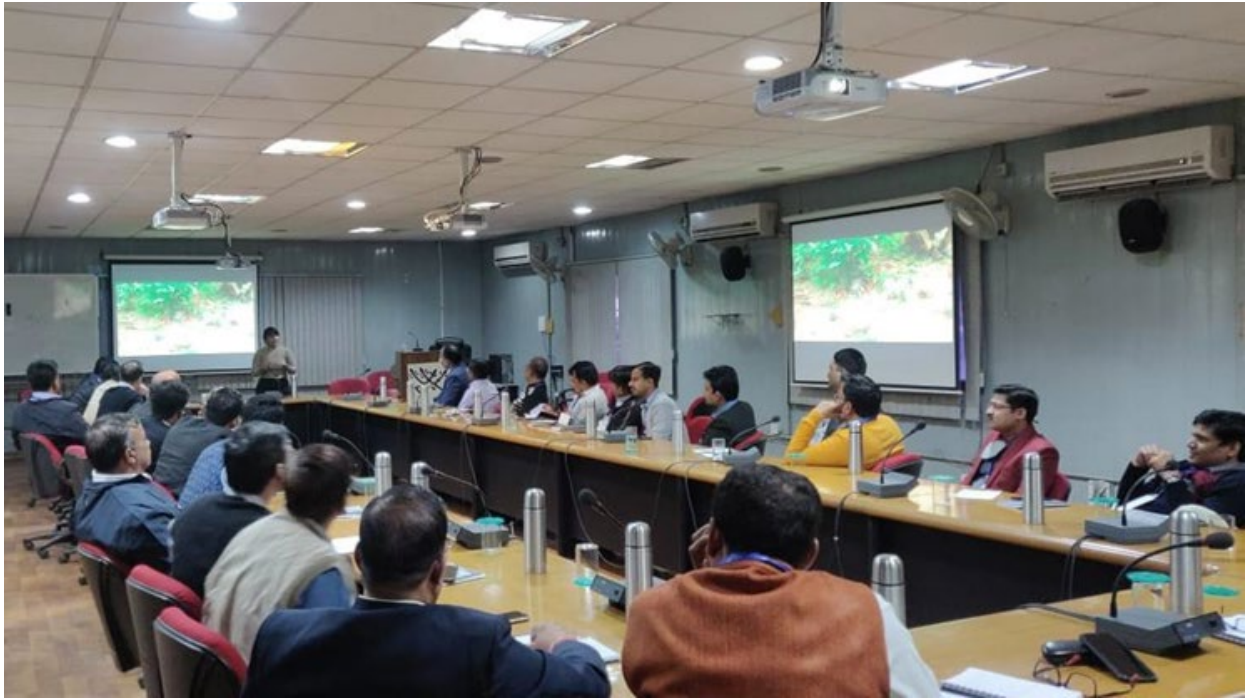
Interactive seminar with Forest department officials from Jaipur Rajasthan.