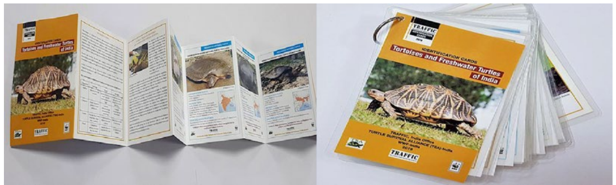
Species identification guides (procured from TRAFFIC, India).