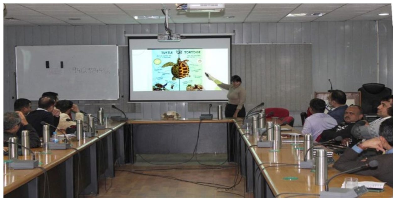
Interactive seminar with Forest department officials from Jaipur Rajasthan.