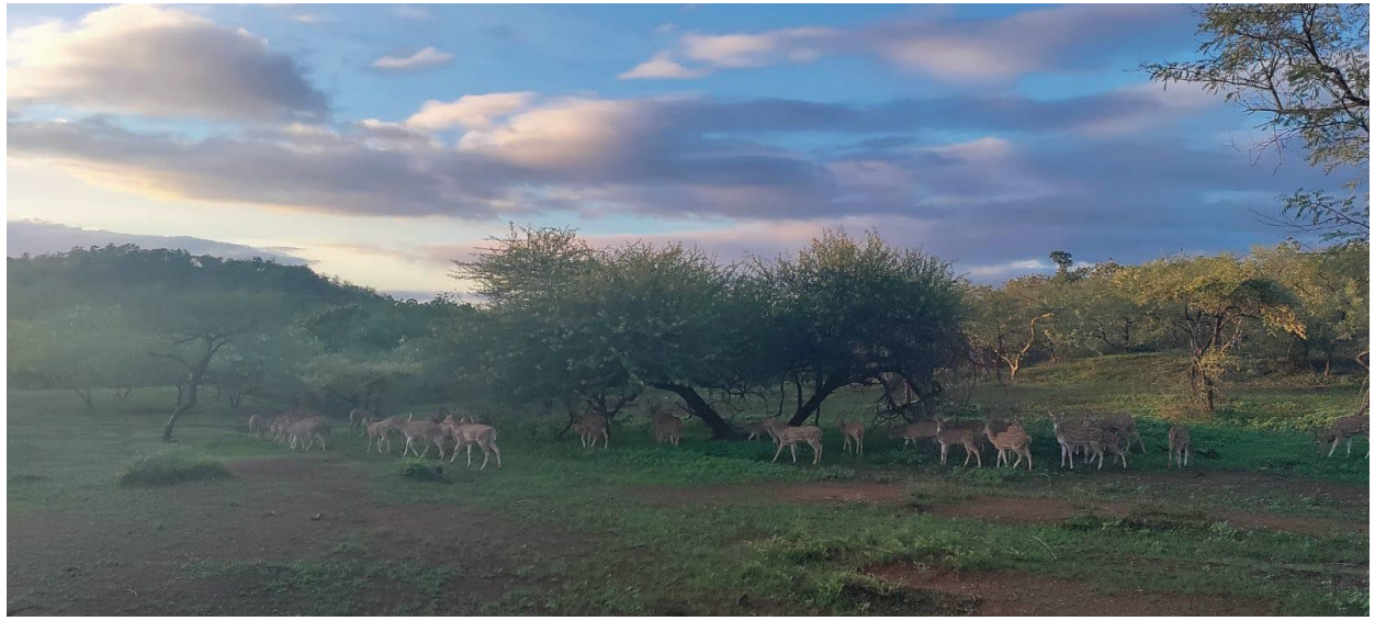
Field area in Gir NP, Gujarat.