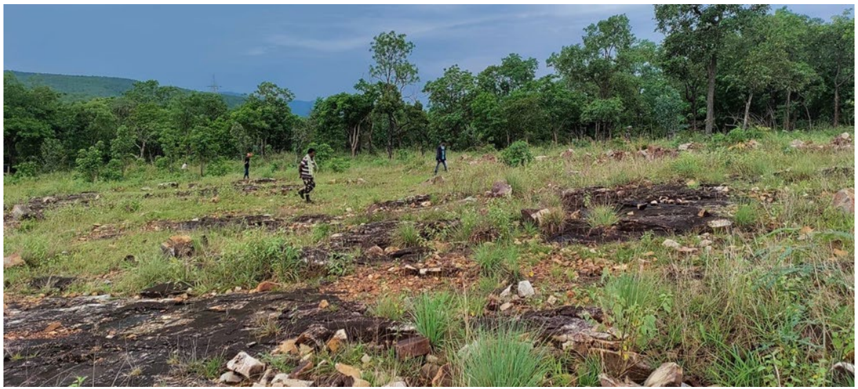
Field staff and assistants searching for Indian star tortoise in SVNP, Tirupati.