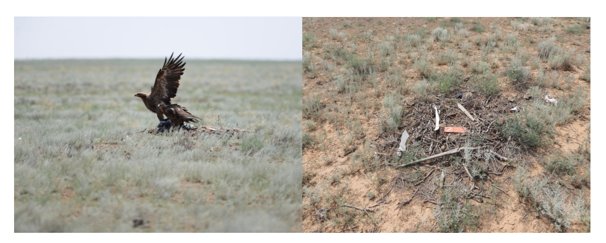
The 2021 breeding season was extremely unsuccessful for steppe eagles because of a decrease in the small ground squirrel number. Only 41% of breeding territories were successful; the clutch died in 36% of breeding pairs; all nestlings died in 14%. Weather conditions of this year and decreased pasturing were the most obvious reason for the deterioration of eagles' food supply.

Despite the seeming stability of the population, it has the signs of extremely negative trends. Because of a very high mortality of adult birds from 2013 the number of abandoned breeding territories increased by three times, and the proportion of immature birds in breeding pairs – by 15 times. In turn, the process of extinction and further redistribution of breeding groups are probably due to worsening feeding conditions in the area boundaries. An increase in the density of breeding on sites with a high number of ground squirrels while nesting on sites with a low number is reducing speaks well for it.