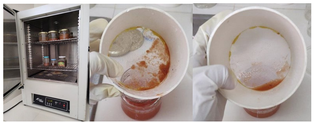
Figure 1: Samples in the organic matter digestion process. Figure 2. Sample filtering through two different meses.

The organic matter contained in the samples was digested with potassium hydroxide, leaving the product in the stove for 48 hours (see Fig. 1). Once out of the stove, it was proceeded to segregation, taking the supernatant from the organic matter, which was filtered to collect the microplastics. (See Fig. 2). They are placed in glass jars for further observation under the stereomicroscope (Discovery V8, Zeiss) Fig. 3.