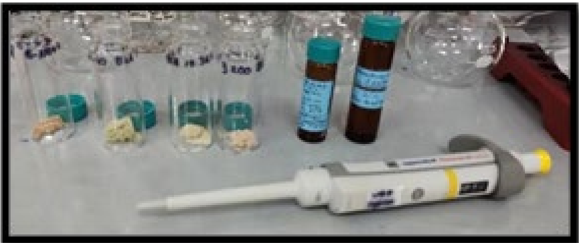
Left: Sample lyophilization. Right & below: Lyophilized samples of zooplankton, phytoplankton, and whale shark.