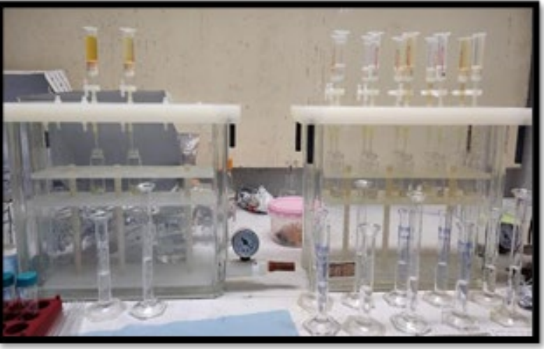
Left: Ultrasonic probe. Right: Solid phase extraction.