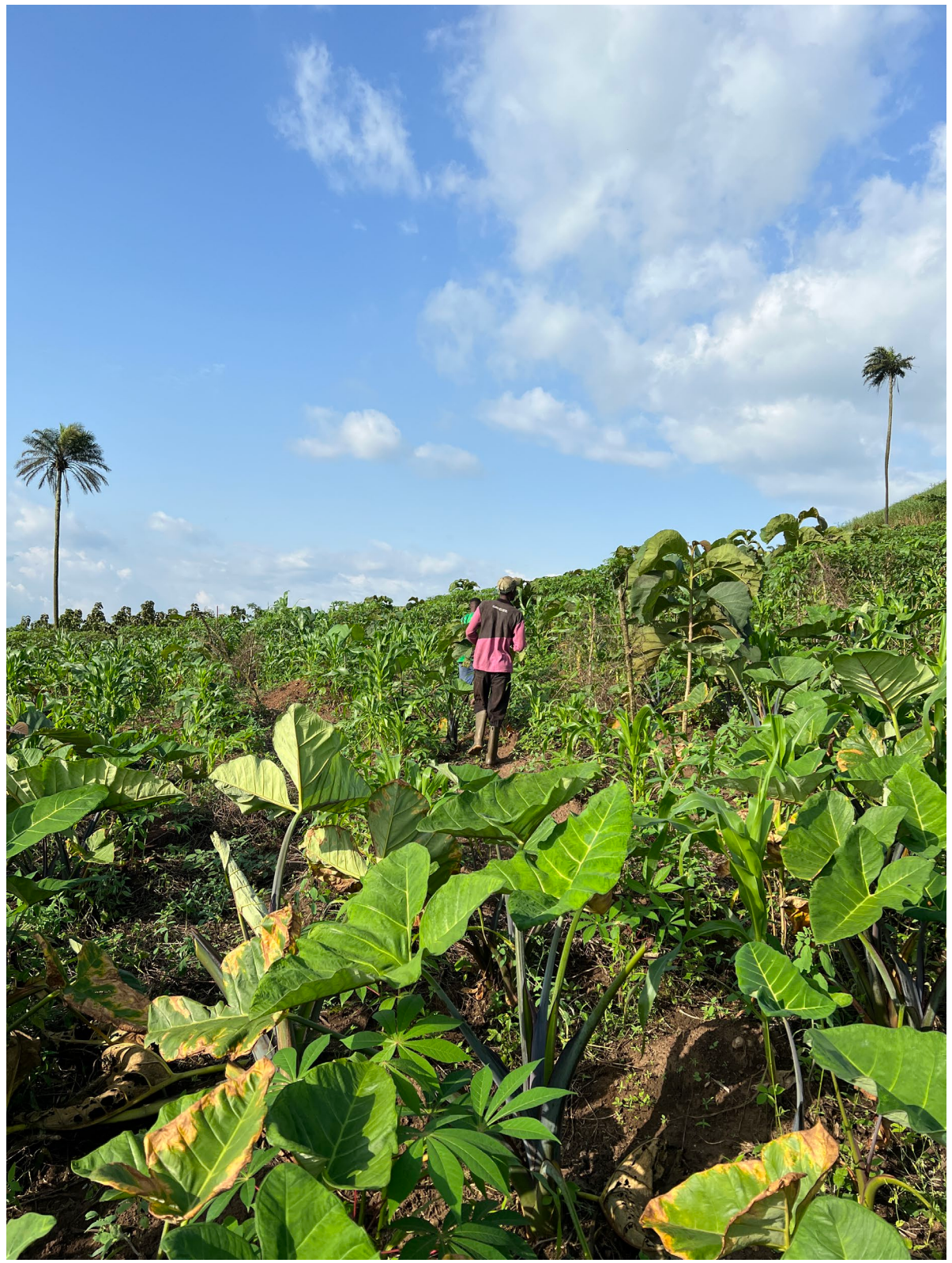
Farmer nurturing seedlings.