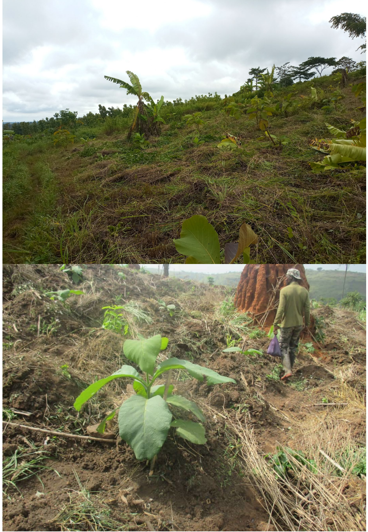
Assorted trees & farmer nurturing young seedlings.