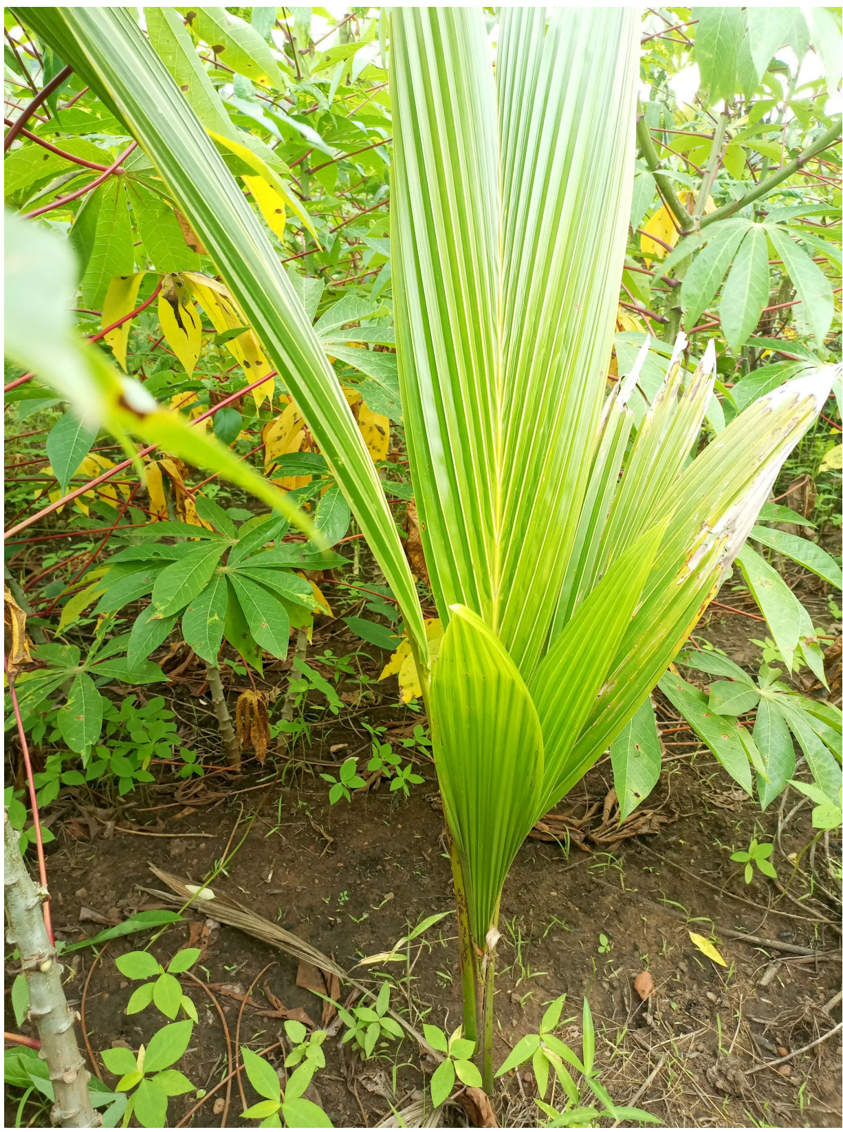
NTFP Coconut in farm.