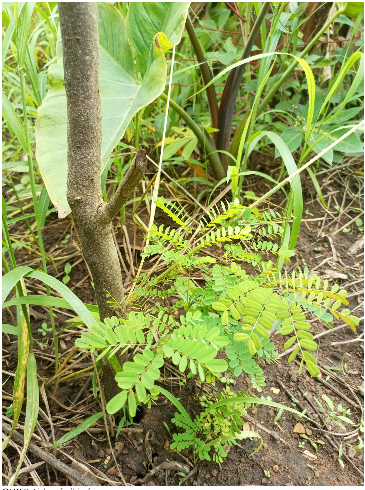
CNTFP Aidan fruit in farm.