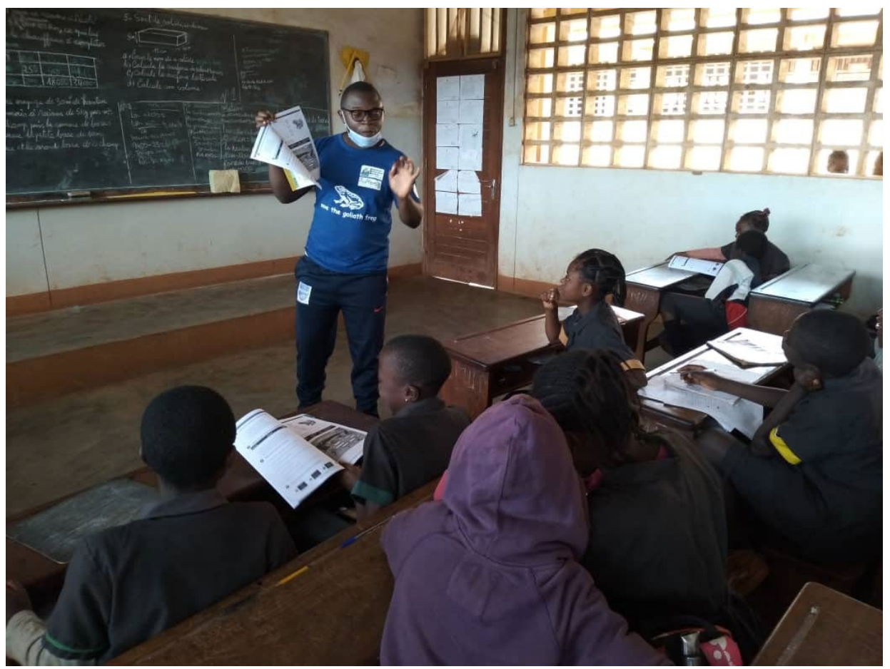
Figure 14: Pupils during an education session

Students were trained on the need to conserve amphibians and Goliath frogs. This project engaged about 1245 students in schools of the Division harbouring the Goliath frog. Students received prizes and incentives to increase their interest in the conservation of amphibians and the Goliath frog. These were interested and pledged to be ambassadors of Goliath frog in their communities.