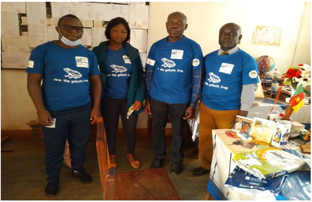
Figure 6: meeting with some primary school officials