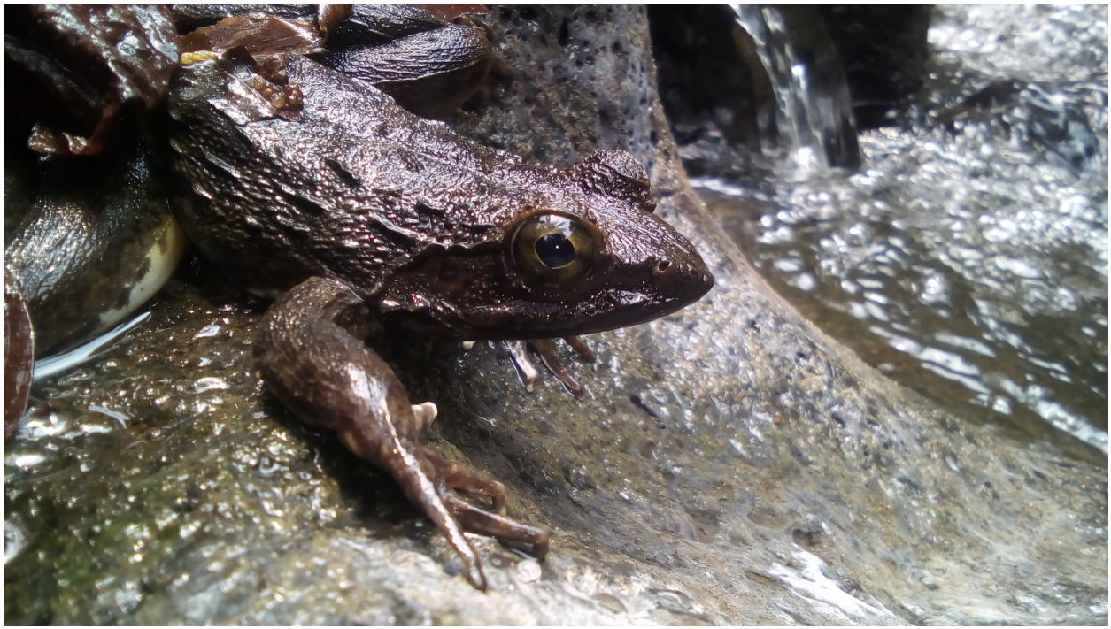
Figure 4: Juvenile Goliath frog

The conservation output of this project involves locating several breeding populations of Goliath frogs. These were observed with individuals of different ages (Figure 4).