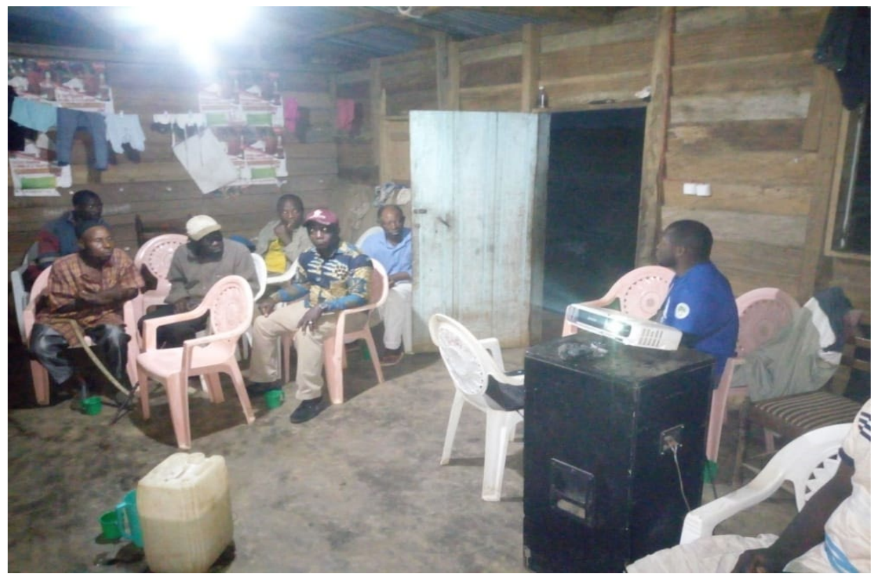
Figure 5: Awareness raising