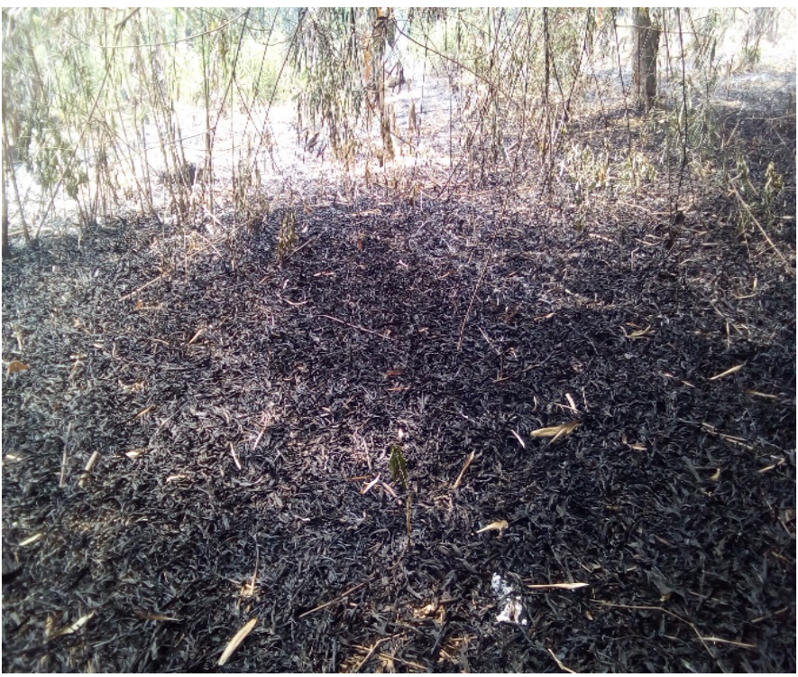
Figure 13: Bush fire by a water body harbouring Goliath frogs