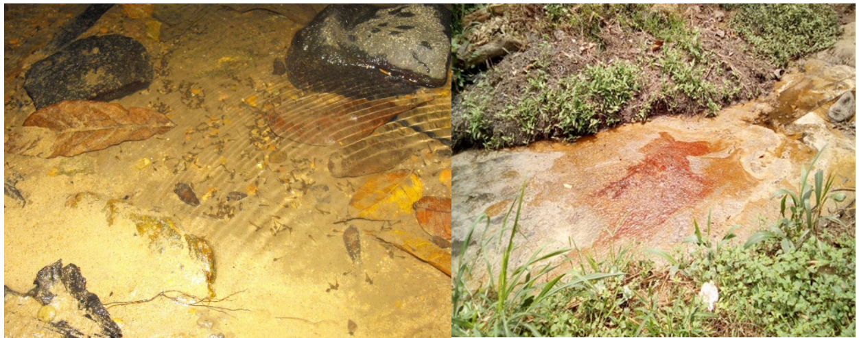
Figure 11: Observed tadpoles of Goliath frog. Figure 12: Spill off of palm nut processing into the main water body

like Epiminbang and Nko'olong provide more insight into the population of this giant with a clay fit. This frog is known to be fond of fast-flowing water bodies depending on these for feeding, reproduction and care of the young ones. Breeding sites were recorded during this project with constructed nests harbouring various cohorts of tadpoles at different growth levels (Figure 11). These were mainly observed at the pic of the dry season (February and March). Besides these, unfortunately, degradation of habitat was also observed. Mainly due to farming activities such as processing of palm nuts into oil, bush fire and laundering directly into water bodies (Figure 12, Figure 13).