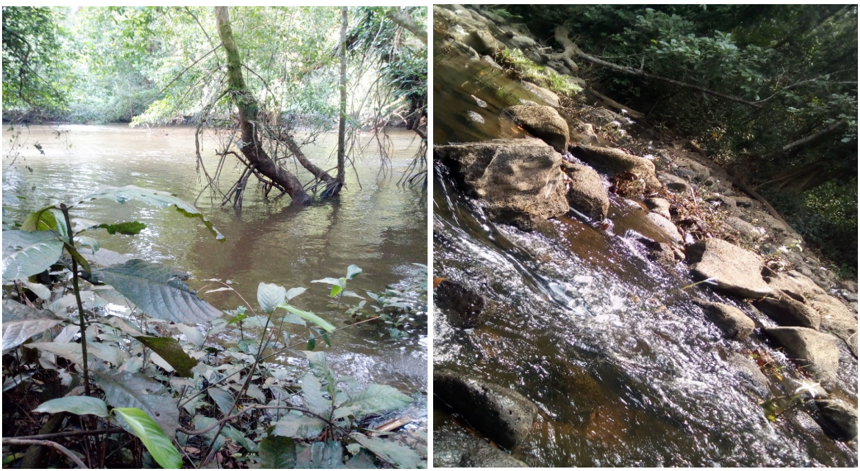
Figure 2: Goliath frog's habitat surveyed

The reconnaissance survey method (visual and acoustic encounter survey (VES & AES method) was used. We surveyed several sites across Manjo, Loum and Njombe-penja in Moungo. A total of twelve sites were surveyed.