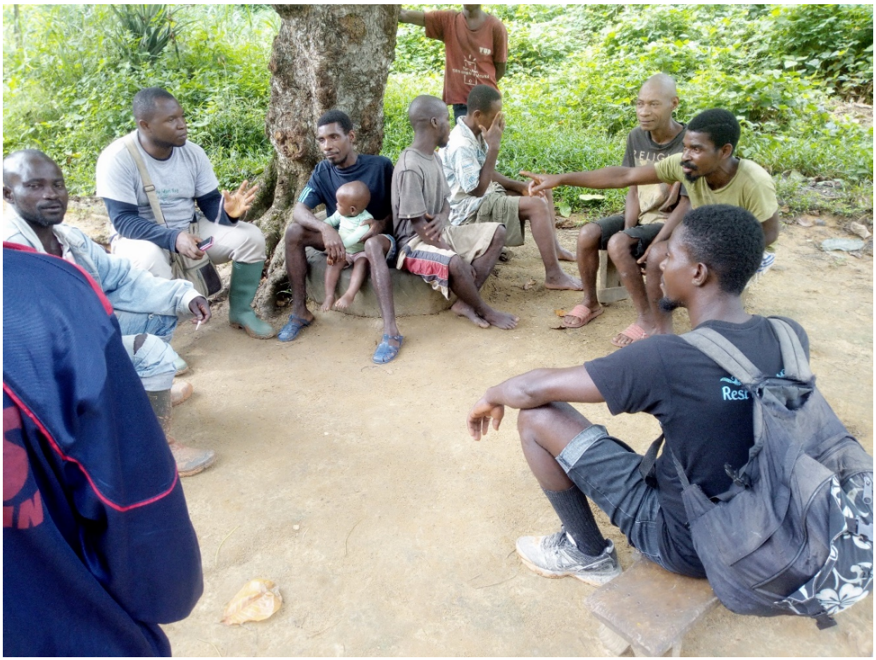
Figure 7: Meeting in Nko'o long

We could engage a total of 264 farmers and 10 known hunters of Goliath frogs in 8 different communities. (Mangamba, Ebone, Manengole, Manjo, Loum, Njombe-Penja, Nko'o long, Epimimbang). Farmers were educated on the need to prefer the use of organic fertilizers to chemical ones to improve the yield of the crop. Farmers were told to recycle all their organic waste to produce compost for their crops. They were also told to prevent washing their equipment into running water, especially the one with pesticides and fertilizers. Farmers processing palm nuts directly into the runoff were also advised to use different ways to treat a little bit of their runoff to reduce the pollution of the water bodies by their activities.