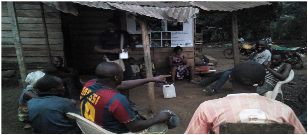
Figure 9: Community meeting in Mangamba

An intense community conservation campaign was organized to educate stakeholders on the need for the sustainable conservation of amphibians and their habitats. The education activities included conservation talks, presentations, broadcasting of local cultural drama on amphibian-related topics in schools and communities. Community meetings (Figure 9) were also conducted in the local language to further educate the communities on amphibian Conservation issues.