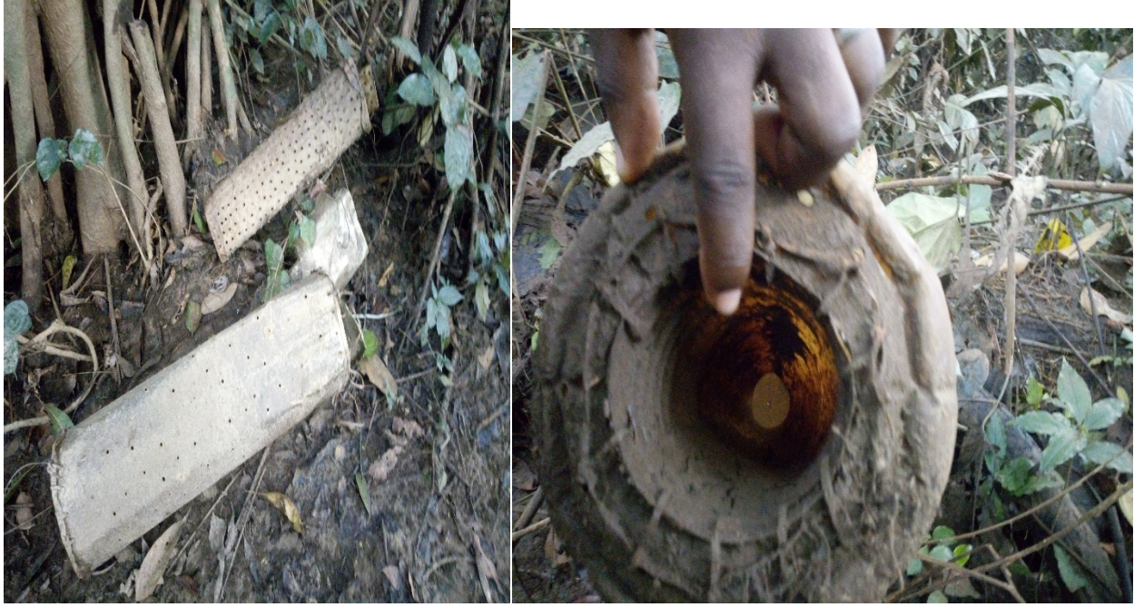
Figure 8: Traps used by hunters

An intense community conservation campaign was organized to educate stakeholders on the need for the sustainable conservation of amphibians and their habitats. The education activities included conservation talks, presentations, broadcasting of local cultural drama on amphibian-related topics in schools and communities. Community meetings (Figure 9) were also conducted in the local language to further educate the communities on amphibian Conservation issues.