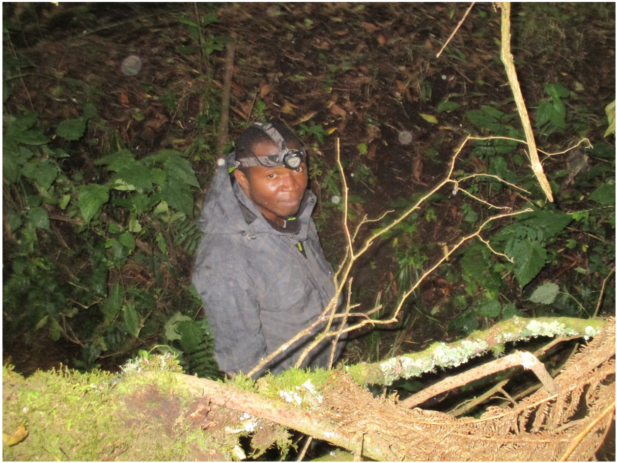
Figure 3: Investigator during fieldwork