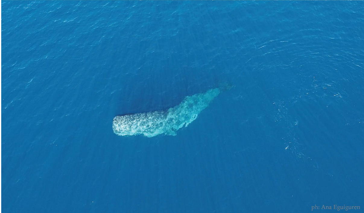
ph: Ana Eguiguren