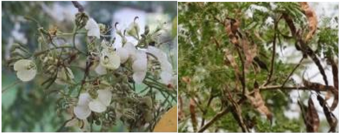
Left: Flowers of Amburana cearensis. Right: Leaves and fruits of Parapiptadenia excelsa.