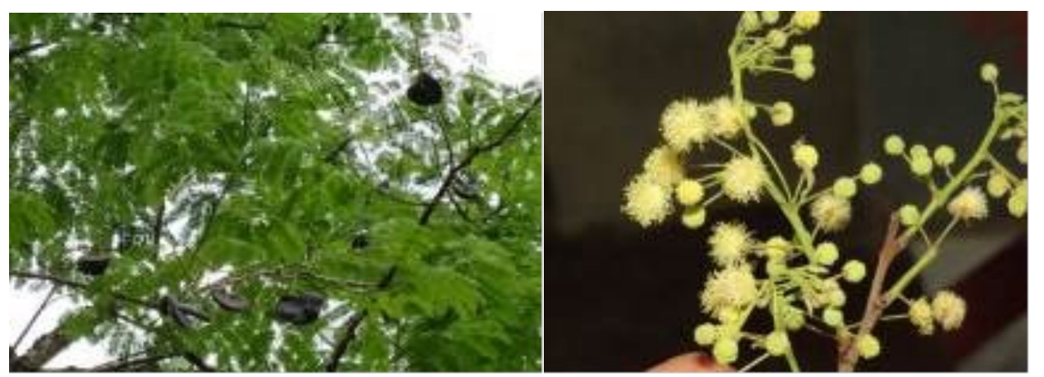
Left: Fruits of Enterolobium contortisiliquum. Right: Flowers of Anadenanthera colubrina.