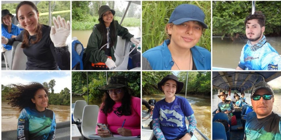
Figure 1. People involved on the environmental DNA sampling from Costa Rica Sawfish project during 2021.