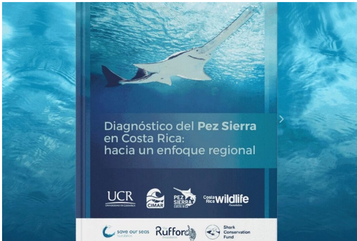
Figure 4. Book Diagnóstico del Pez Sierra en Costa Rica: hacia un enfoque regional (EN: Diagnosis of Sawfish in Costa Rica: towards a regional approach) published in March 2022. https://online.flippingbook.com/view/278623880/