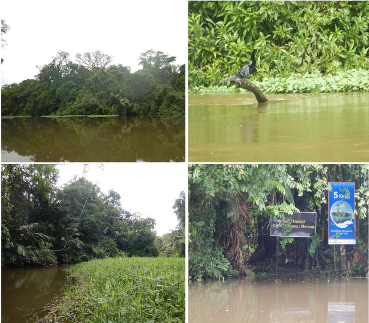
Figure 8. Sampling area Tortuguero, a National Park since 1970 according to the National System of Conservation Areas.