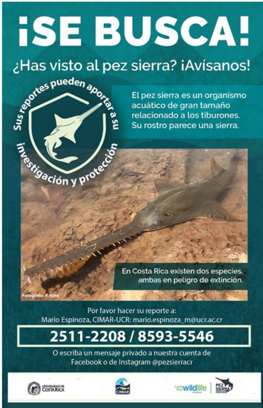
Figure 3. Release campaign of the Large-tooth Sawfish launched in March 2022.