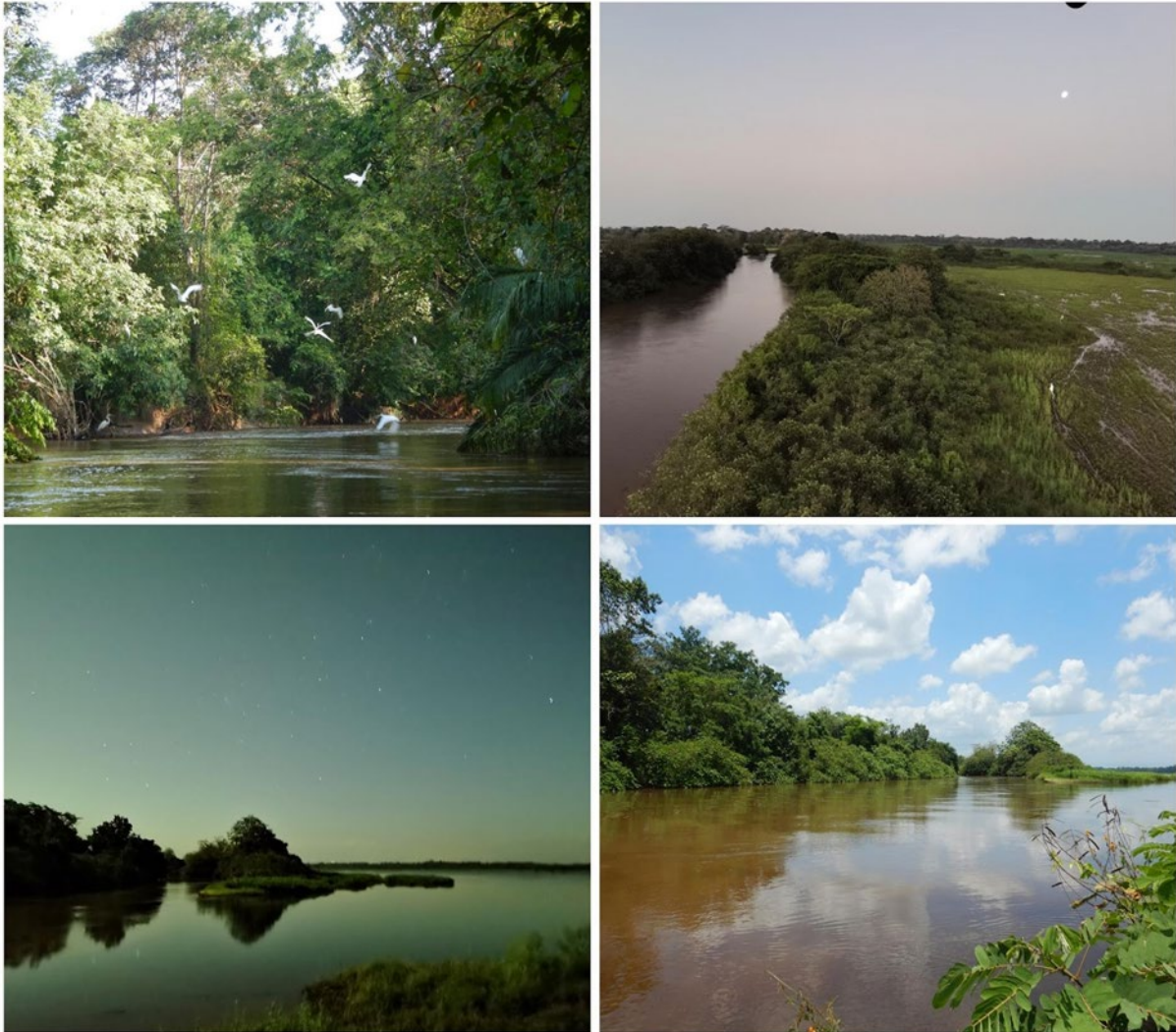
Figure 9. Sampling area Caño Negro, a National Mixed Wildlife Refuge since 1984, according to the National System of Conservation Areas and a RAMSAR site according to the UNESCO.