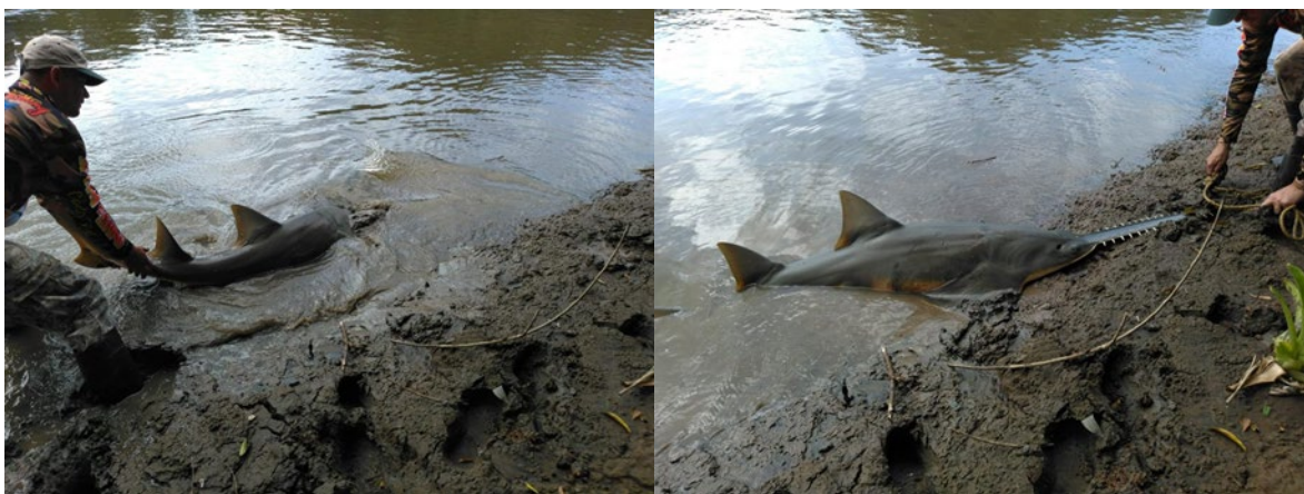
Figure 10. Large-tooth Sawfish release at Boca San Carlos reported to our project the date 03/04/2022.