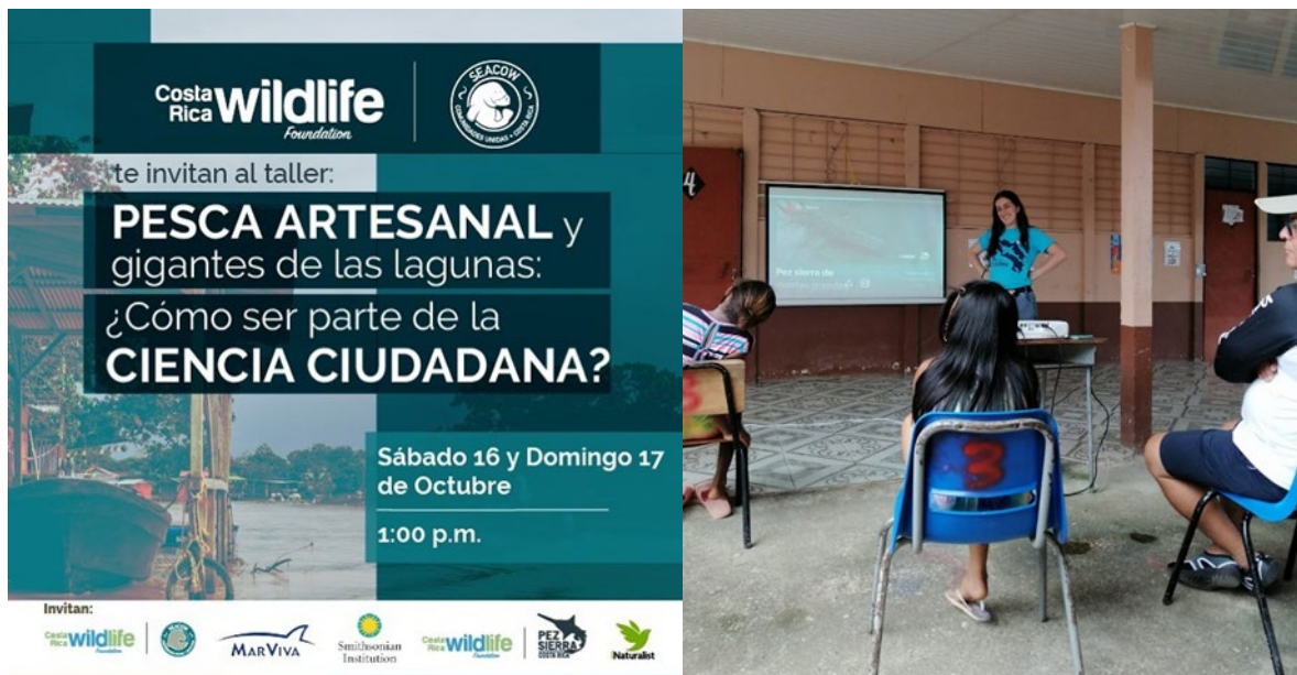
Figure 5. Workshop Pesca artesanal y gigantes de las lagunas: ¿Cómo ser parte de la ciencia ciudadana? (EN: Artisanal fishing and giants of the lagoons: How to be part of citizen science?) in October 2021.