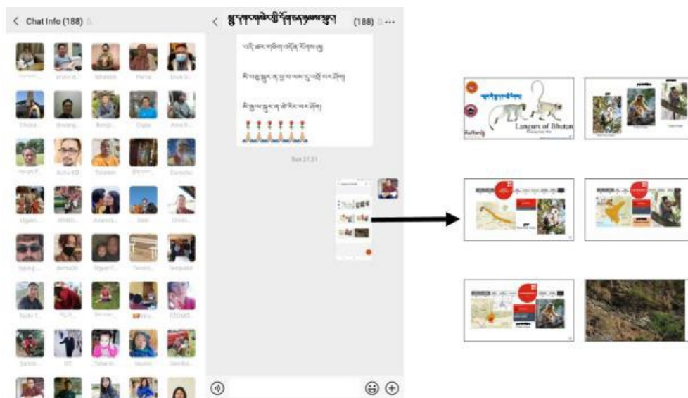
Figure 1. WeChat and number of group members participated.

The main component of the programme included the training on basic ecology of golden langur, wildlife species and bird watching. Students were taught on how to respond when they encounter golden langur, count the number, identify the gender and basic feeding ecology (Figure 5).