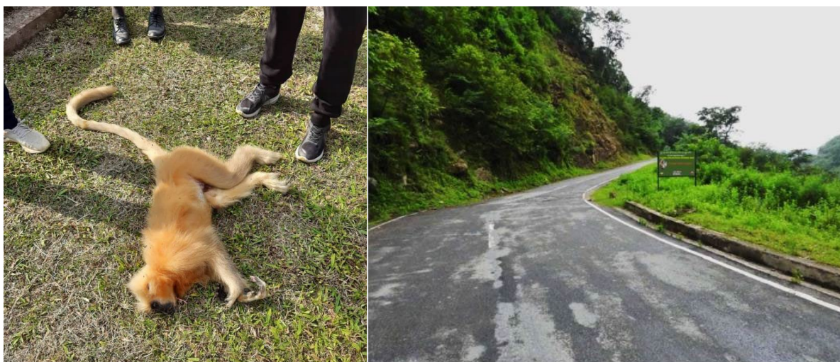
Figure 2. Golden langur (Male) killed at Dangdung, Trongsa District. Figure 3. The signage along the highway to alert motorists.