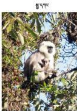
Nepal Gray Langur