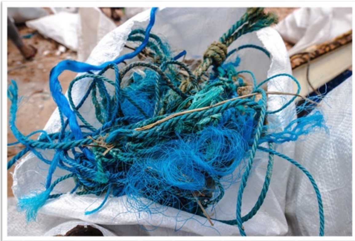
Figure 9. Waste separation. Fishing material.