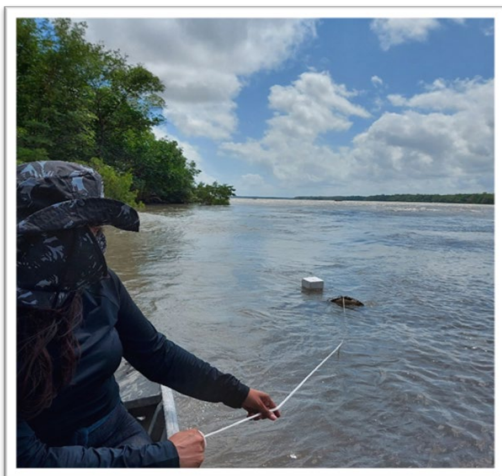
Figure 2. Horizontal drags were performed in the sub-surface layer of the water column, using a conical-cylindrical network.