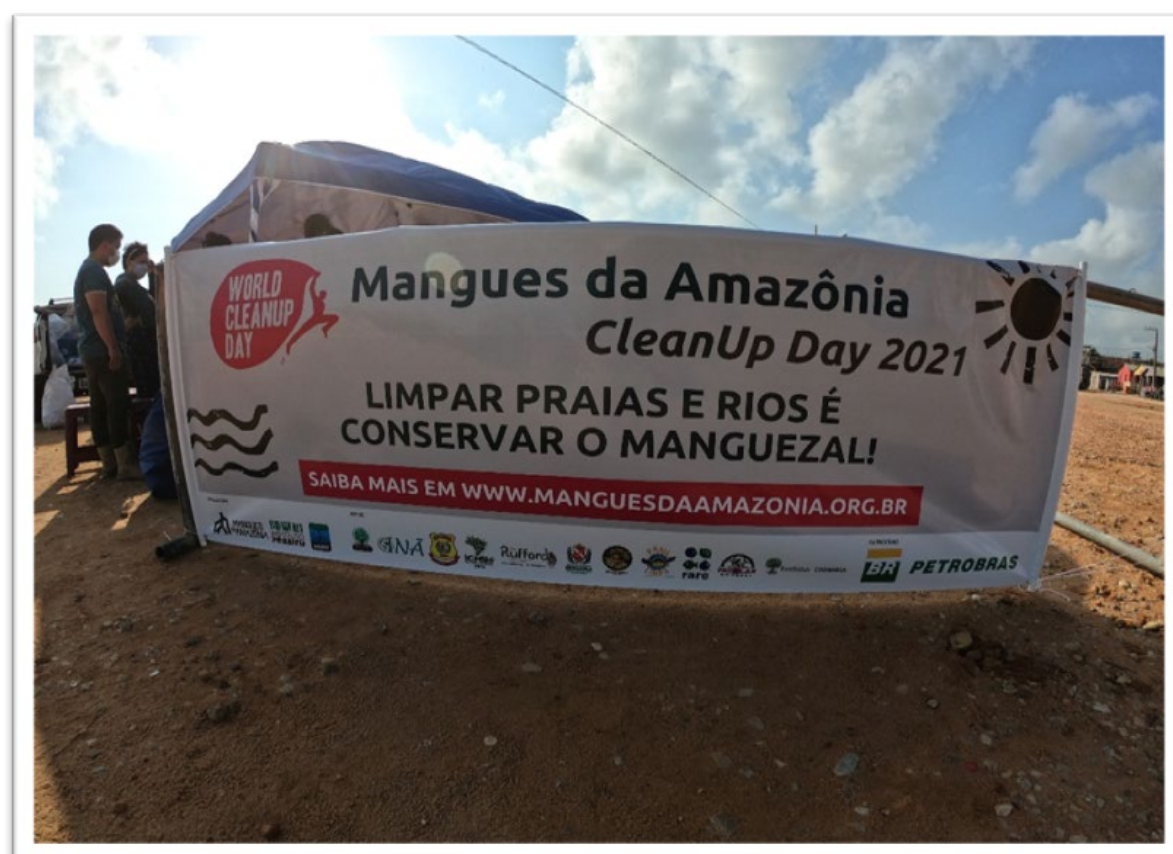
Figure 7. Mangues da Amazônia Clean-up Day 2021, © Dayene S Mendes.

All collected waste was quantified, separated, and sent to the Cooperative Recyclable Material Collectors – COOMARCA (Figures 9 and 10), where waste is segregated and resold, generating socioeconomic benefits for the cooperative