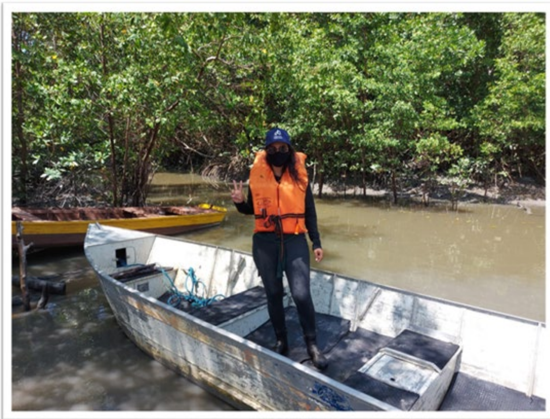
Figure 1. The team that will accompany all field trips in the Ajuruteua Peninsula, Bragança, Pará - Brazil.