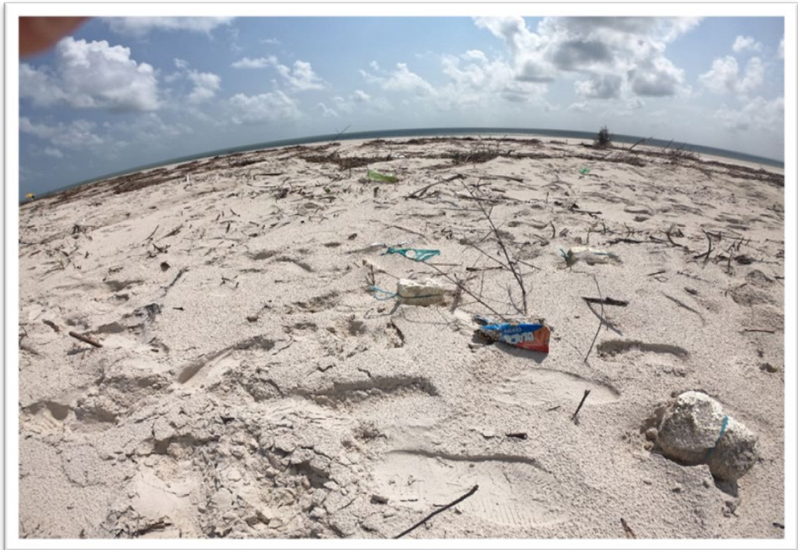
Figure 8. Waste found along Ajuruteua Beach, Bragança, Pará, Brazil.

members. Waste that is not recyclable and that is already in the process of decomposition is sent to the Bragança Landfill, where it receives an environmentally correct destination.