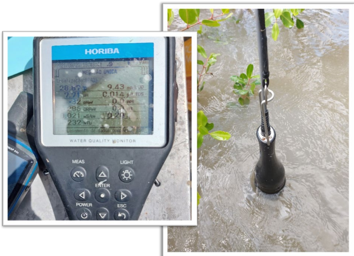
Figure 4. Vertical profiles of physicochemical water parameters using a multiparameter probe.