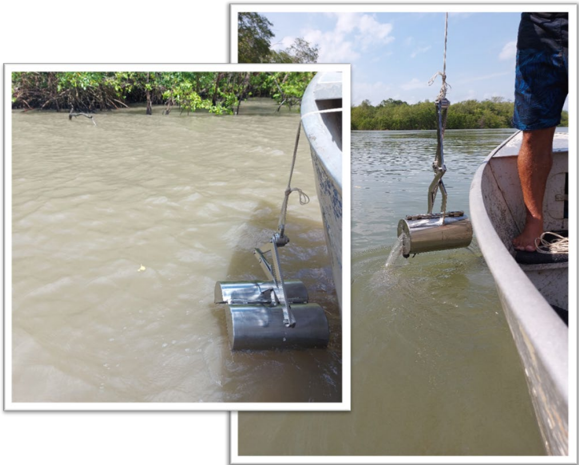
Figure 6. Sediment samples in an aluminium bucket.