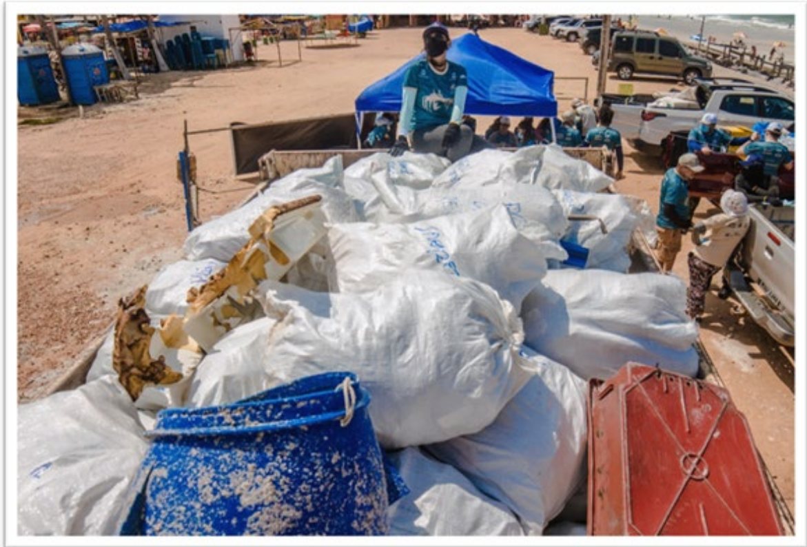
Figure 10. Separated and packaged material for the final destination.