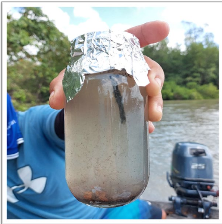
Figure 3. Water sample in glass flask covered with aluminium foil.