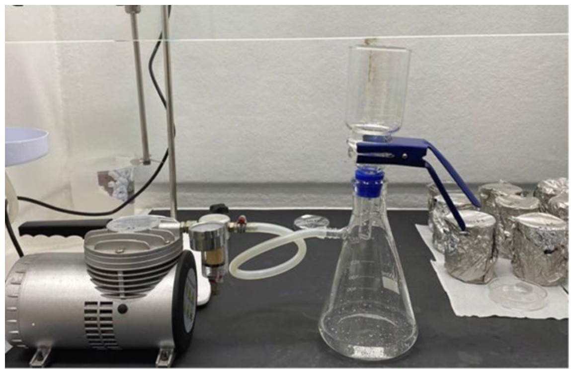
Figure 3. Assembly of material for the vacuum filtration process inside the laminar flow hood.