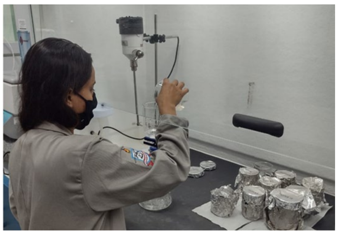
Figure 4. Filtering water samples.