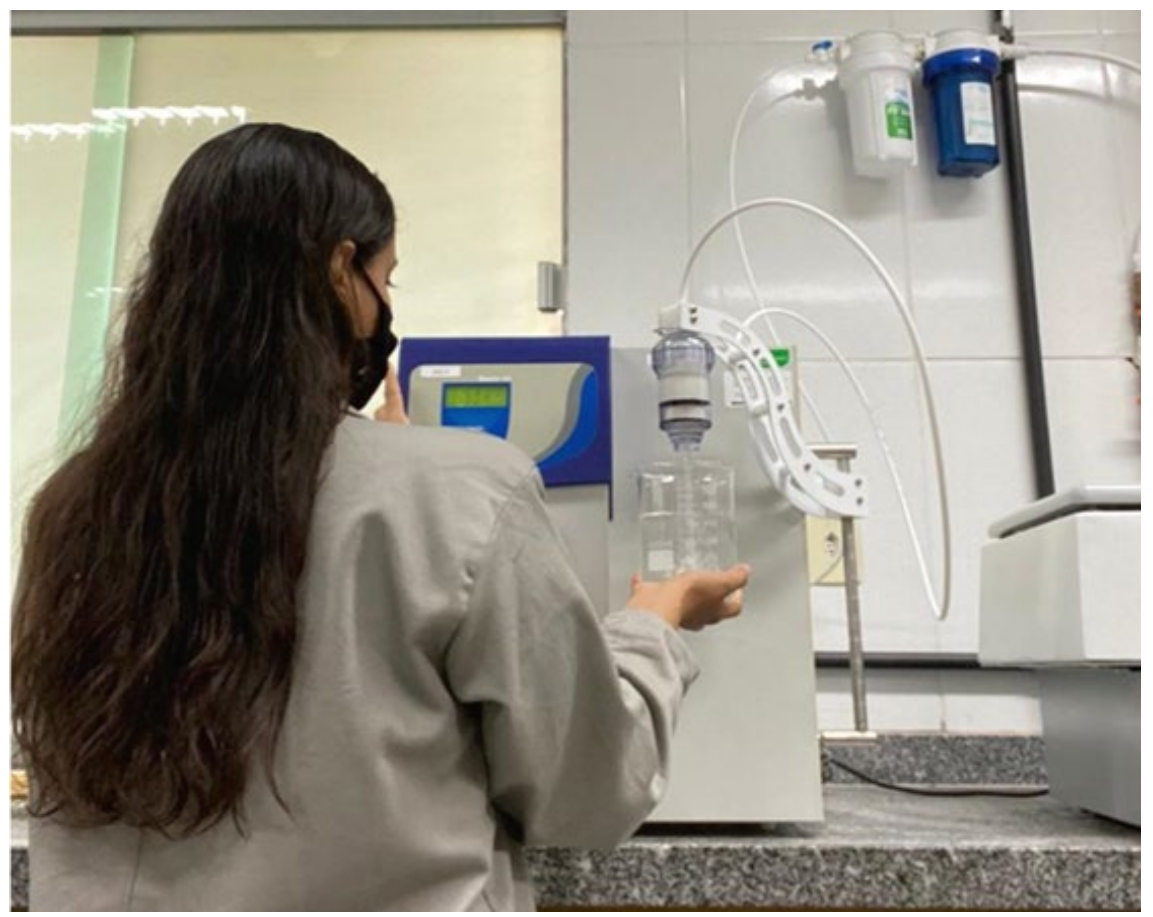
Figure 2. Use of Ultrapure Water for all phases of the research.