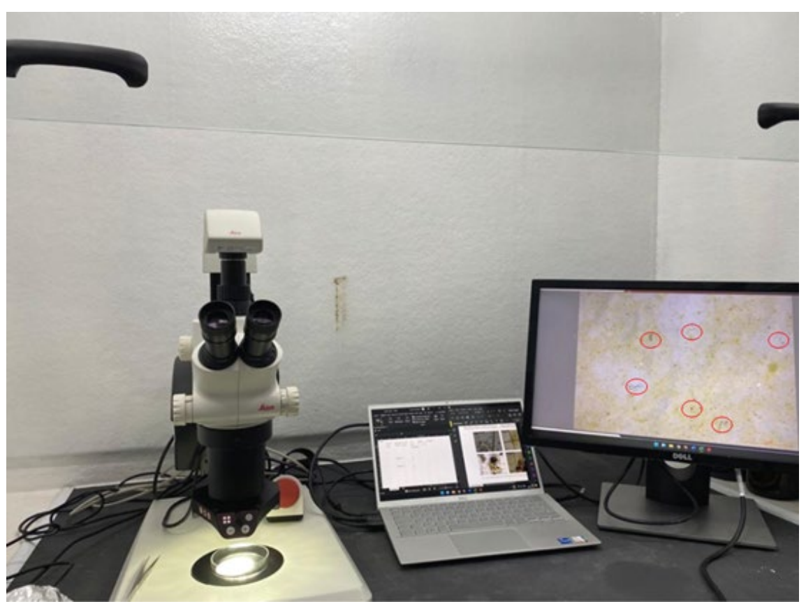
Figure 5. Analysing, under a stereoscopic microscope, the presence of plastic particles in water samples.