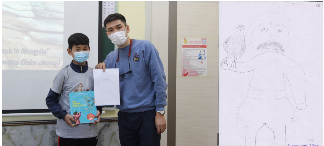
Figure 8. Winner for "Hand Drawing" competition level 8<sup>th</sup> grade.