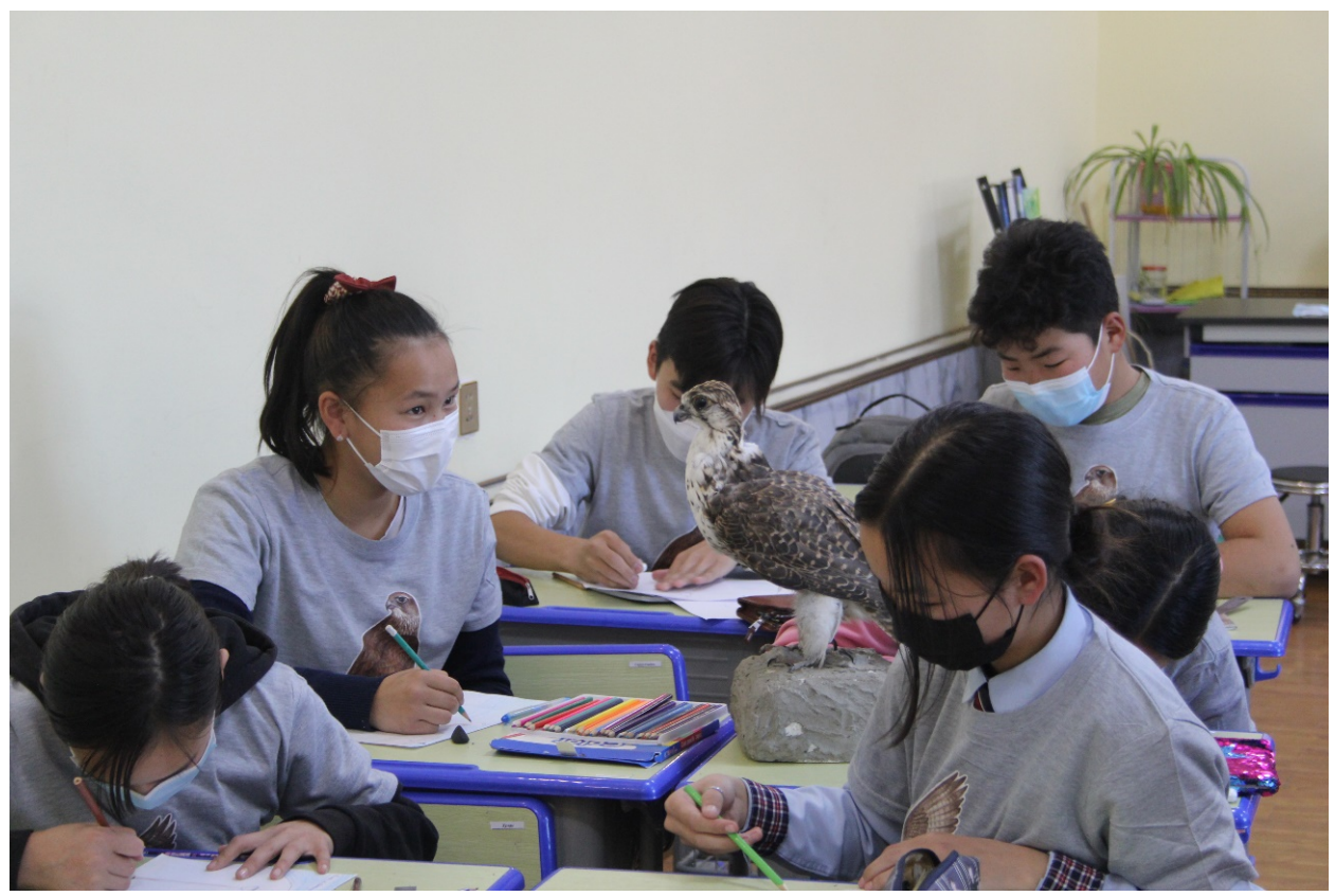
Figure 6. All students have participated in "Hand Drawing" competition.