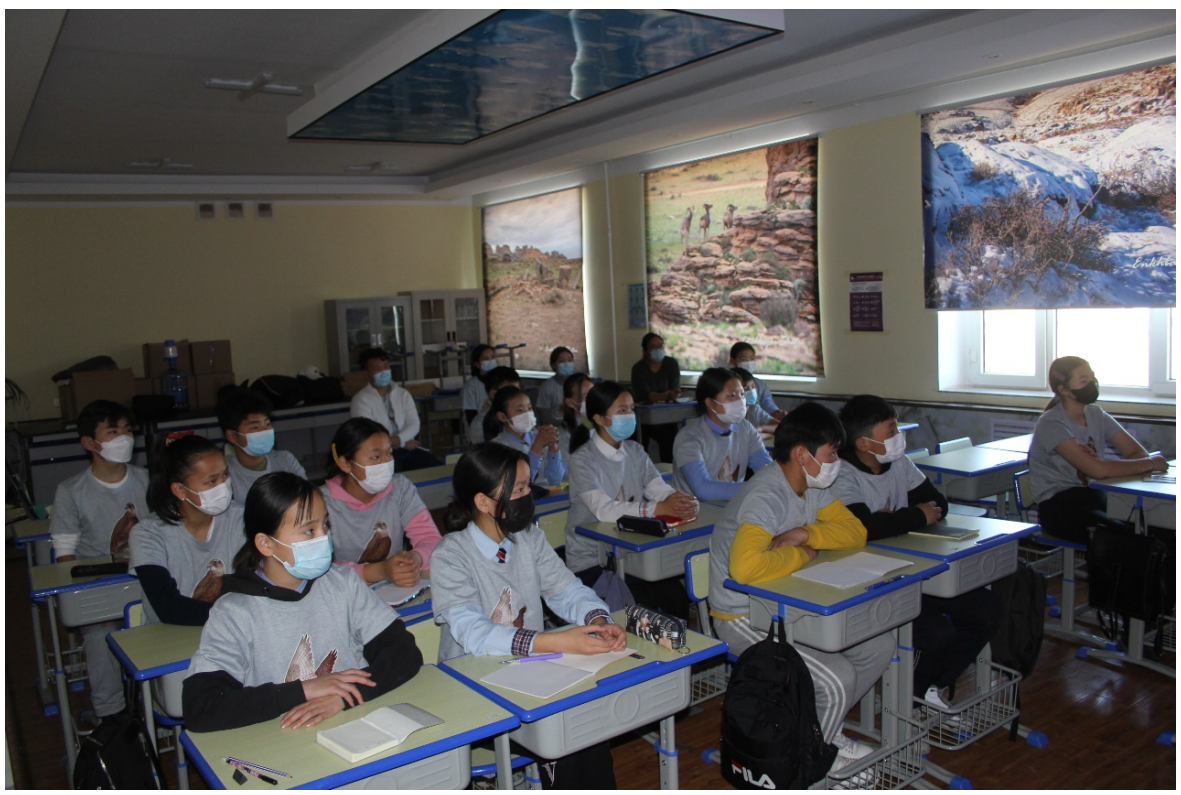
Figure 5. The class focusing on NEW and CRUCIAL information.