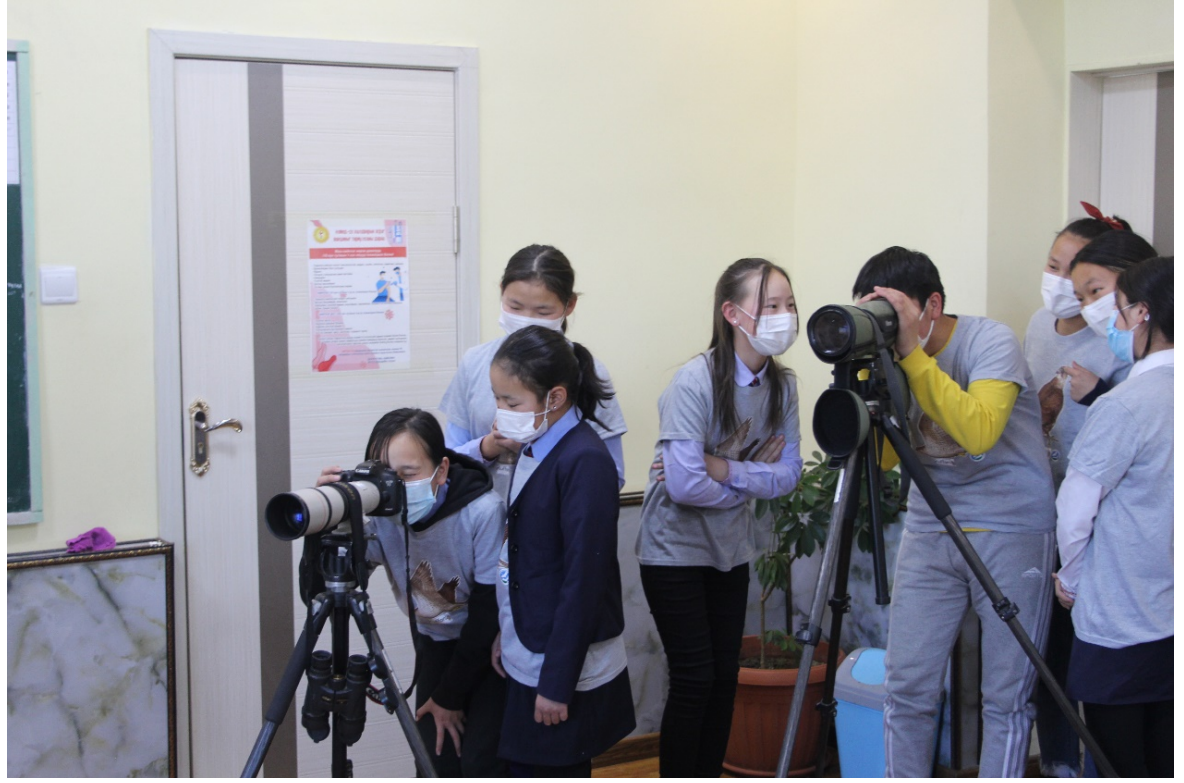
Figure 4. During workshop students got familiar with field equipment of Avian research.