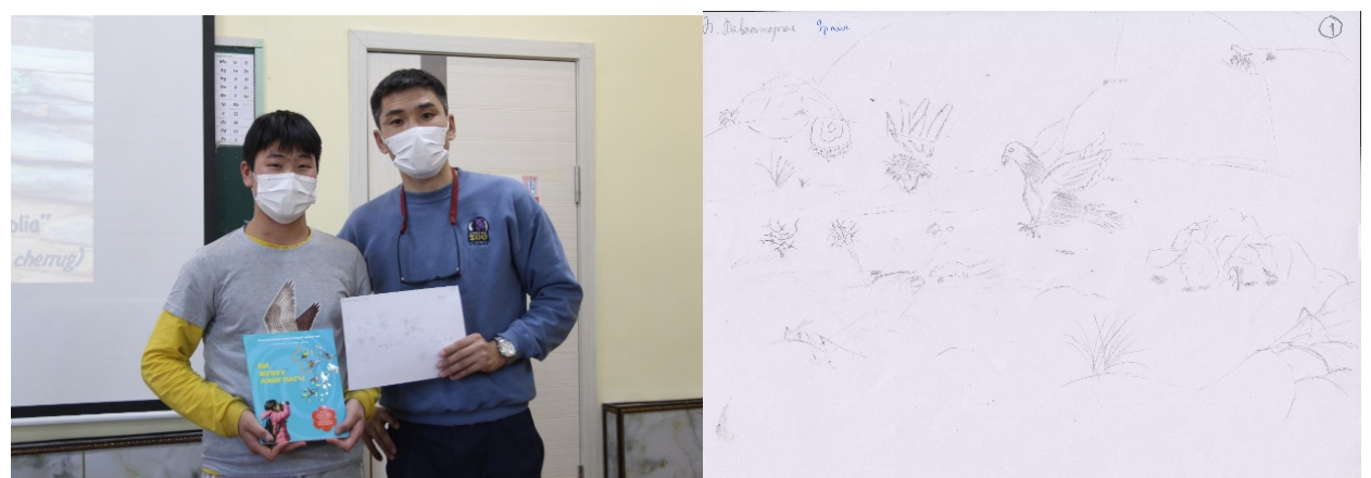
Figure 9. Winner for "Hand Drawing" competition level 9<sup>th</sup> grade.