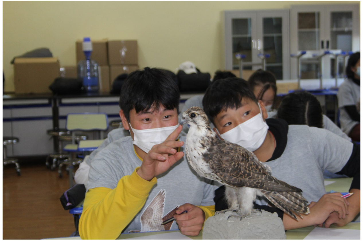
Caption for cover photo: Students from Dalanjargalan village middle school with stuffed Saker Falcon. Photo taken on 14<sup>th</sup> of Oct 2021.