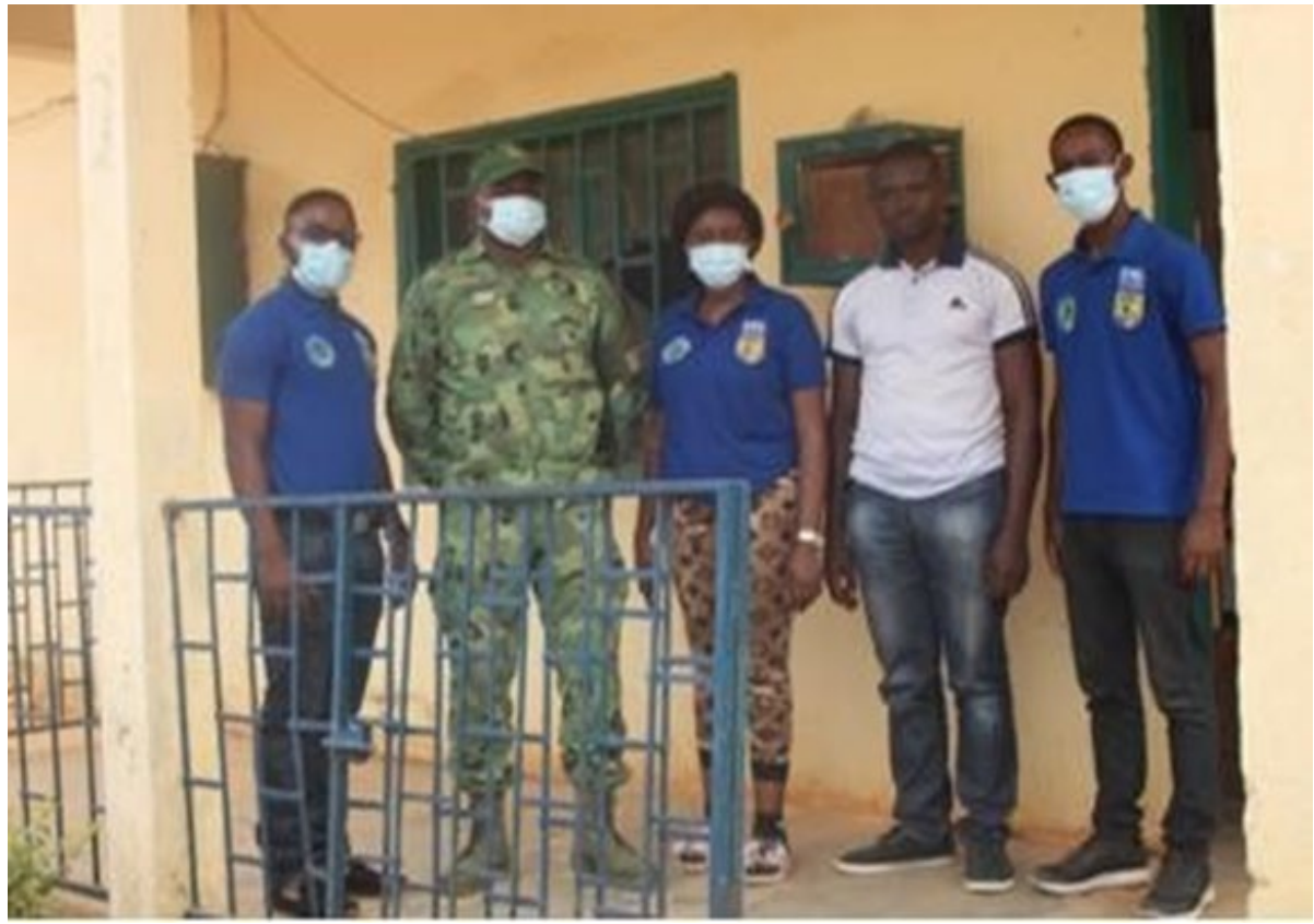
Meeting of the team with the Mpem et Djim NP Conservator