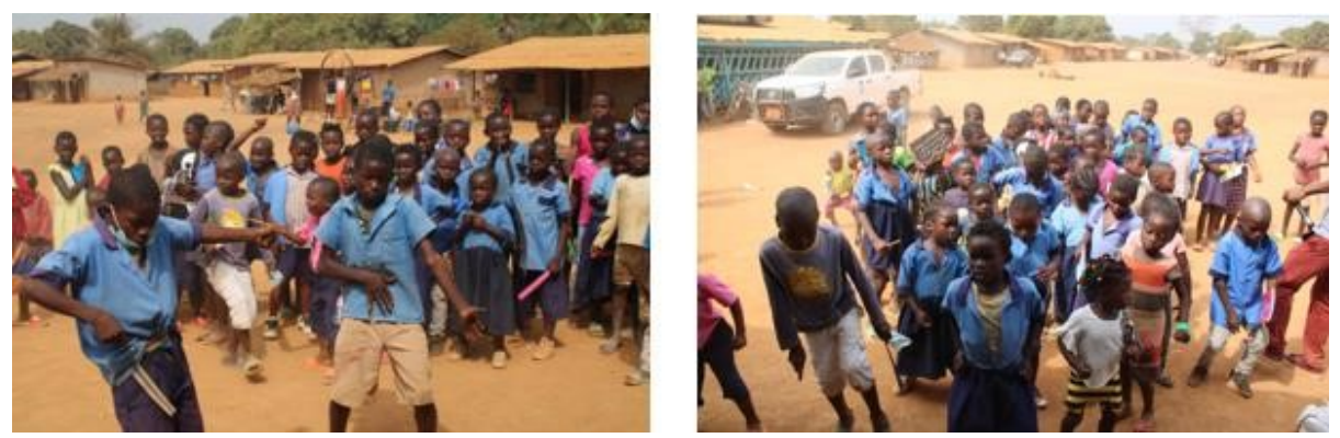
Youths expressing their happiness through dancing

Almost all students that attended the presentations and oral questions received at least one school material as a souvenir of the 2021 WPD and they expressed happiness through dancing