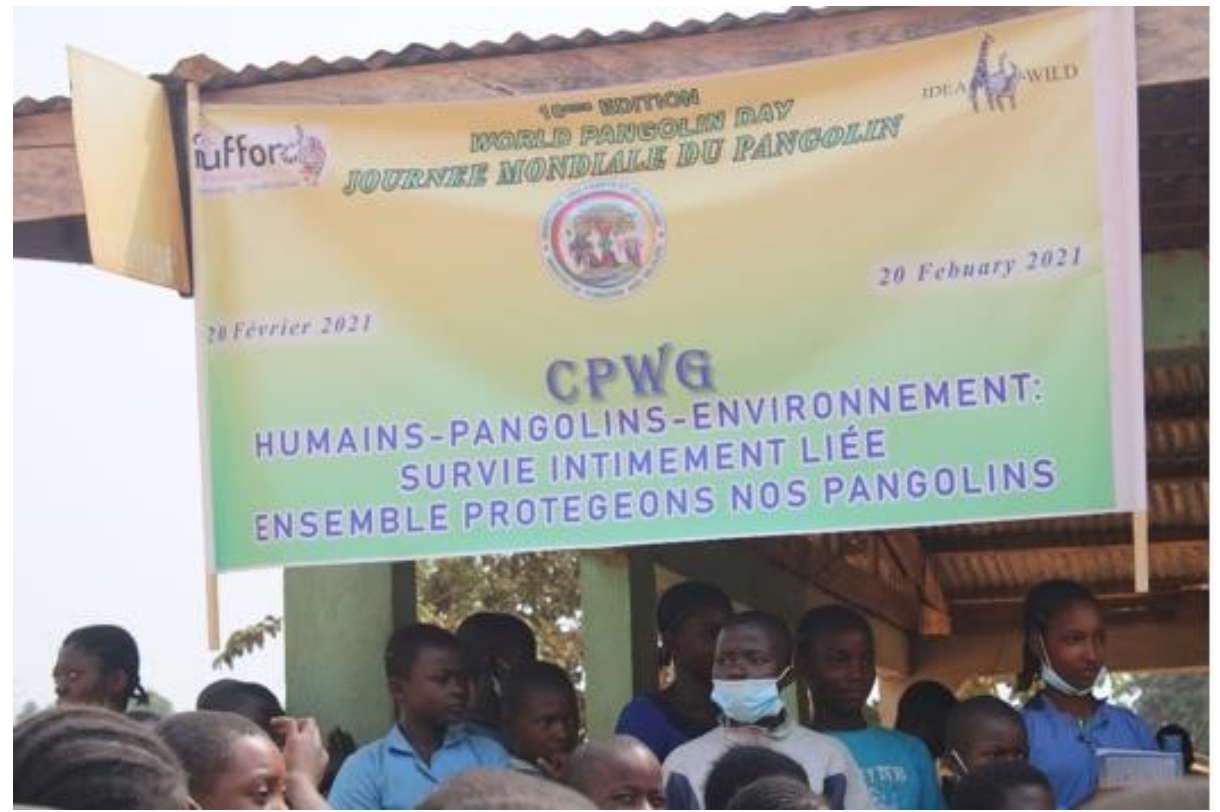
Banner with the theme and slogan of 2021 WPD

Many administrative authorities of the village were present at the event this include Chief of the gendarmerie company, park management staff members, religious authorities, Director of the primarily school and Principal of the secondary school, primary and secondary school teachers and students. Together with the population they all attended the presentation on the ecological roles of pangolins and the importance of protecting pangolins from overharvesting. To achieve this section, we used a PowerPoint presentation, short videos with educative messages. We first introduce some wildlife conservation concept and ended with the importance of protecting pangolins. We also made banners and additional ones were provided by CABAG. Those banners were displayed in various places including the secondary school where they left after the activities to ensure a long-term education.