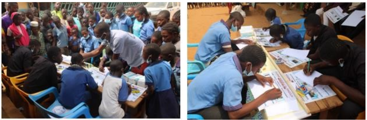
Youths of both primary and secondary schools of Linté at the drawing workshop

Many students participated at the drawing section and were asked to draw one of the pangolins species occurring in Cameroon which are the giant pangolin, the white-bellied pangolin and the black-bellied pangolin. Six winners received special reward for encouragement and were further chosen to volunteer as pangolin ambassadors in their school and the village.