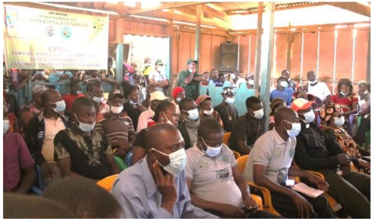
Public at the PowerPoint presentation and educative program