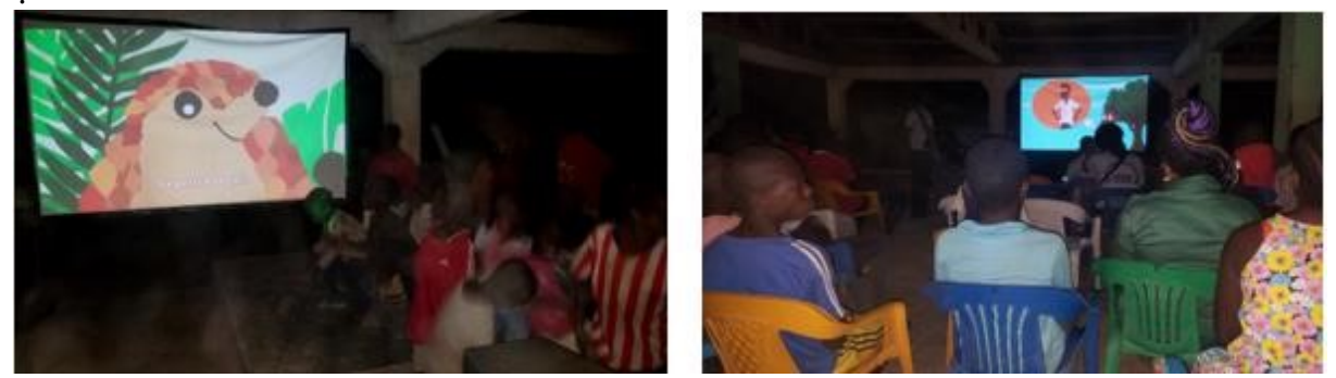
Youths' participation to short educative videos

Short educative videos on pangolins was provided by WildAid a member of the CPWG and they were used for sensitization. The participants learned about the efforts made elsewhere to conserve pangolins. Children were happy and dancing the African song for baby "Le Petit Pangolin malin" available online from YouTube <a href="https://www.youtube.com/results?search_query=le+petit+pangolin+malin">https://www.youtube.com/results?search_query=le+petit+pangolin+malin</a>