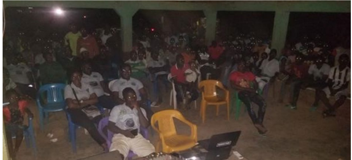
Public attending the film EYE OF THE PANGOLIN broadcasting at Linté