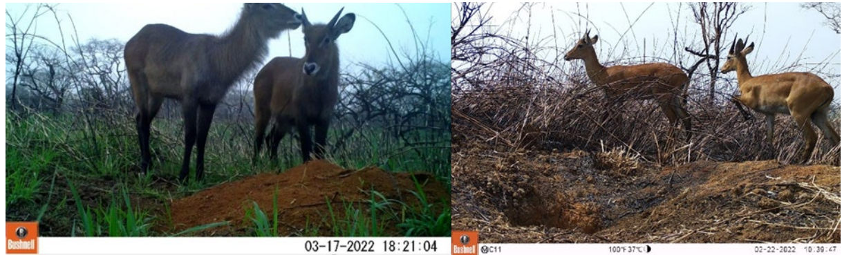
Left: Defassa waterbuck. Right: Kob

Appendix: Photos of other recorded wildlife species