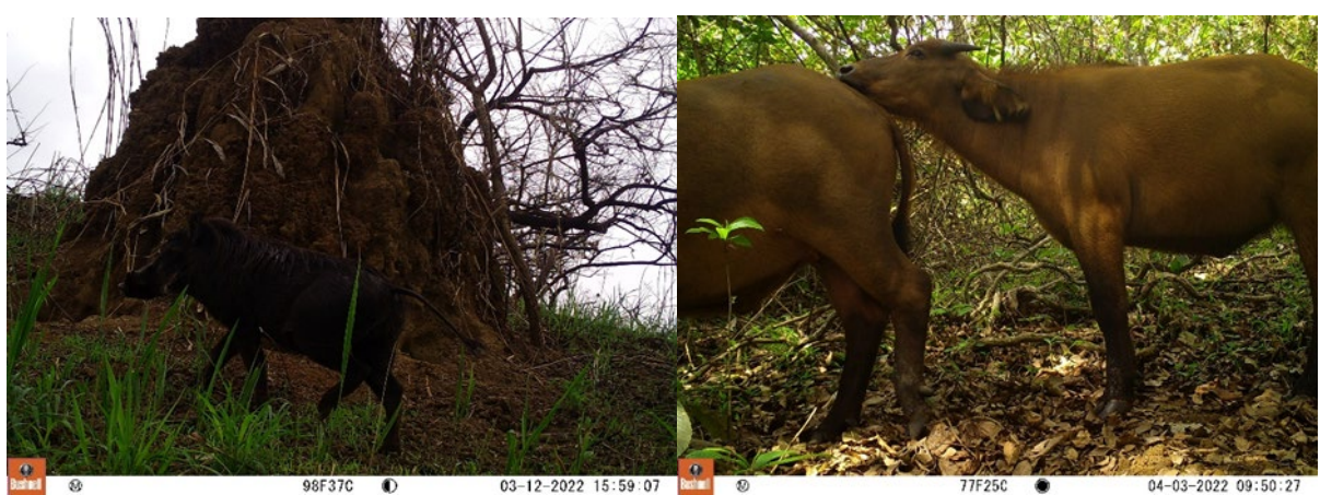
Left: Warthog. Right: Savannah Buffalo