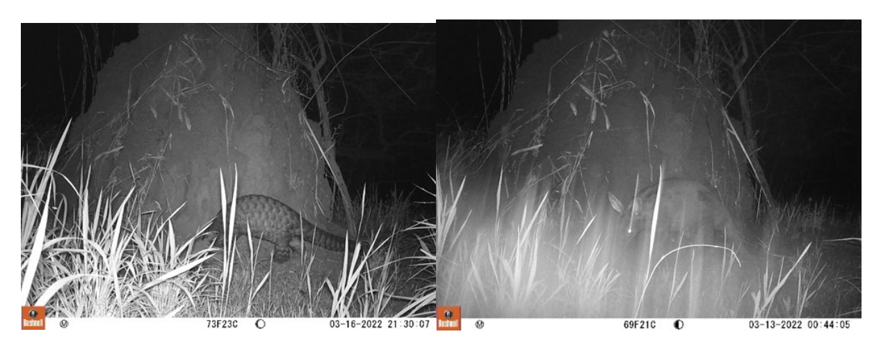
Figure: Giant pangolin and aardvark visiting the termite mound three days apart