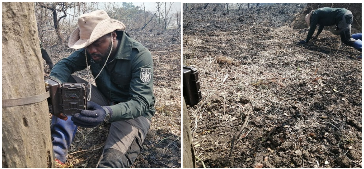
Figure 3: (a) installation of a camera trap on a tree to monitor a potential giant pangolin / aardvark location (b) crawling test to check correct functioning and correct angling of camera traps.

The deployment of cameras was made following the protocol for medium to large sized mammals (Ahumada et al., 2011; Bruce et al., 2018). Camera traps were strapped to trees or on poles, perpendicular to pangolin targeted locations at a distance of 3.5 to 4 m with the aim of obtaining full-body lateral images of animals passing in front (Fig. 3). Cameras were set on photo and video mode. Those set on photo mode were programmed to take three consecutive photos for each trigger event with the lower delay between consecutive trigger whilst camera set on video mode were programmed to take a 15-second video with no delay between consecutive triggers.