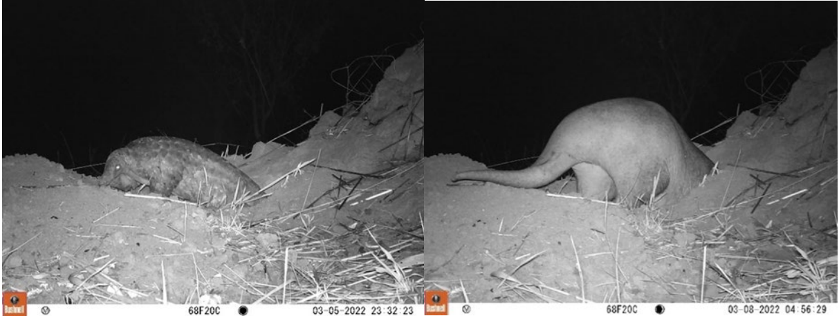
Figure: Giant pangolin and aardvark visiting the same burrow two days apart

We recorded a total of three giant pangolin at three different sites and 13 aardvark detection at seven different sites. Aardvark co-occurred at all stations where the giant pangolin was recorded. Giant pangolin and aardvark were recorded at one living burrow just 2 days apart. Both species were photographed visiting (entering and exiting) the burrow, but they remained only a few seconds in the burrow and left the site afterward. Both species were also photographed at the same termite mound 3 days apart. While the aardvark only inspected the termite mound and left, the giant pangolin was seen entering a burrow that was situated at the basis of the termite mound. We did not obtain sufficient detection of both species to elaborate on their cohabitation, but they seem to display a moderate spatial and temporal separation.