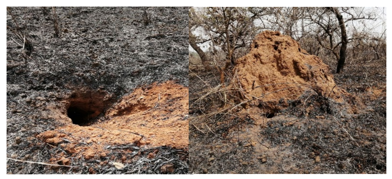
Figure 4: (a) targeted locations chosen for the placement of camera-traps (a) termite nest (b) living burrow.

Potential locations for the deployment of camera-traps include feeding sites that were mostly termite mounds and living burrow that were holes duck on the ground with a diameter ranging from 40 to 70 cm (fig. 4)