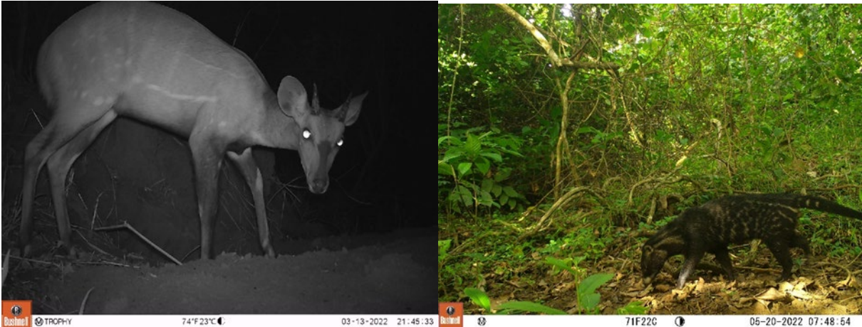
Left: Male Bushbuck. Right: African civet