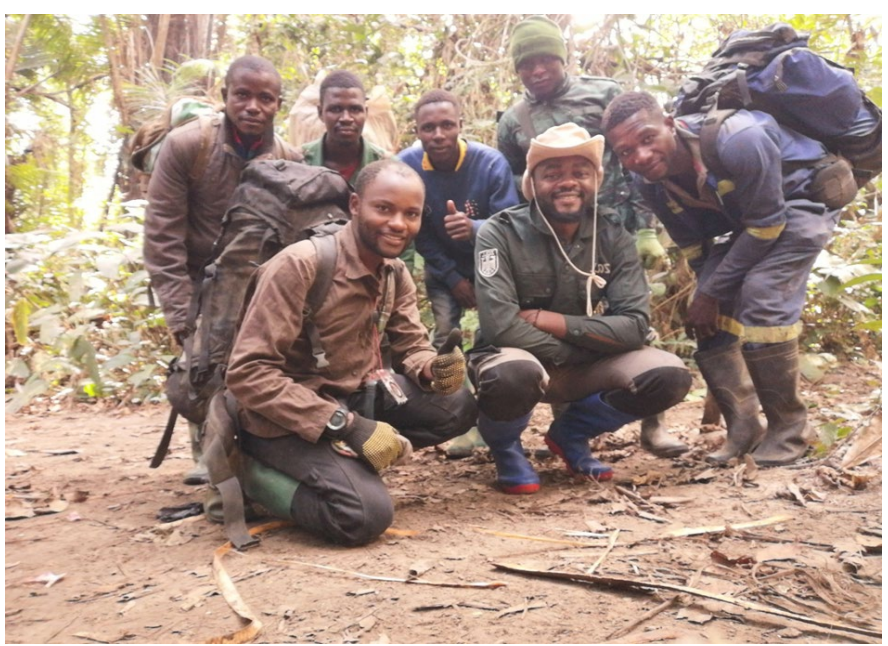
Survey team at the entrance of Mpem et Djim National Park