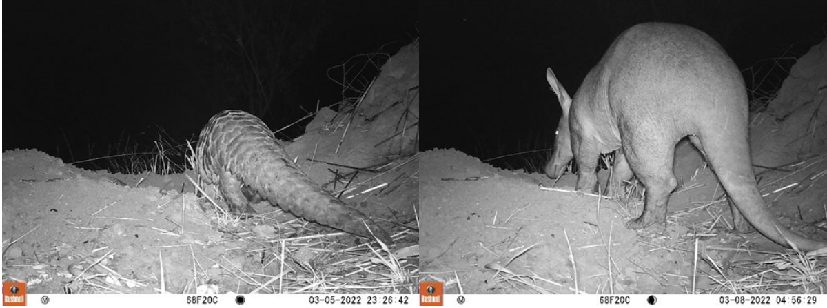
Giant pangolin and Aardvark visiting the same burrow

Left: Blotched genet. Right: Serval inspecting a giant pangolin/aardvark burrow