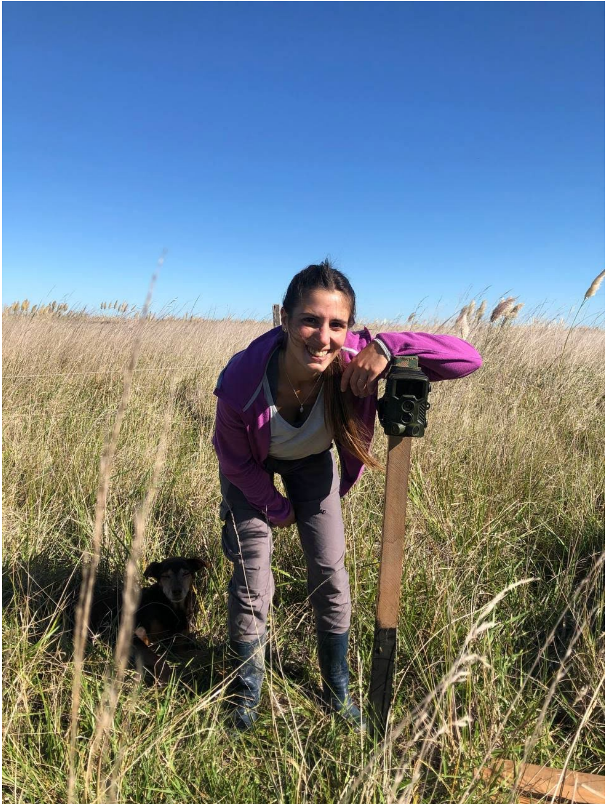
Figure 2: Camera trap.