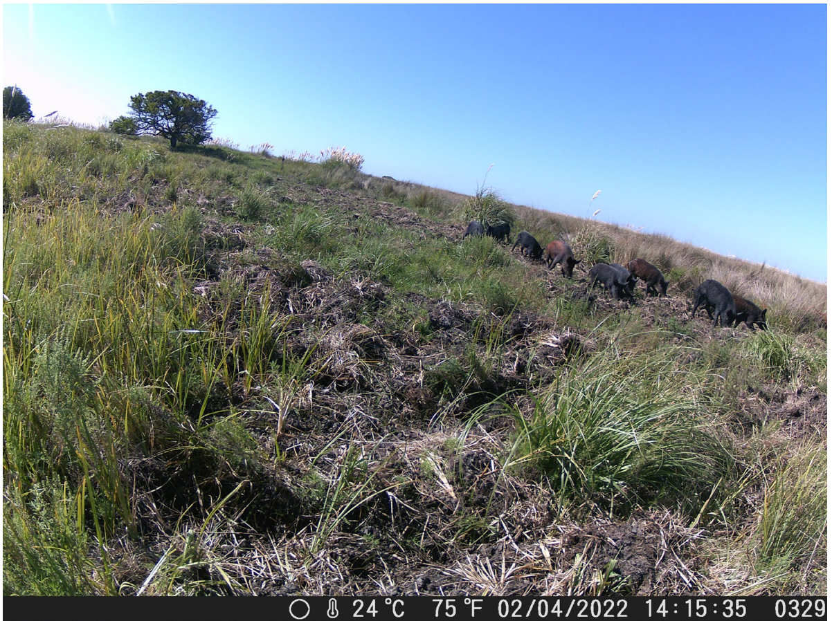
Figure 4: Wild boars feeding.