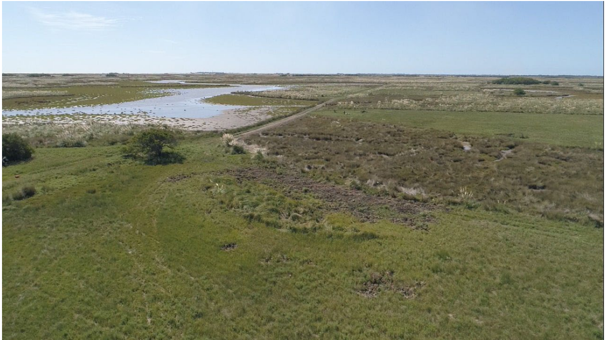
Figure 3: Large disturbance.