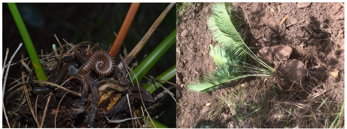
Left: Figure 7 Millipede inhabiting at the base crown of leaves. Right: Figure 8 Young plants were uprooted by wild boar

Socio-economic developmental activities are common in the nearby areas, but do not possess direct threat to Cycas population in the area. Activities for hydropower project on the other side of the river, Dangmechu (Figure 1) are completely cut off by the river. Other activities like road construction was away from the area where Cycas plant was recorded.