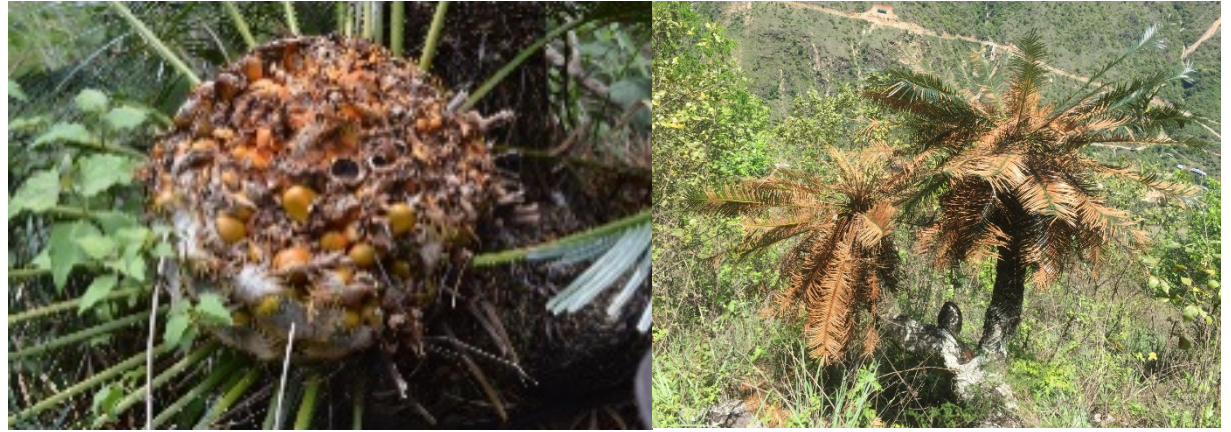
Left: Figure 9 Seeds damaged by wild boar. Right: Figure 10 Tree with leaves drying for no obvious reasons

Socio-economic developmental activities are common in the nearby areas, but do not possess direct threat to Cycas population in the area. Activities for hydropower project on the other side of the river, Dangmechu (Figure 1) are completely cut off by the river. Other activities like road construction was away from the area where Cycas plant was recorded.