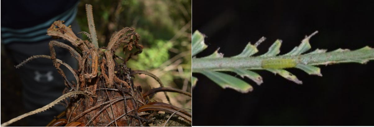
Figure 6 Tender leaves were bored and eaten by larva rom Lepidoptera insect group