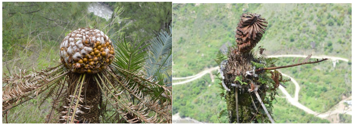
Left: Figure 2 Female cone with still enclosed ovules. Right: Figure 3 Remnants of male cone from previous year.

On average 28 plants were counted in each quadrat. Our estimation of total plants within the study site boundary is approximately 6000 individual plants within ~8 km<sup>2</sup> area. The distribution of plants is not uniform but shows a significant relationship with elevation (p value 0.045 and R^2 =0.51), with increasing density towards lower elevations (Figure 4). Similarly, more mature plants are observed from lower elevations compared to younger plants at higher elevations. Regeneration of young plants was equally observed from both seeds and bulbils (Figure 5).