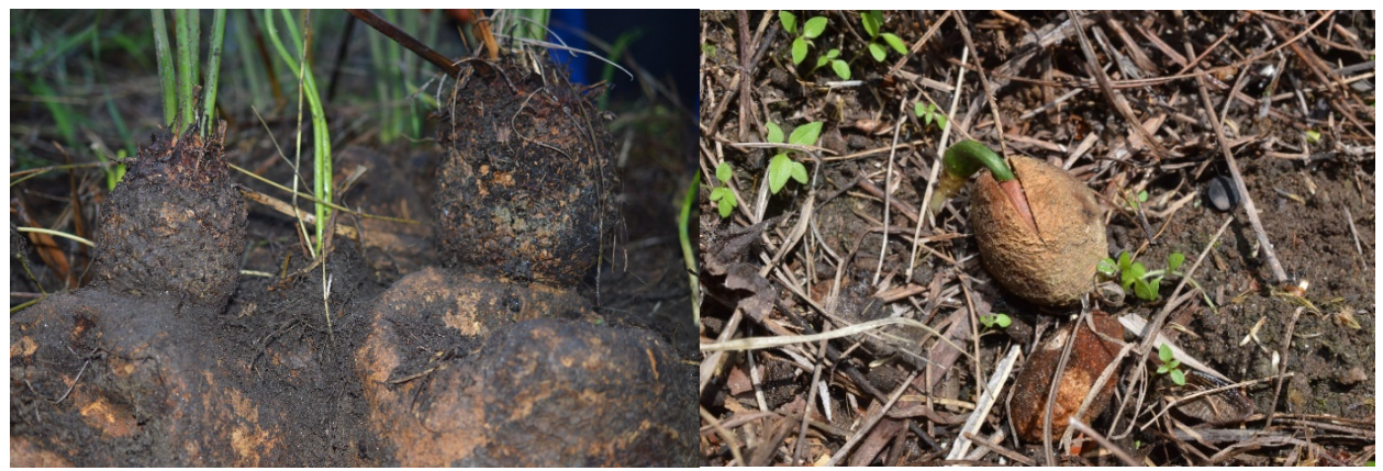
Figure 5 Sprout of young stem developing from bulbils (Left) and seed germination (Right)