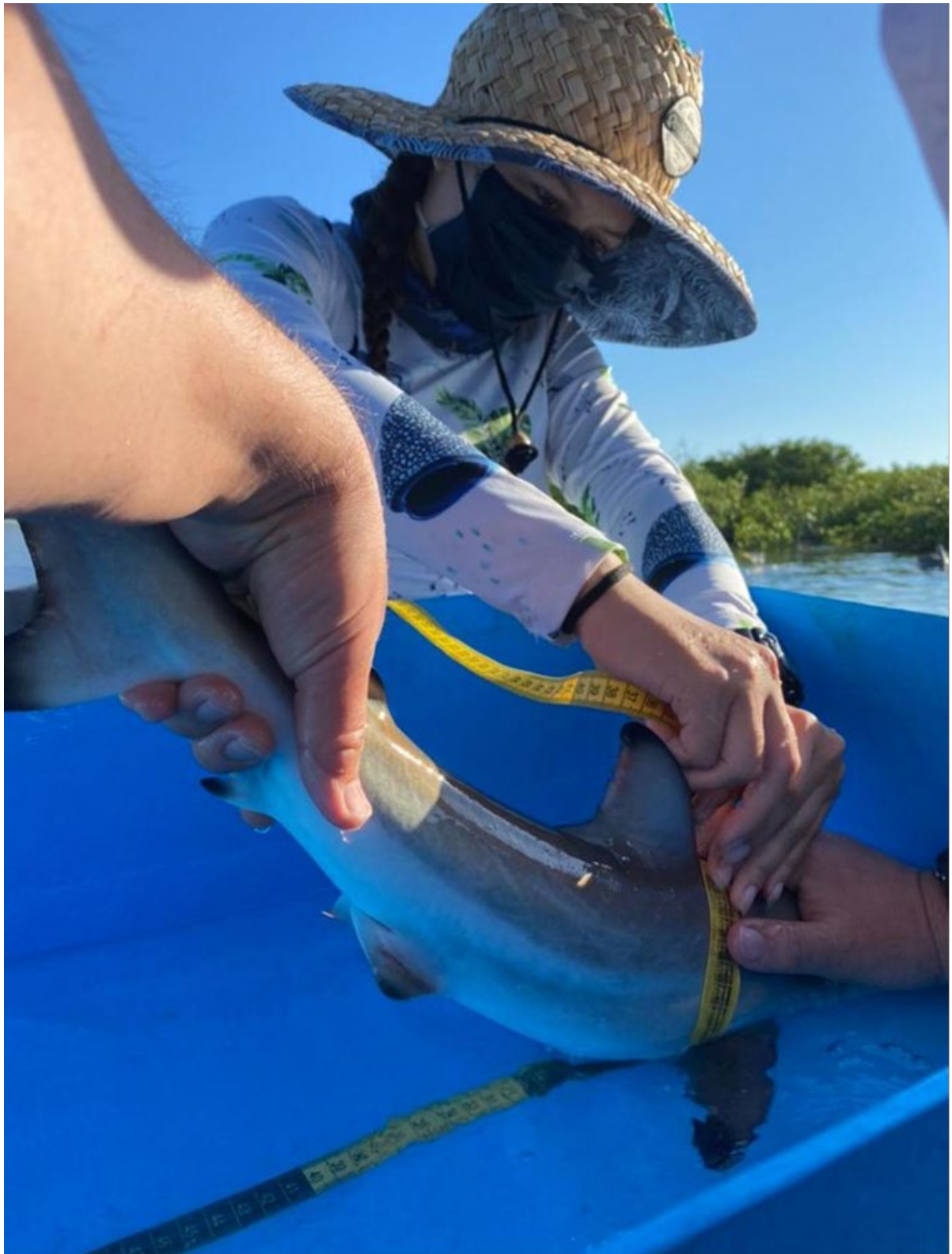
TOP - Figure 3: A neonate blacktip released from the gillnet and ready to be processed aboard. ABOVE - Figure 4: The Shark Team working under COVID-19 bio-protocols at Puerto Grande.