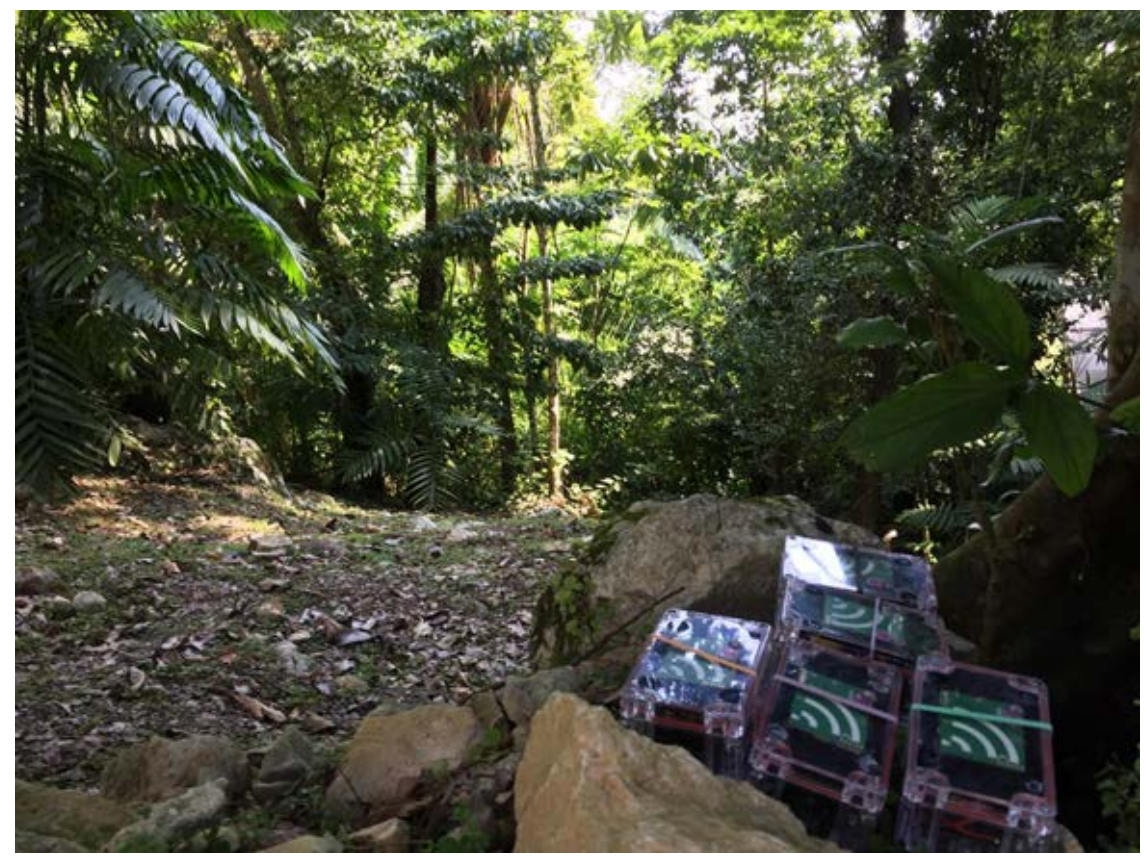
Figure 3. AudioMoth acoustic loggers coupled with GPS modules, here testing satellite signal capture.

3. We conducted field tests inside the forest on the availability of GPS signals, and the functionality of the GPS module currently in development as an attachment to AudioMoths (Fig. 3). This module is designed to synchronise all AudioMoth clocks, in order to allow localisation of a gunshot by the method of hyperbolic navigation – based on time-lags between devices in detection of the gunshot audio-signal. We encountered humidity-related issues whilst testing these devices, which caused several malfunctions. This is a rectifiable problem, which we are confident of being able to address with improvements to the sensor housing.