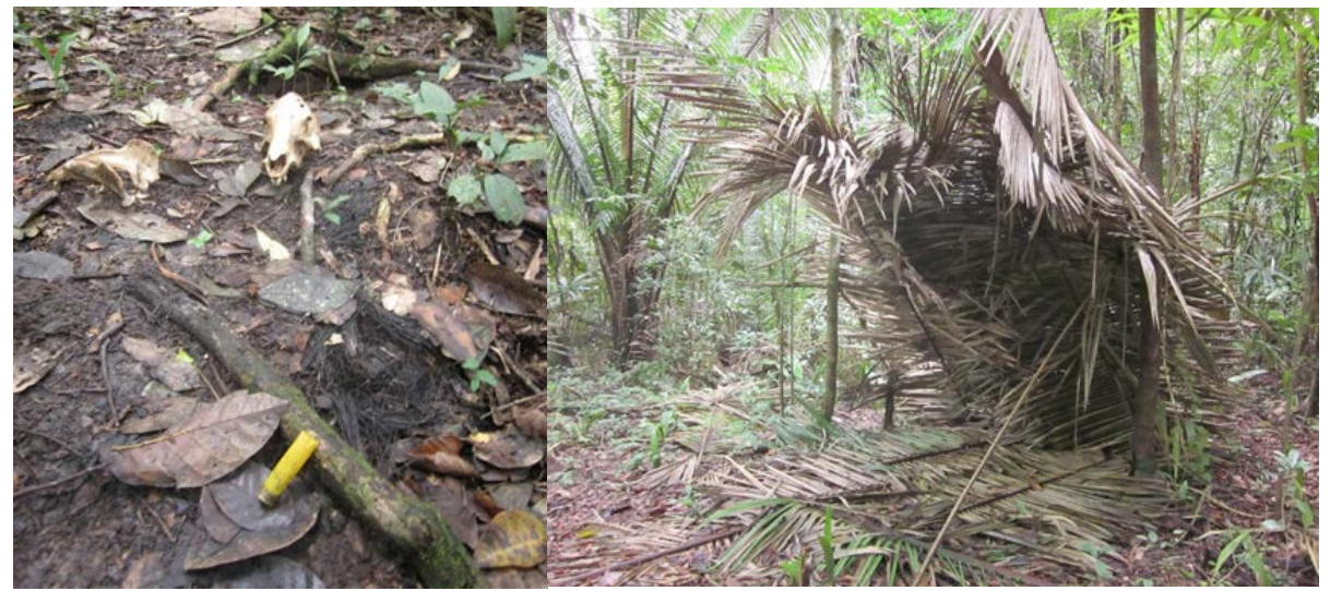
Figure 2. Evidence of an illegal hunting encampment in Tapir Mountain Nature Reserve. The skull belongs to a white lipped peccary.

3. We conducted field tests inside the forest on the availability of GPS signals, and the functionality of the GPS module currently in development as an attachment to AudioMoths (Fig. 3). This module is designed to synchronise all AudioMoth clocks, in order to allow localisation of a gunshot by the method of hyperbolic navigation – based on time-lags between devices in detection of the gunshot audio-signal. We encountered humidity-related issues whilst testing these devices, which caused several malfunctions. This is a rectifiable problem, which we are confident of being able to address with improvements to the sensor housing.