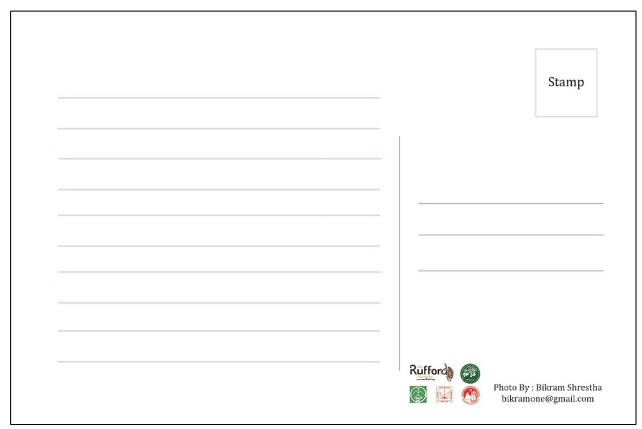
Figure 3. Postcard backside view