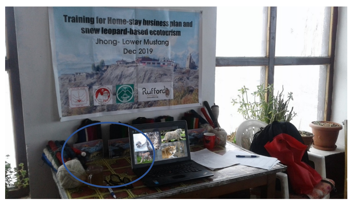
Figure 1. Postcard are kept on the table for the distribution.

500 postcards were produced as souvenirs (pictures below). Some of them were distributed to the homestay and ecotourism subcommittee and local peoples of Jhong during the training for homestay and snow leopard-based ecotourism business plan was organised on 13<sup>th</sup> December 2019. This information was missed in the previous progress report submitted in February 2020. We will also distribute it to students in Mustang and Pokhara once Covid-19 over.