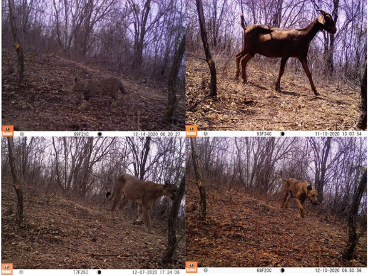
Figure 7: A pampas cat, cougar, goat and dog in the same camera trap in the Cerros de Amotape National Park.

c) We identify six exotic mammal species, and nine native medium-to-large sized mammals in the Cerros de Amotape National Park (Table 1). By far, the most common species was the goat (Capra hircus), being almost three times more relatively abundant that the most common native species, the Sechuran fox (Lycalopex sechurae). Also, the goats were present at all our camera trap stations (N = 16). We recorded exotic and native mammals in the same camera traps, such as dogs, goats, pampas cats, cougar, and foxes (Figure 7). Preliminary, we found evidence of moderate to high temporal overlap between dogs and tayras, dogs and pampas cat, dogs and white-tailed deer and goats and white-tailed deer (Figure 8).