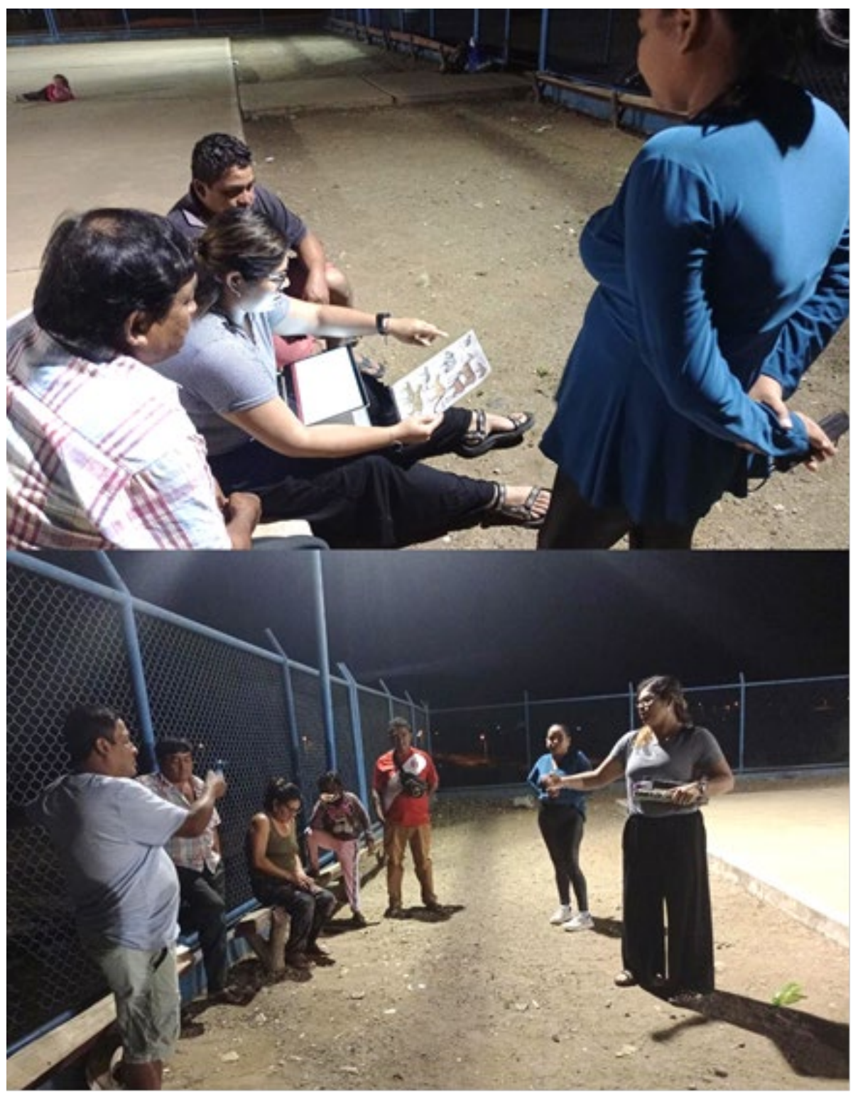
Figure 4: Meeting with local people

b) Of the total of interviewers (113 villagers) from three towns of the buffer area of the Cerros de Amotape National Park, 44% of them say that they have some conflict with wildlife. Nevertheless, just the 56% of them have concrete evidence, such as visual records. They mentioned that cougars ( Puma concolor ) prey on goats, but just the 11% have really seen a predation event.