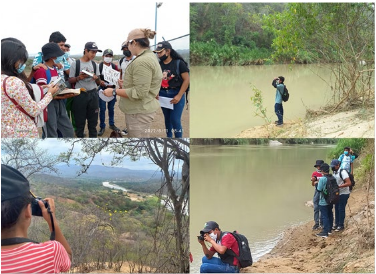
Figure 1: Schoolchildren during the field visit to the Cerros de Amotape National Park. They were taking photos of wildlife and birding.

Something very important for us was to see how the winner of the photography contest had an innate ability to capture nature through her lens, and now she thinks that it could be an option for her to study photography professionally, just like other students who saw the potential to study tourism or biology as a career for their future.