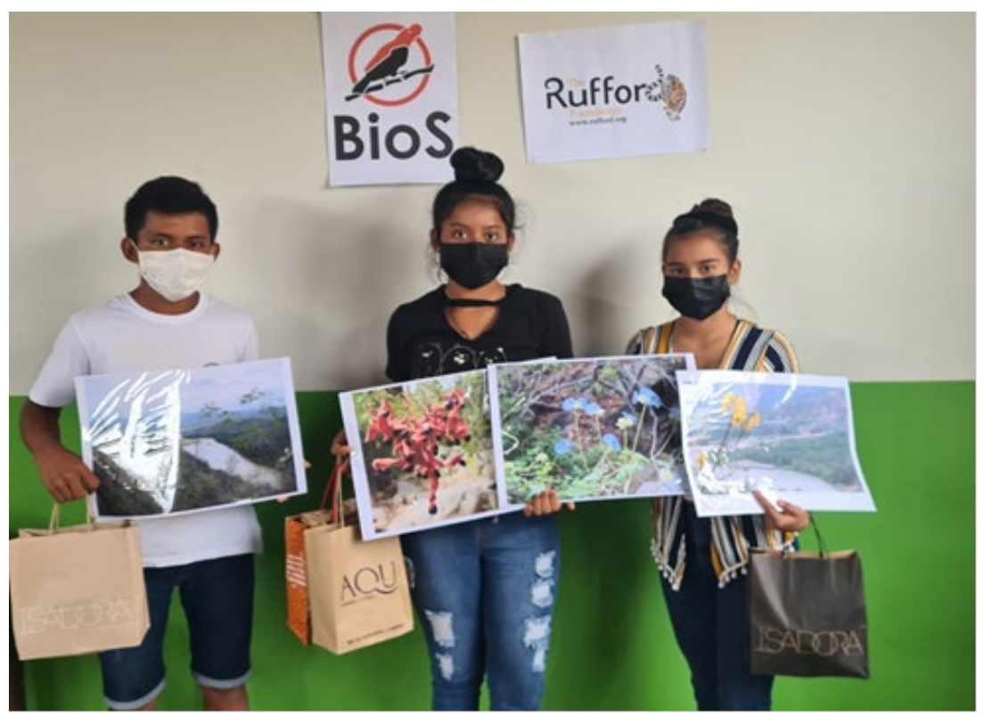
Figure 3: The winners of our photo contest among the schoolchildren.