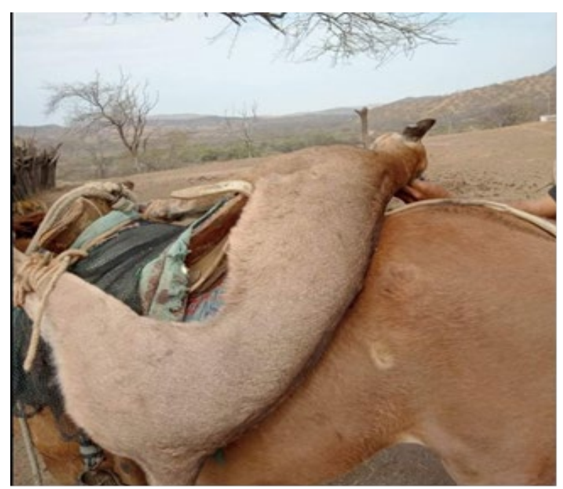
Figure 6: A cougar killed by local people in retaliation for preying their goats.

Figure 5: Interviewing local people to understand their attitudes and perception towards wildlife.