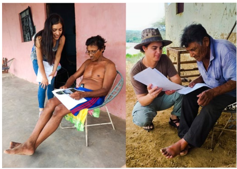
Figure 5: Interviewing local people to understand their attitudes and perception towards wildlife.

Also, most of the interviewers (76%) are confident that Sechuran fox ( Lycalopex sechurae ) and common opossum ( Didelphis marsupialis ) prey on poultry and eggs, while the 16 % of the interviewers said that a hawk (non-identified species) prey on chicks. Most of them (70%) do nothing to prevent any conflict with these animals, but the 17% use dogs as guardians, 8% put their poultry inside chicken coops that do not always prevent predation, and 5% said that they killed or tried to kill the wild animal. It is worth mentioning that after our interviews, we were notified by a park ranger that local people killed a cougar in retaliation because it was preving on goats (Figure 6).