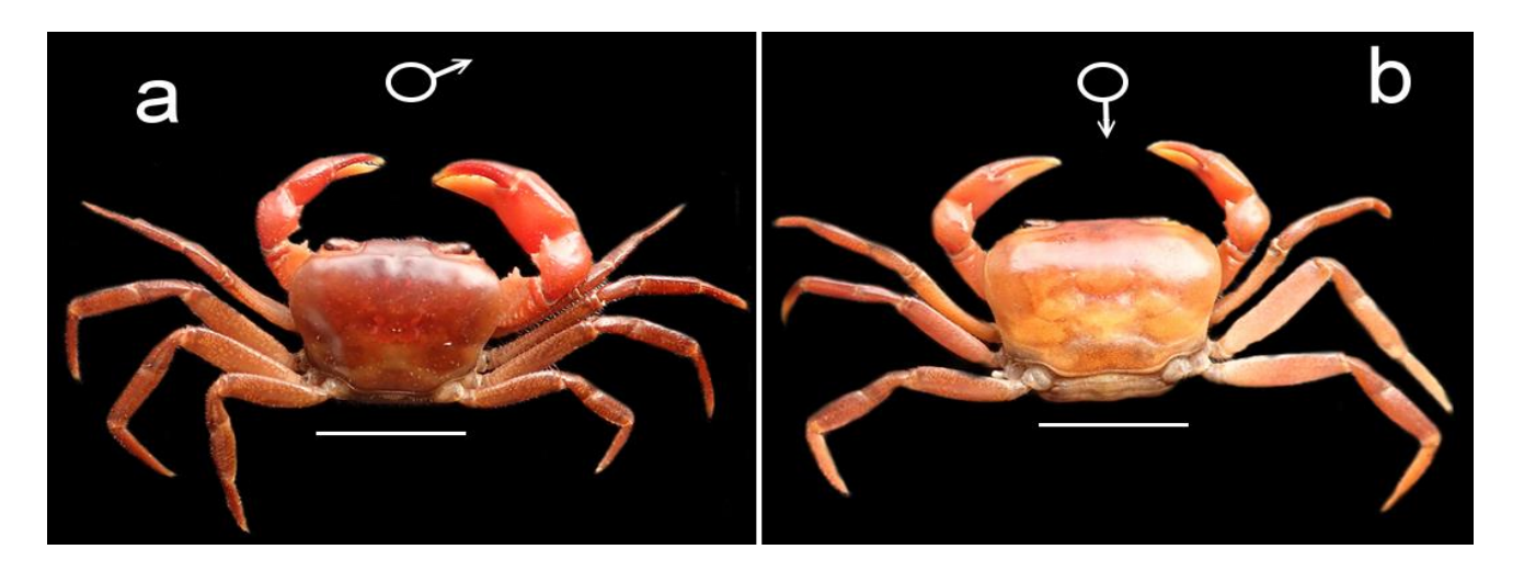
Figure 3. The largest male and female specimens of Louisea yabassi newly rediscovered after more than 115 years.

Good sizes of populations of Louisea nkongsamba were reported from northern, southern and eastern slopes of Mt. Nlonako ecological reserve. The mtDNA analyses to study two main aspects of conservation concern: population genetics (phylogeographic investigations) and identification of species boundaries using the phylogenetic species concept (phylogenetic investigations) will be carried out at the Museum Fur Naturkunde, Berlin Germany. This work is still waiting to the global pandemic of corona virus.