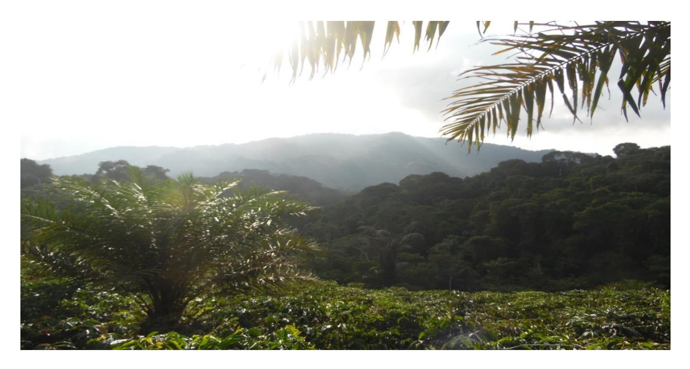
Fig. 3. Farm at Nlonako ecological reserve

The numerous threats to each slope were reported. These threats are mainly from human activities that include deforestation, habitat degradations, and installation of farming (Fig. 3). Consequently, agrochemicals are released into the environment that affecting eggs, hatchling crabs, and adults of this species