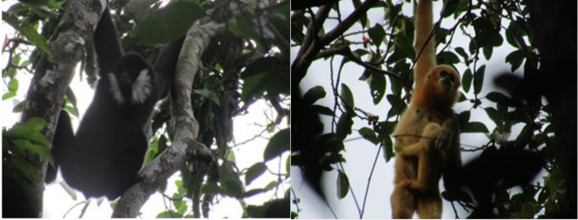
Gibbons in Pu Hoat