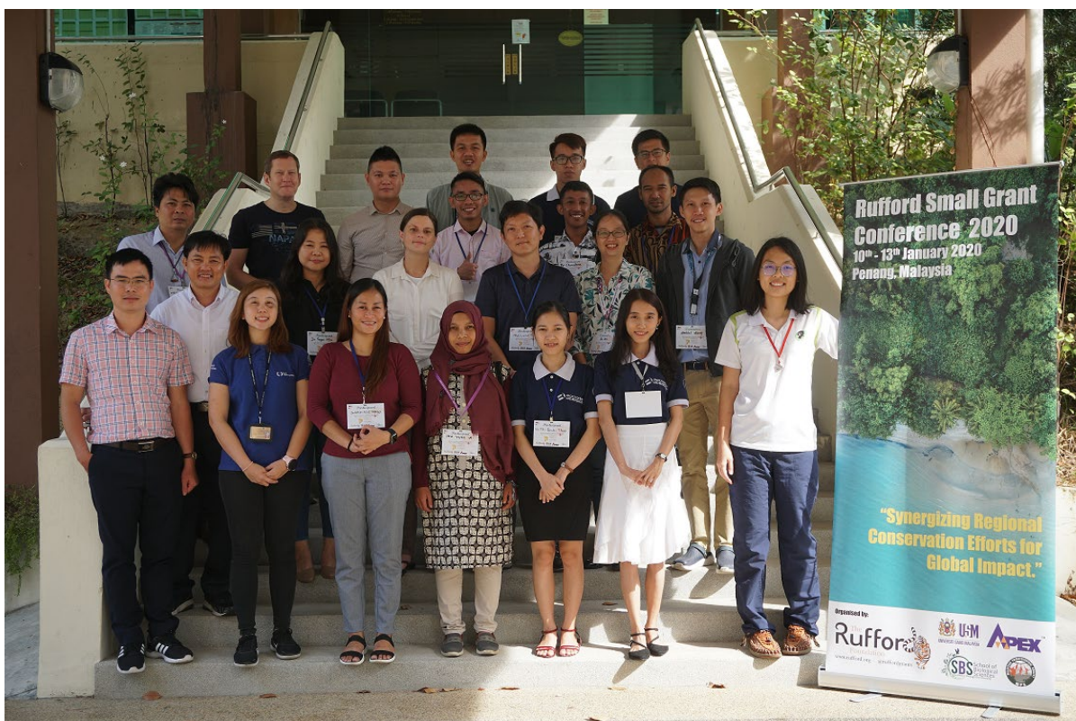
Workshop in Penang, Malaysia

I would like to share some photos of the project: