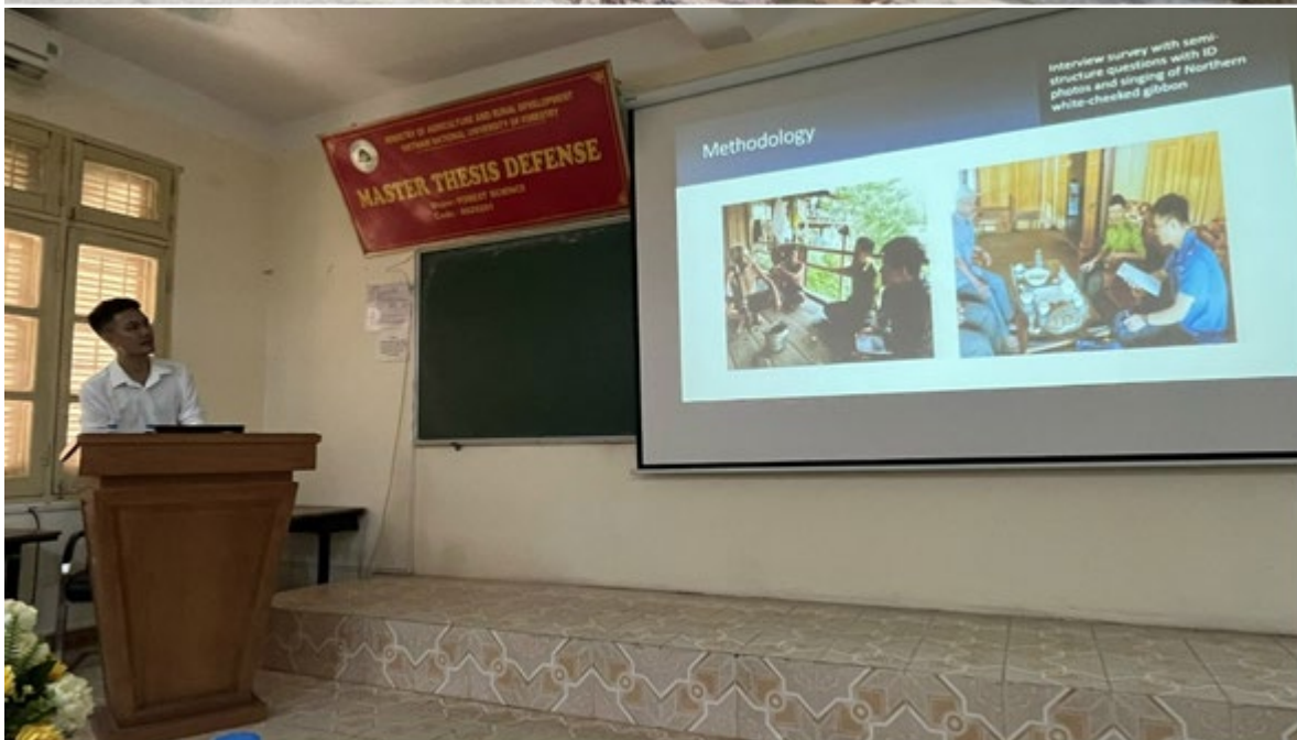
The results of the project were used to defend the master.