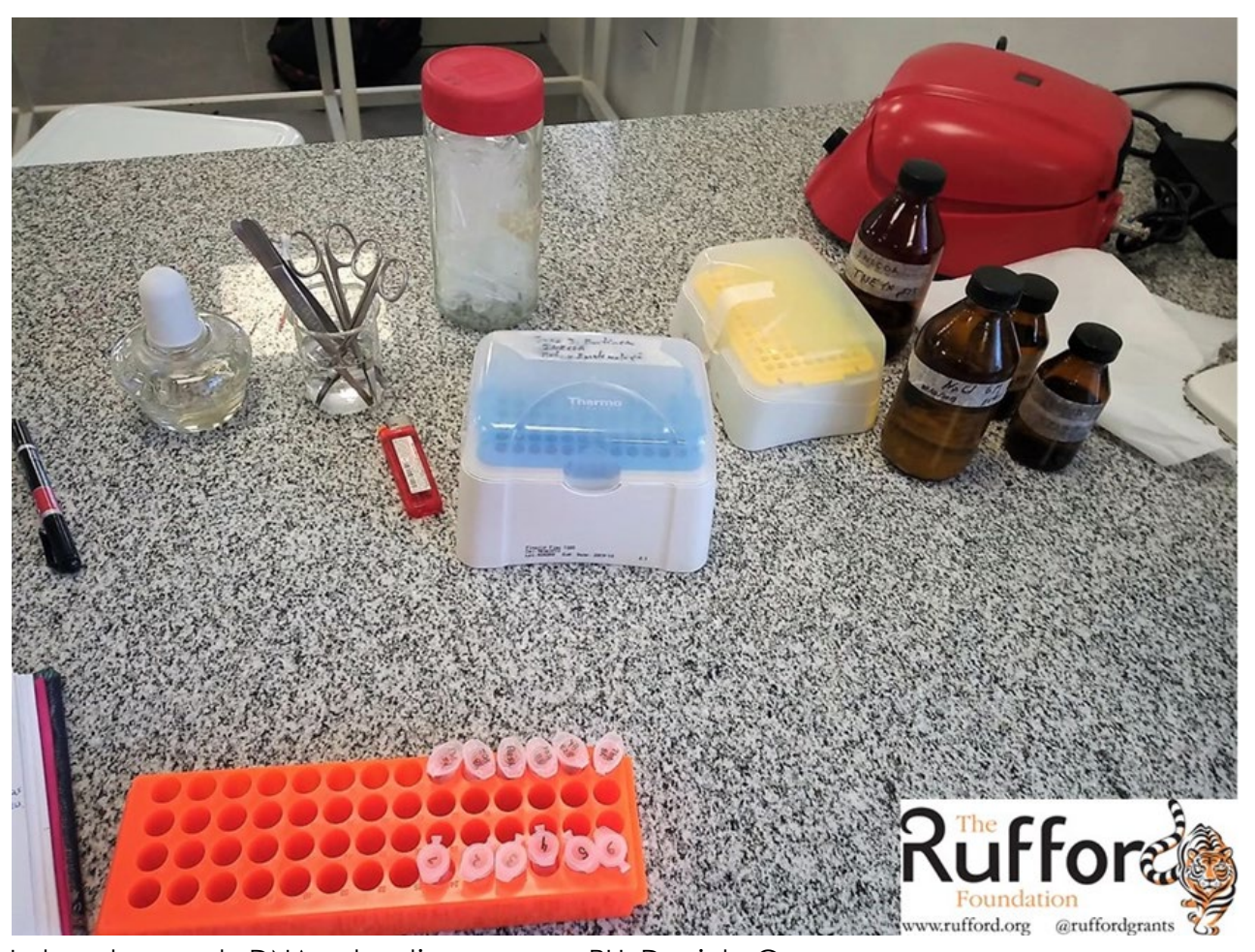
Laboratory work. DNA extraction process.