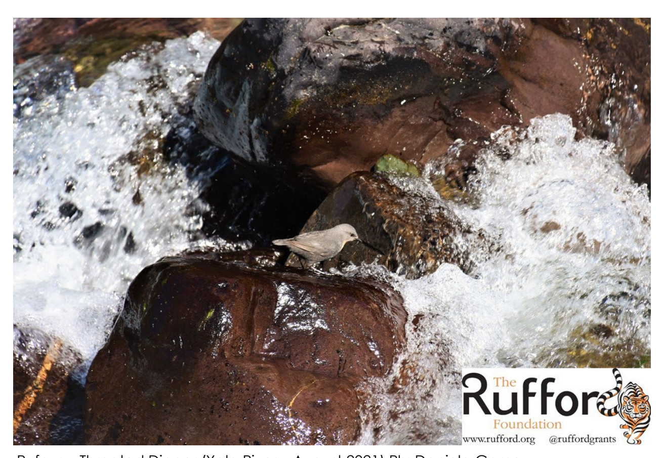
Rufous – Throated Dipper (Yala River – August 2021)

To date, we have the extraction of nine DNA samples, which must be amplified and subsequently sent for sequencing. Macroinvertebrate samples are being separated in the laboratory. These samples will later be identified at the family level, and then the biomass for each site will be calculated as a measure of food available for the rufous–throated dipper.