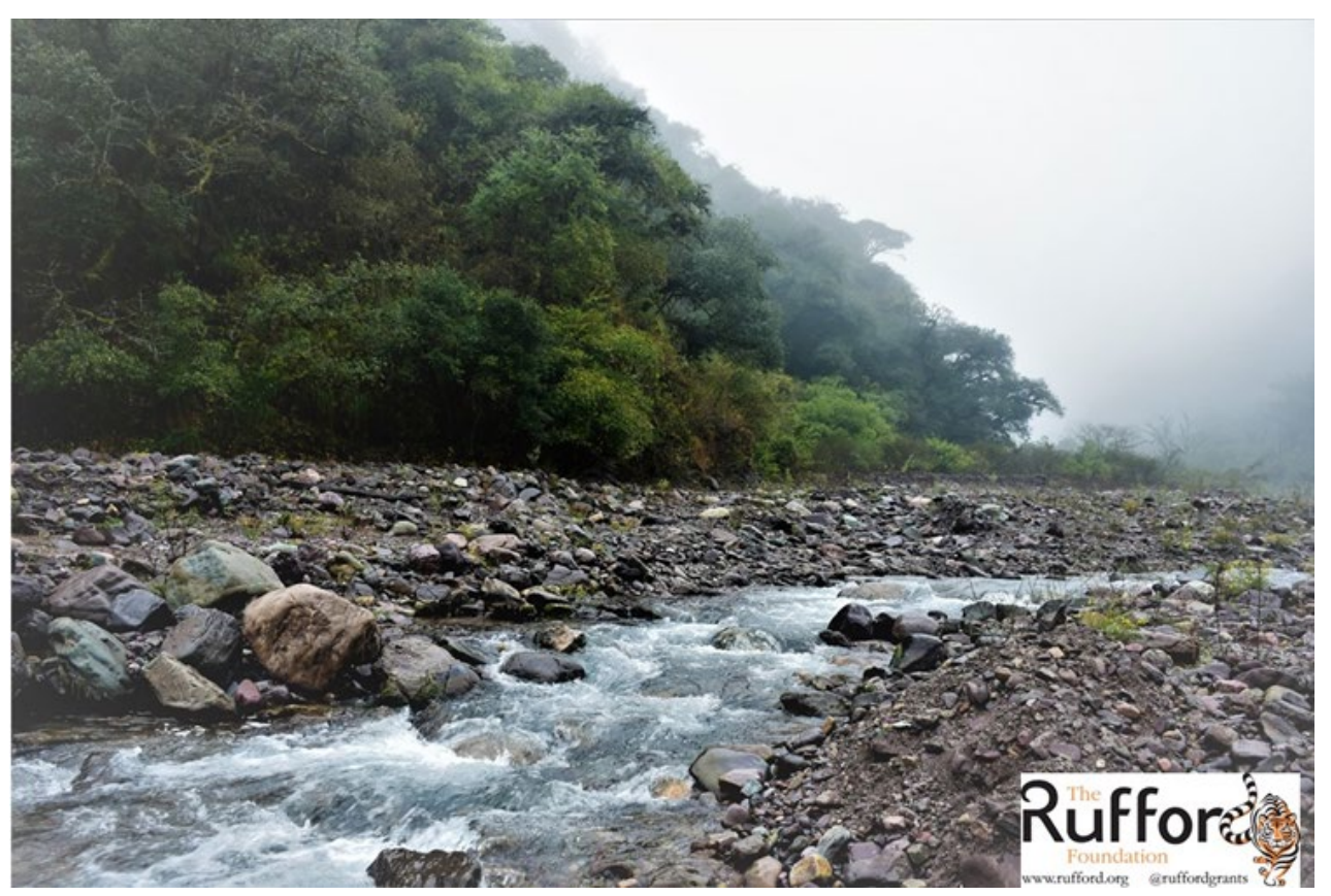
Los Morados River (July 2021).