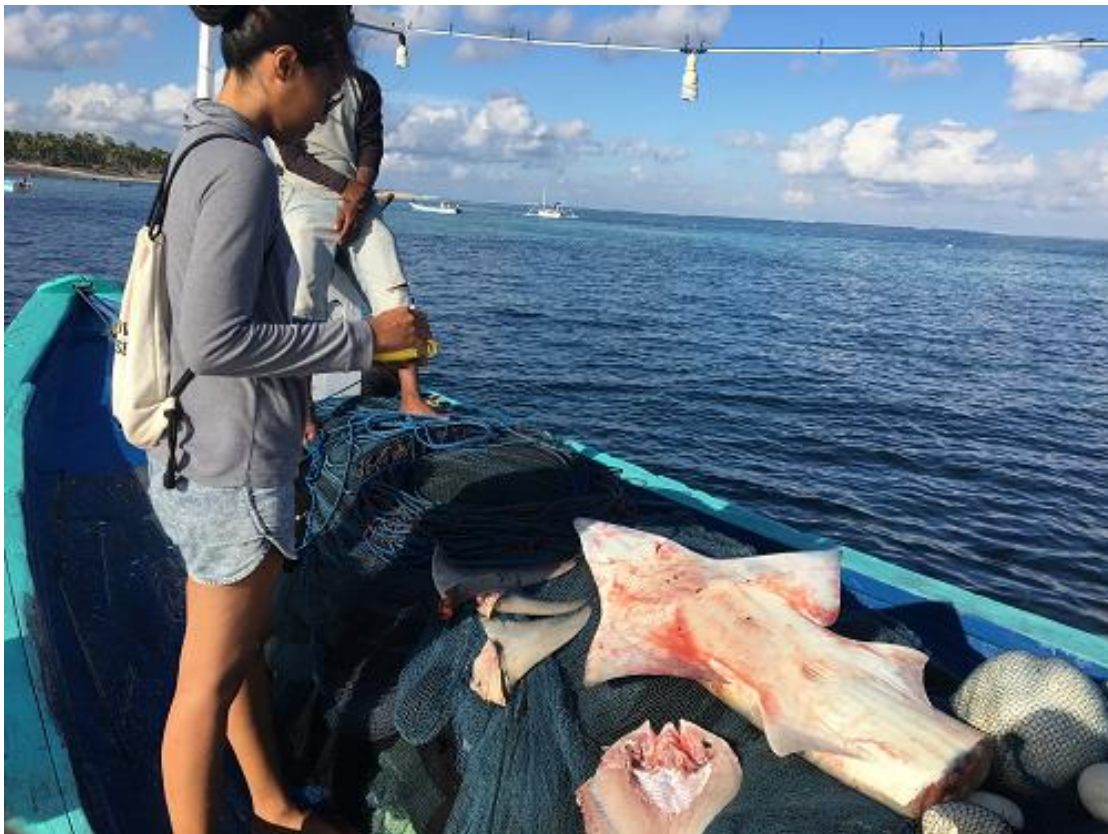
Whitespotted wedge fish caught on hand line by one of the local fishing boat. Fins