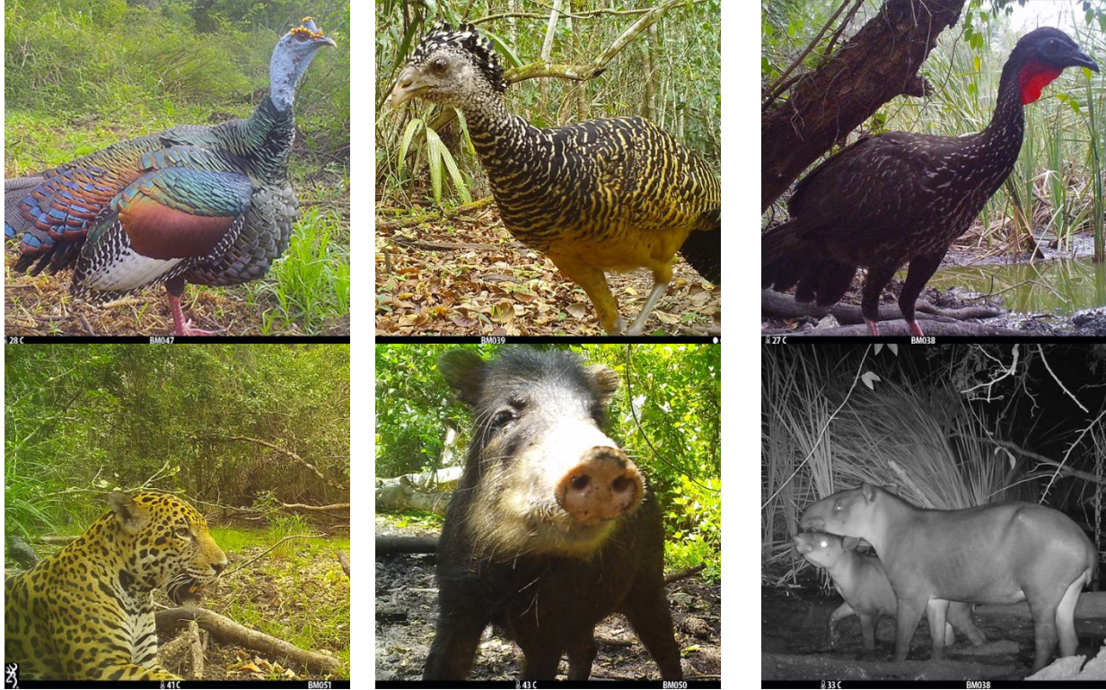
Fig 4. Some of the species registered during the surveys. From the top left to the right: Ocelated turkey ( Melagris ocellata ), Great curassaw ( Crax rubra ), Crested guan ( Penelope purpurascens ), Jaguar ( Panthera onca ), White-lipped peccary ( Tayassu pecari ), Bairds' tapir ( Tapirus bairdii ).