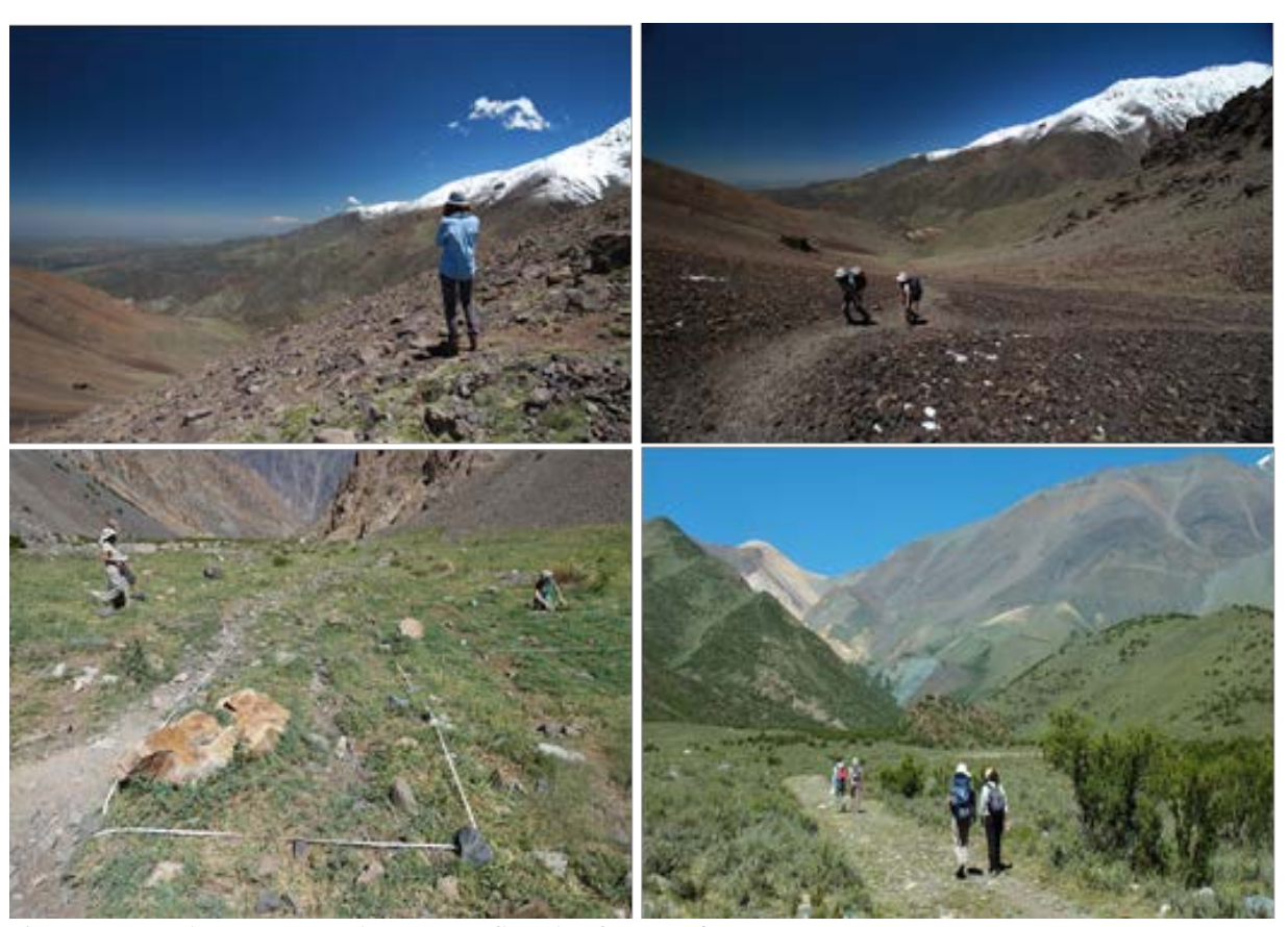
Fig. 1. Intensive vegetation sampling in the study area.