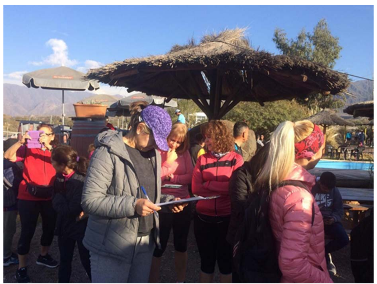
Fig. 3. Visitors of mountain natural areas completing the questionnaires.

variation of each of the exotic species, we found that although they are present in a wide altitudinal range, they do not show plasticity in their traits.