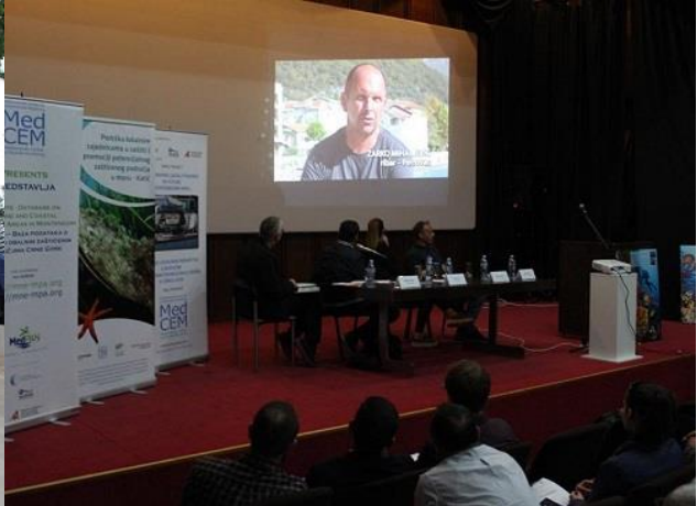
Workshop in Petrovac