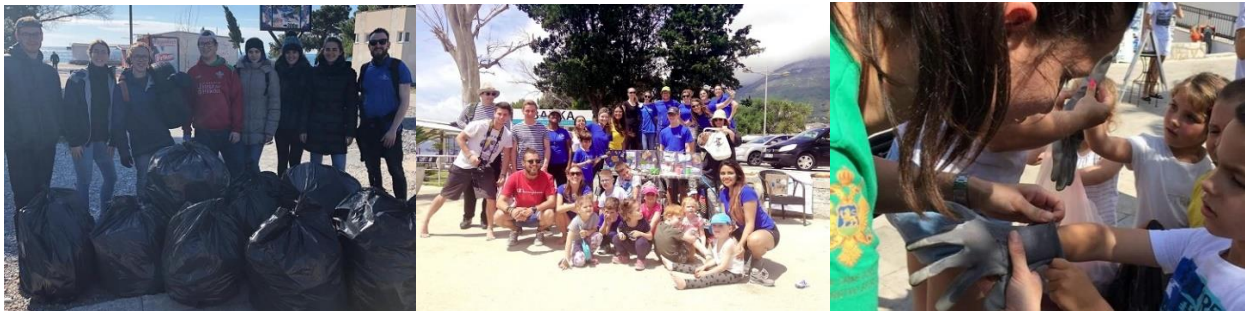
Beach clean-up events

Three articles, on photo-identification, the effect of fishing vessels and seismic practices, are ready for a publication and will be submitted within a month.