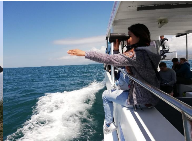
Land and boat surveys