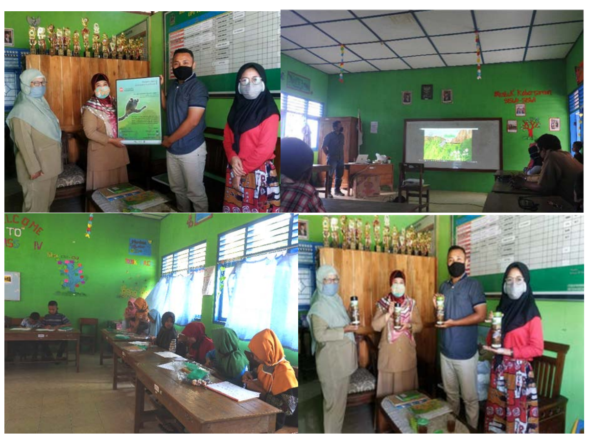
Figure 2. Awareness raising activity in Pejaten Elementary school were including watching educative video animation, discussion and coloring sketch. We also have delivered tumbler for the teacher and the student.

The activities were introduction of the java sparrow through discussion and watching video animation. We ask some question to student, what kind of bird you ever seen near your house, have you ever seen Java sparrow, can you describe how the bird is. After that we continued with watching animation video we have produced, which explained student about how java sparrow live in the wild, what is the current situation regarding the population threat and conservation, after watching video we continued discussion about how can we help java sparrow population in the wild.