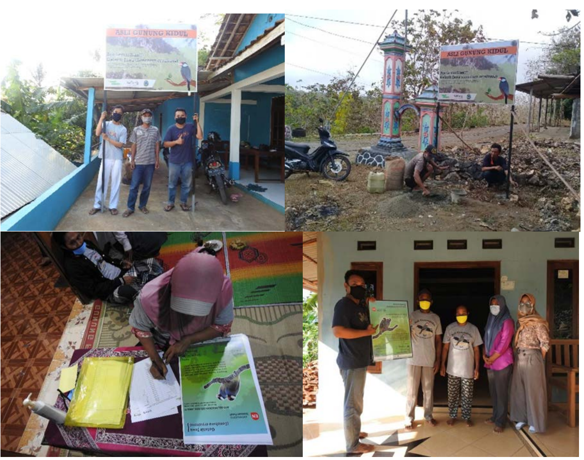
Figure 1. Up: The billboard arrived in sub-village chief's house at Pejaten. Below: Infographics we distributed to community during closing program in October 2020, infographic have been delivered to Java sparrow monitoring participant in Girikarto.

During last quarter, we have producing some material awareness comprising Billboard, info graphic, animation Video. Info-graphic and Billboard design have been finished in April 2020 however it had just installed in the project site in 7 August 2020. Our info-graphic have been distributed to all monitoring participant, chief of villages to community during evaluation closing program in 20 October 2020.