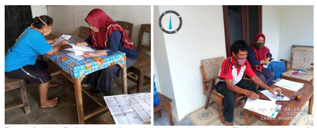
Figure 5. Mrs. Tusilah assisted monitoring participant to fill the questioner for monitoring scheme evaluation.

The result shows only 41% have recorded their encounter to java sparrow in the monitoring sheet, comprising 27% (1 time) and 14% of them (2-3 times), while 59% of them never fill the monitoring sheet.