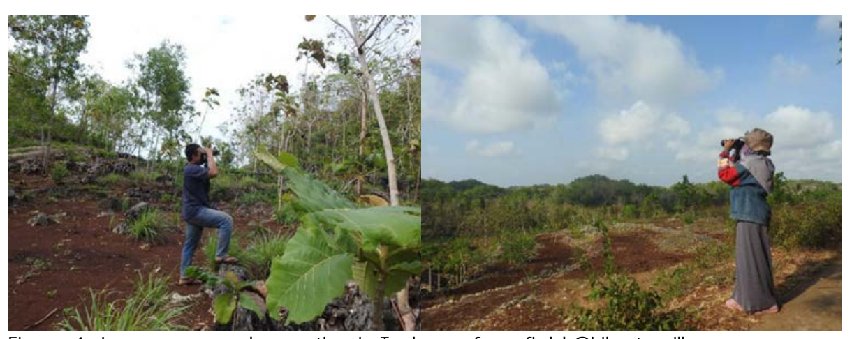
Figure 4. Java sparrow observation in Tedunan farm field Girikarto village

On 21 October We visited Tedunan farm field, Song Gobar cliff, Macanan cave and Jothak cave but we didn't see java sparrow.