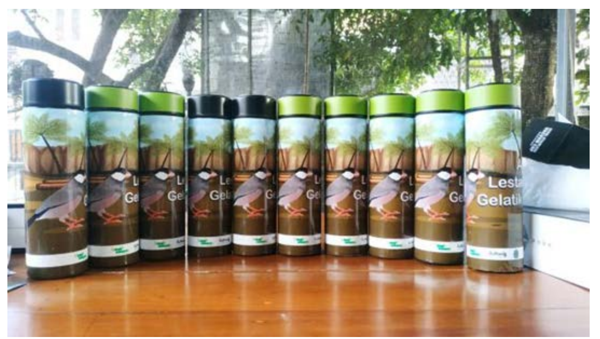
Figure 10. T Shirt Design we have distributed to java sparrow monitoring participant and the tumbler we have distributed to student and teacher in SDN Pejaten elementary school.