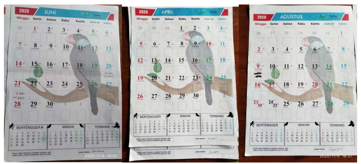
Figure 8. Java sparrows encounter record in monitoring sheet from the participant. They did with different style.