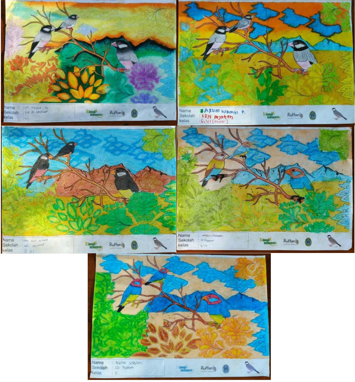
Figure 3. sample of java sparrow Color pencil sketching from student Class 4-5 and 6.