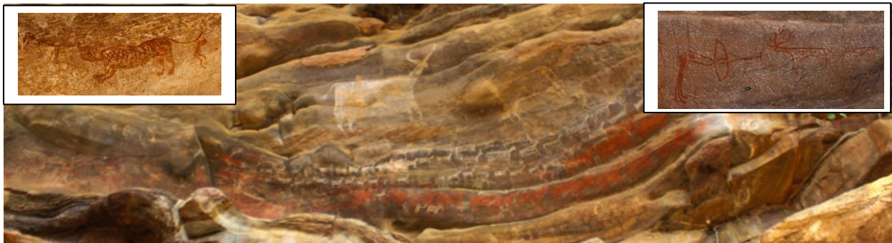
Picture 6: Various pre-historic rock paintings of varying timeline depicting society, wildlife and nature.