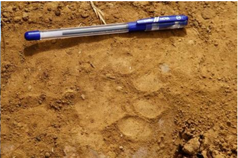
Left: Volunteer and forest staff showing tiger territory marking. Right: Tiger pugmark.