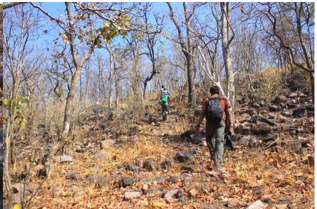
Left: Team including P.I., Volunteer and forest staff. Right: Tracking carnivores trails