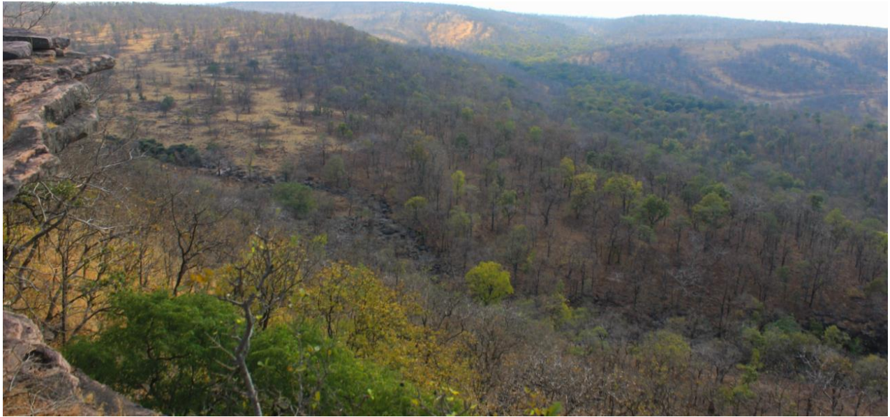
Dry Deciduous and Scrub forest of Bhopal-Ratapani Corridor.