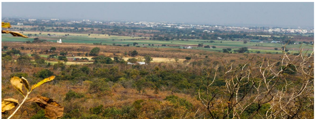
Study Area showing Bhopal city, Agricultural land and corridor forest