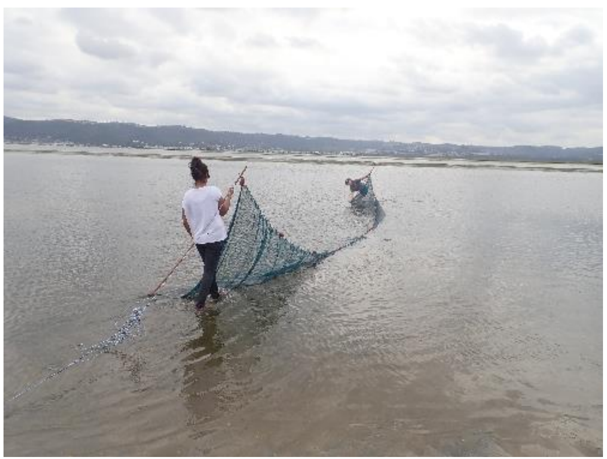
Seine netting for Juvenile Fish in the Knysna Estuary

NB . Please see above for a minor change to my original title which is now Juvenile Fish as opposed to Larval Fish