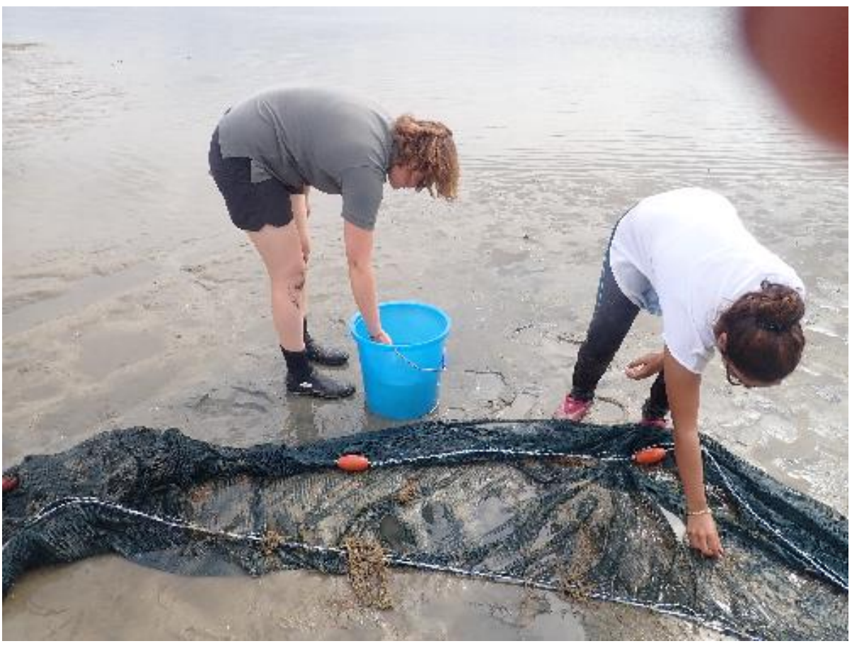
Collection of Juvenile Fish