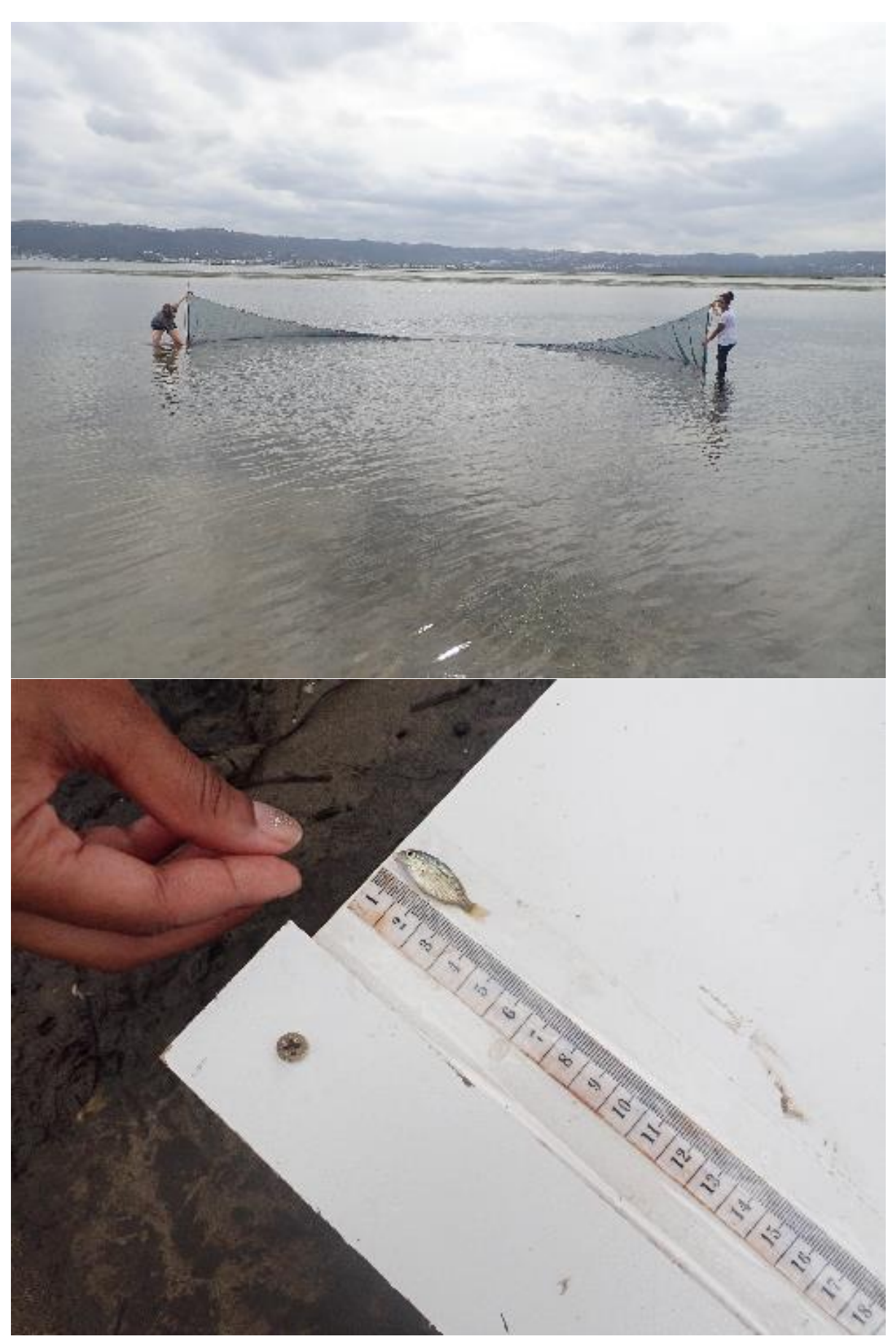
Measuring the total length of specimens collected