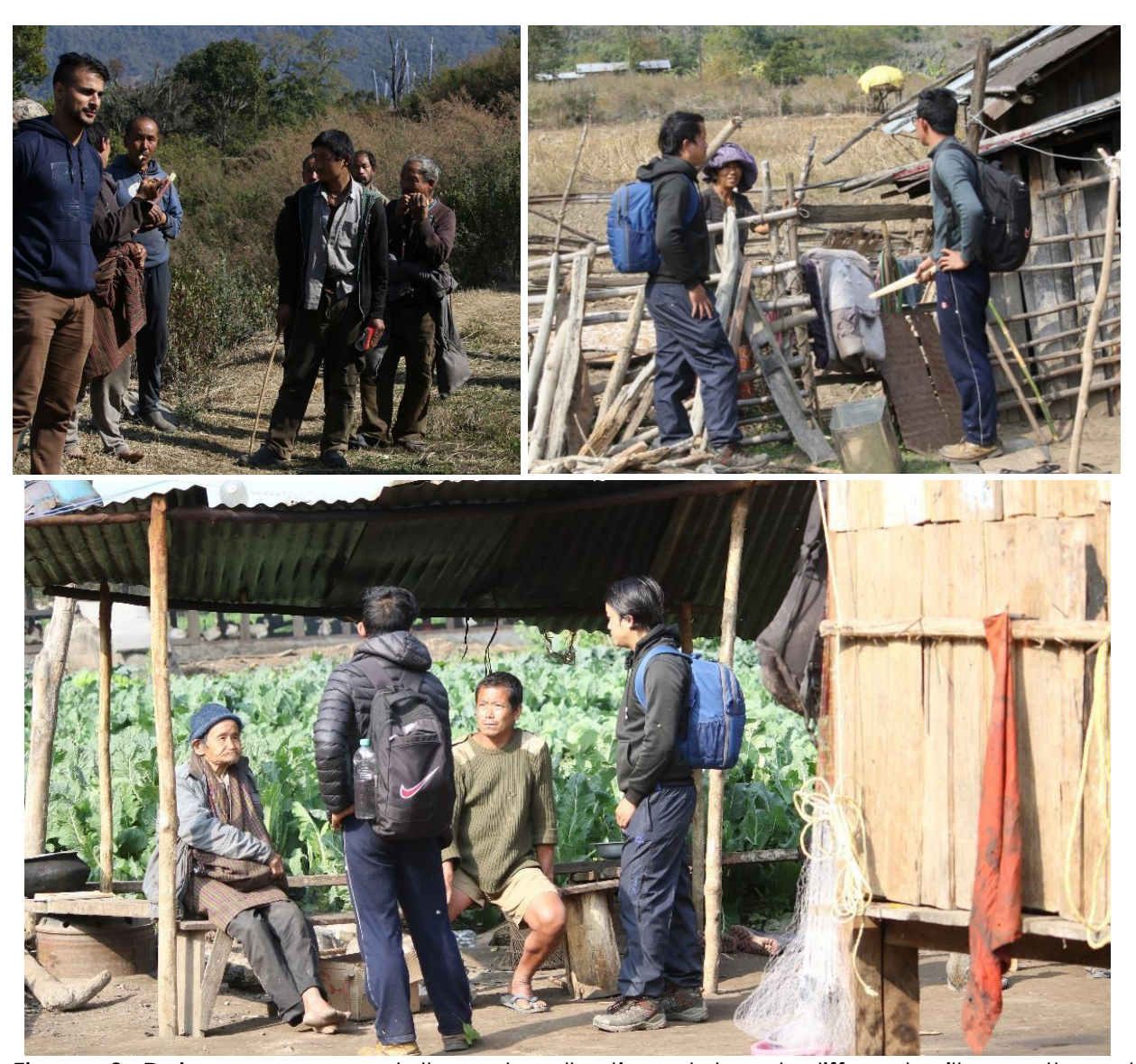
Figure 2 Doing awareness talk and collecting data at different villages through discussions

These might be because most of the works done till now has been focused more on golden langur conservation. We tried to convey our messages to as many people as we could during our field trip. We covered the villages and gewogs viz. Langthel, Thingthibhi, Praling, Panbang, Dunmang, Kanglung and Jomongkha. These are the areas where we were able to observe either golden langur or capped langur.