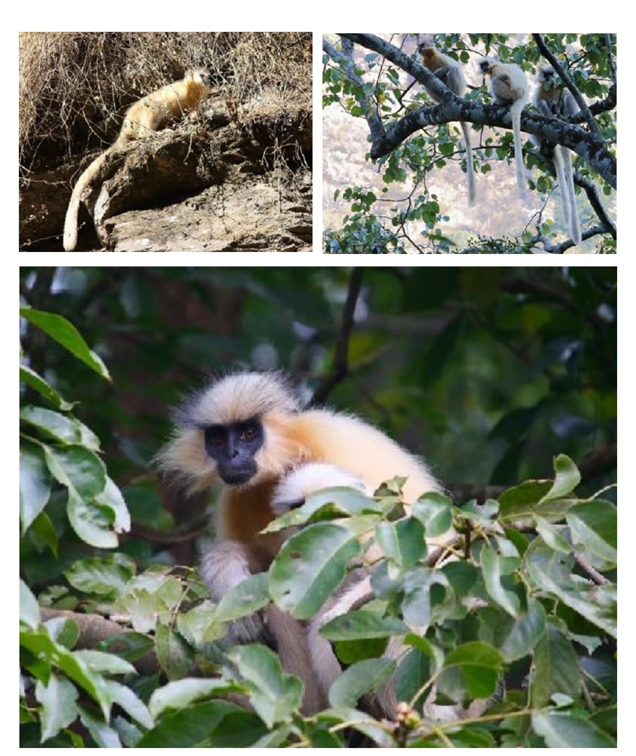
Figure 3. Golden langur at its natural habitat