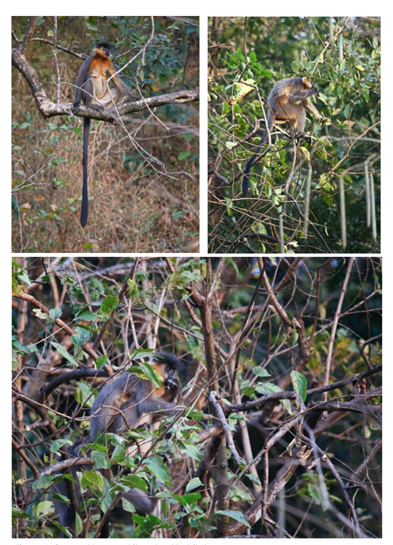
Figure 4. Capped langur at its natural habitat