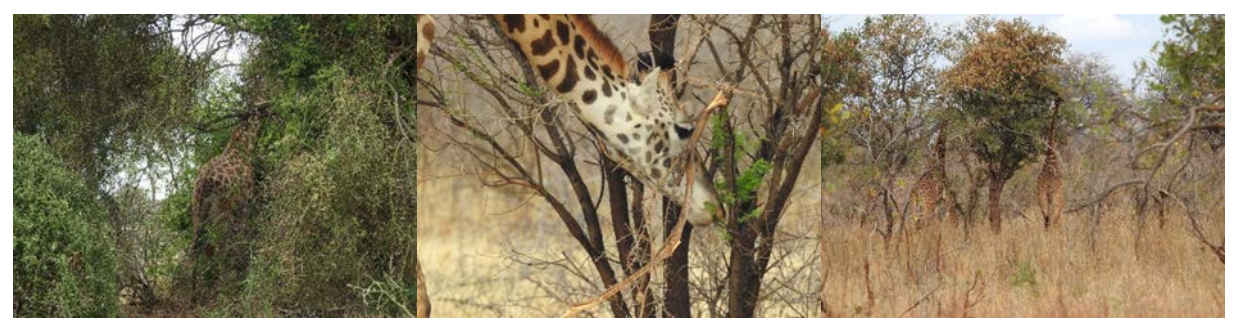
Figures 1, 2 & 3.

like Acacia tortilis, Balanite aegyptiaca, Combretum, and Lanchocapus species become an important source of food for the giraffes.