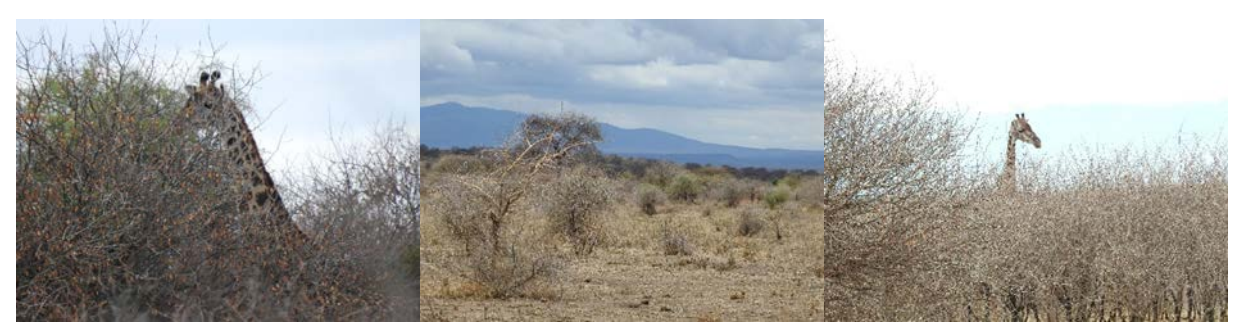
Figures 4, 5 & 6.