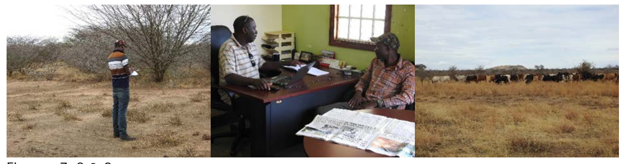
Figures 7, 8 & 9.