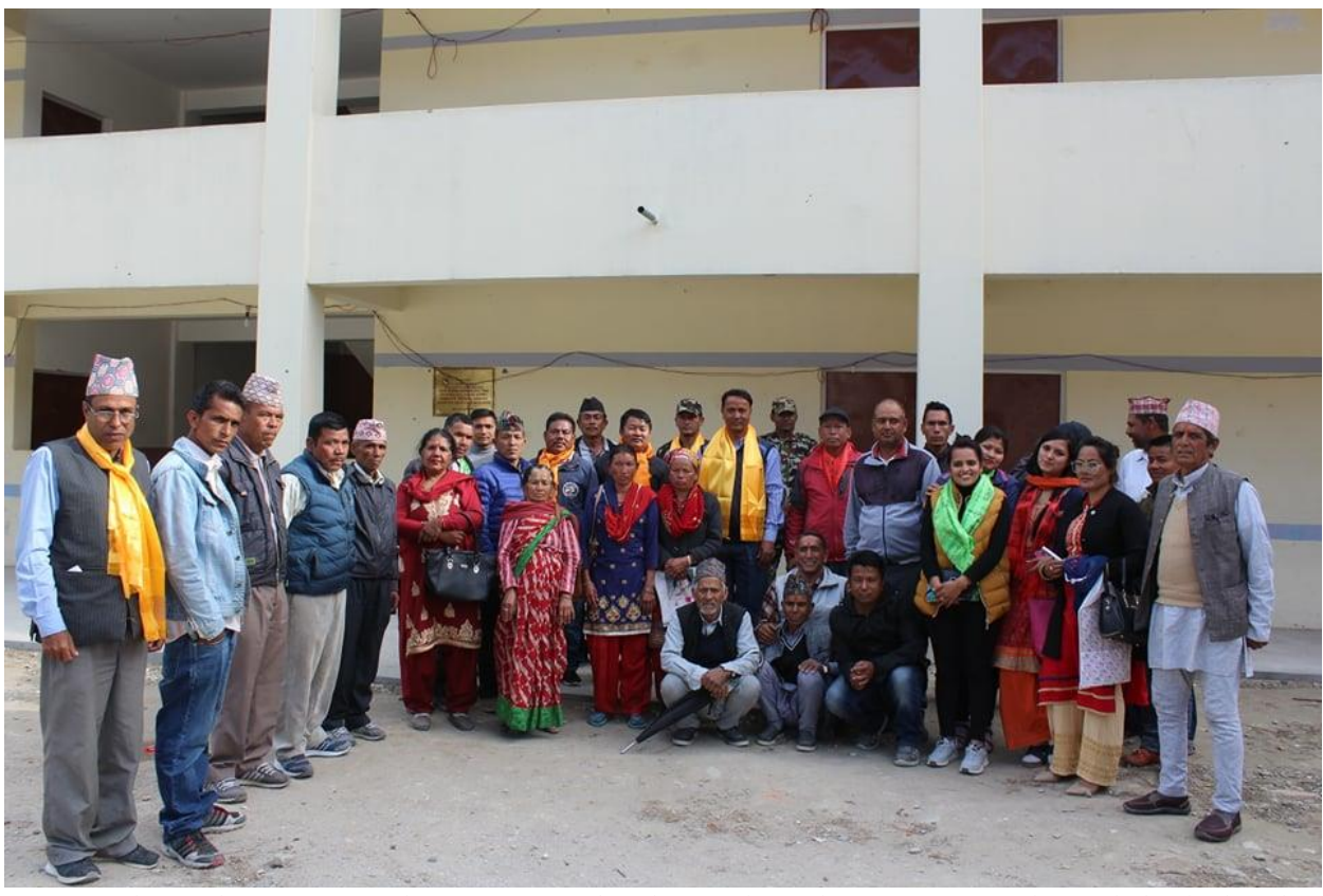
[Interaction with community people of Shivapuri National park while relief distribution program]