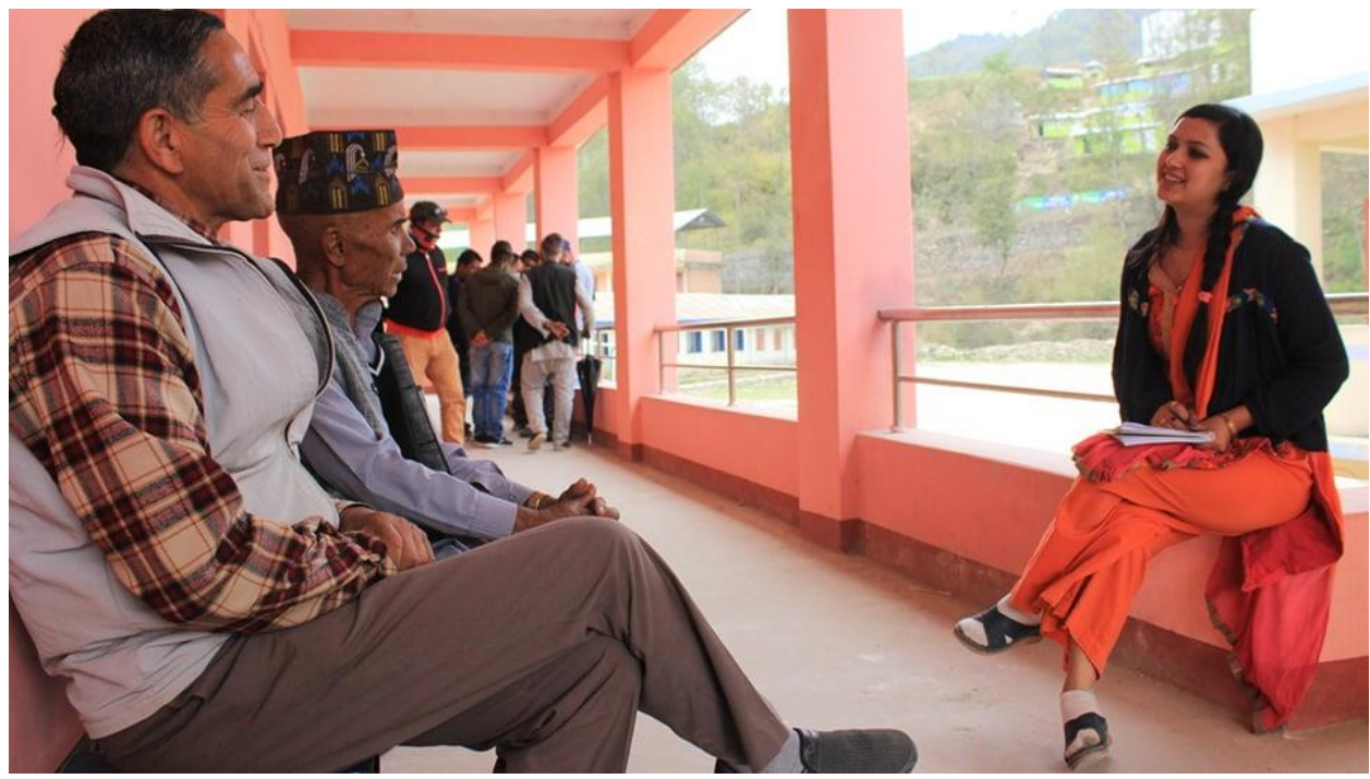
[Interaction with Bigcats victim at Sundarijal]