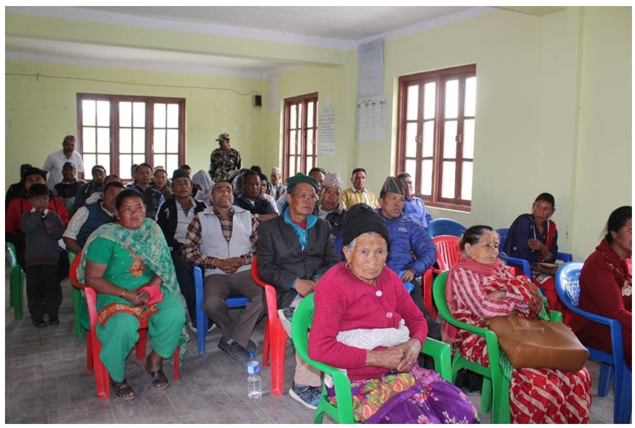
[Wildlife victim of Shivapuri including bigs cats and other wildlife as well]