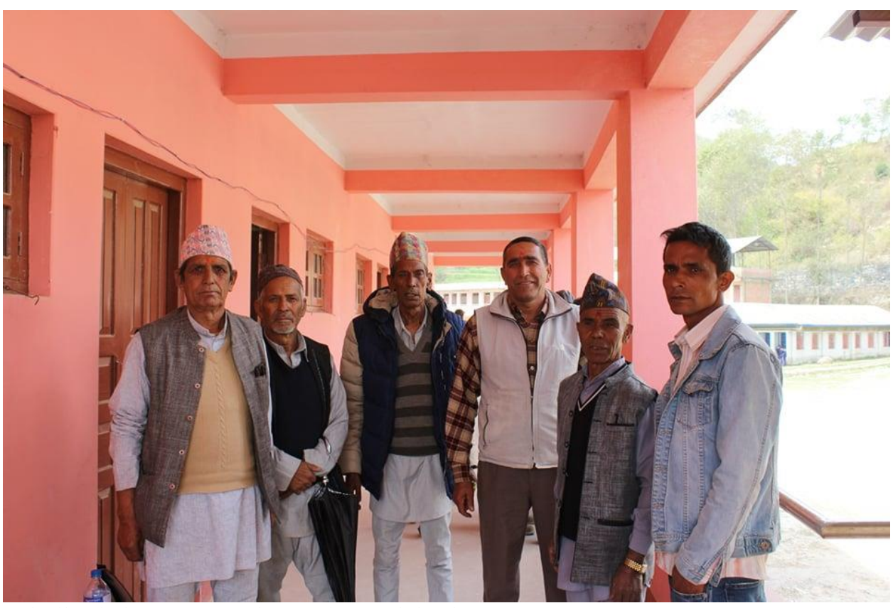
[Wildlife victim gathered for sharing their feelings]