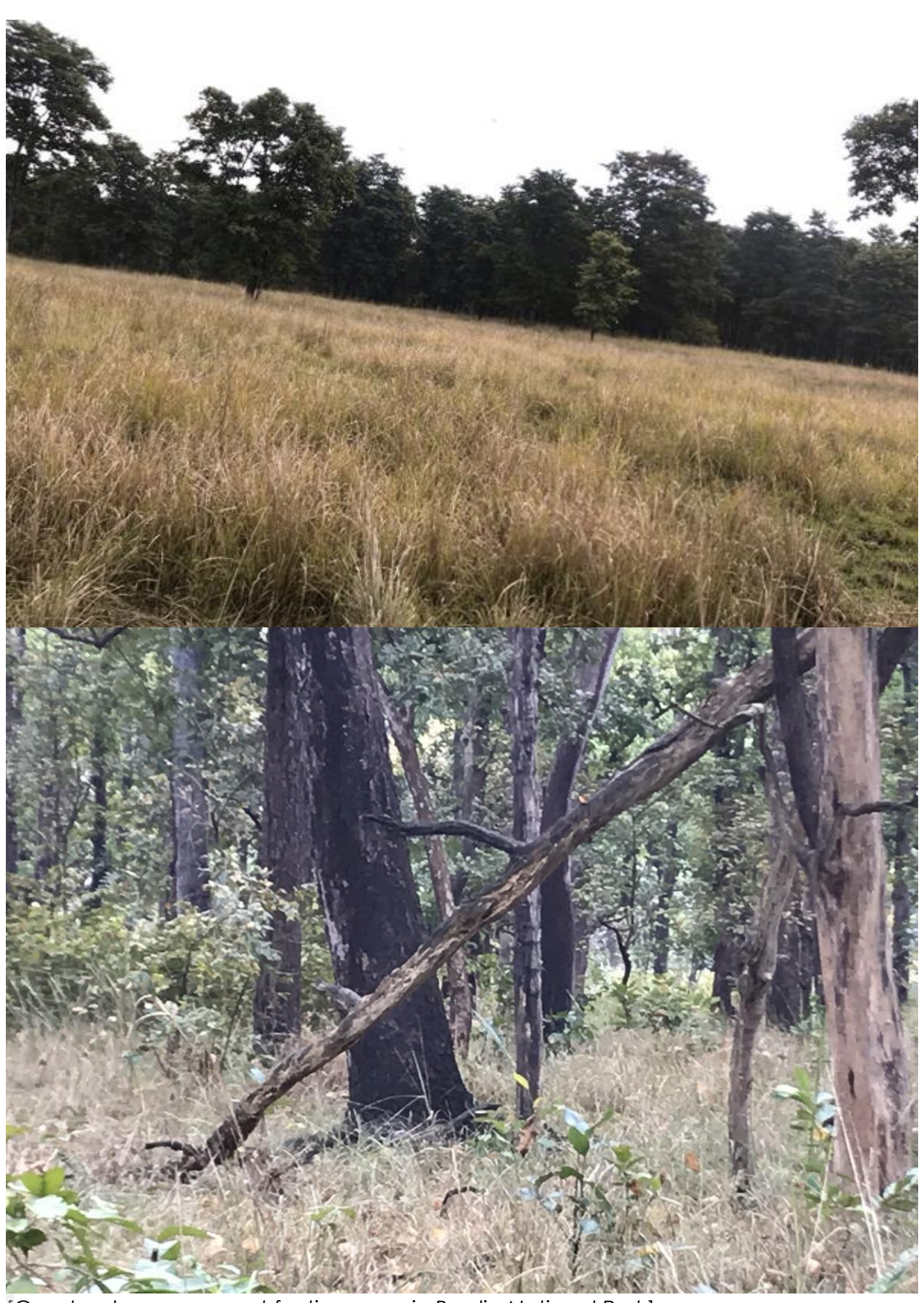
[Grassland management for tiger prey in Bardia National Park]