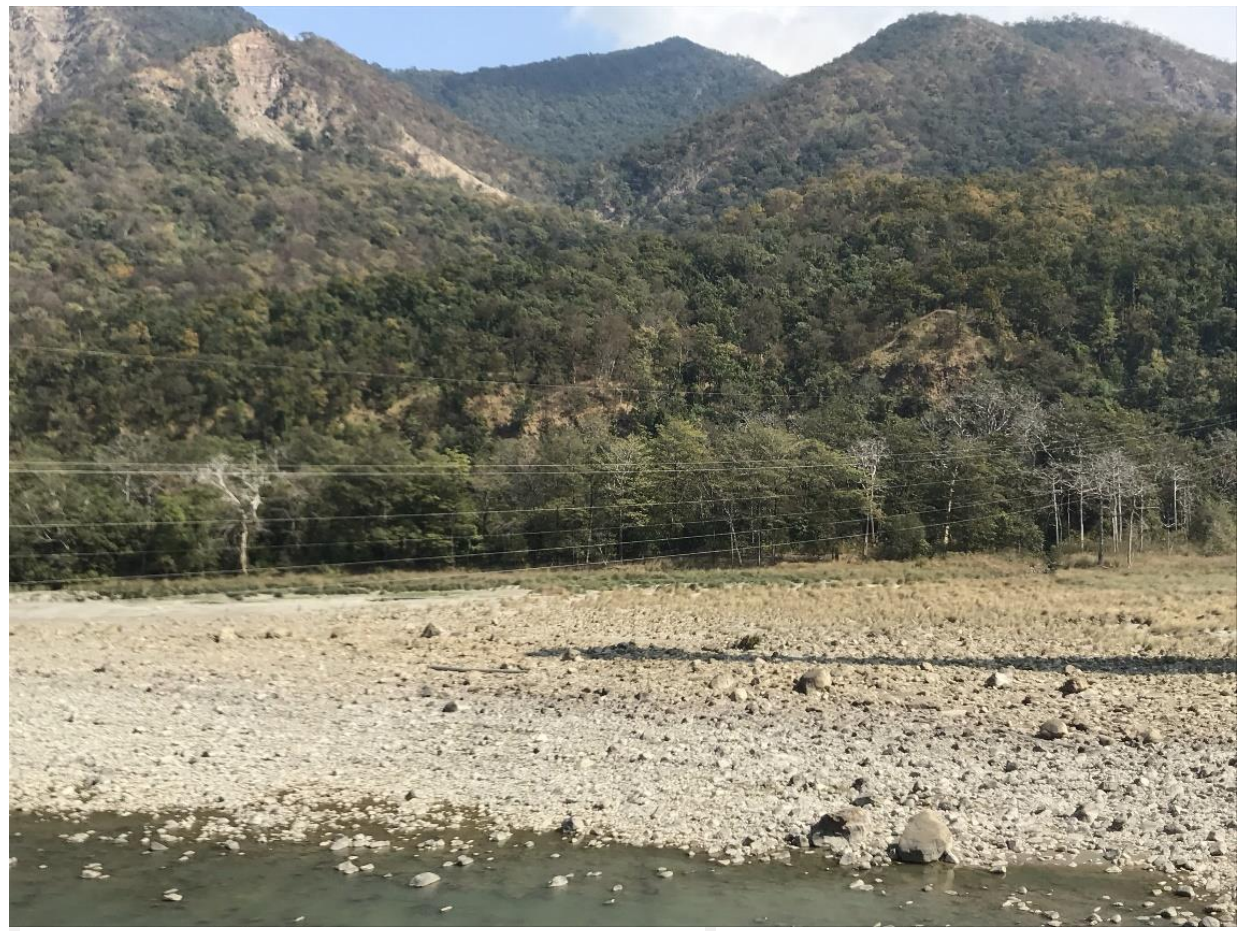
[River bank a productive habitat to tiger, Bardiya]