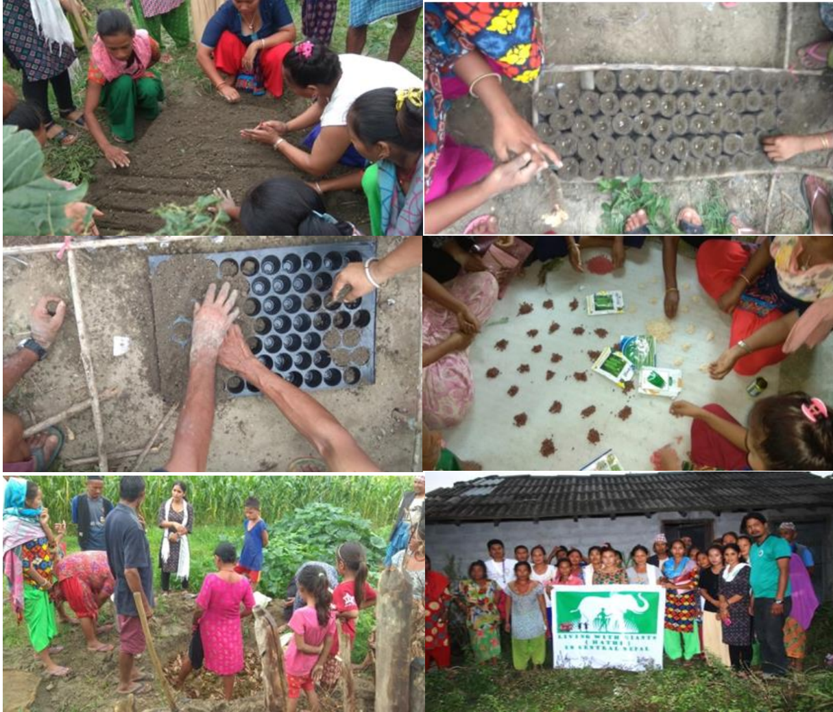
First row- Left -right (Making seedling bed on mud; Making seedling bed in polybag) Second row- Left to right (Making seedling bag in tray; distribution of hybrid seeds) Third row- (Making of compost manure; Final photo of participant, project leaders and trainer)