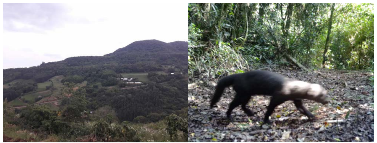
Left: Teutônia landscape. Right: Eira barbara, Turvo State Park.

We have already recorded two of the three focus species (Galictis cuja and Eira barbara)