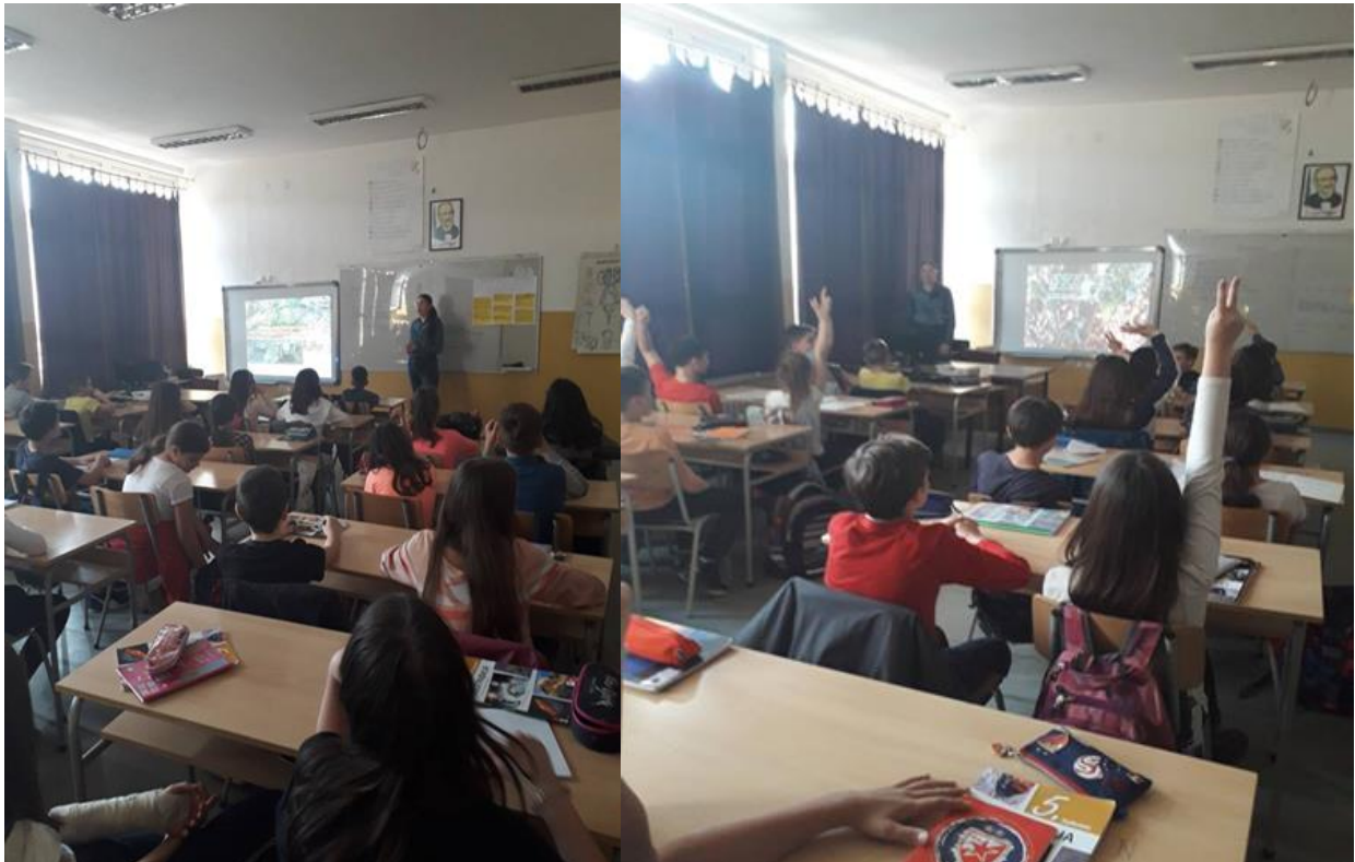
Primary School "Car Konstantin" in the city of Niš