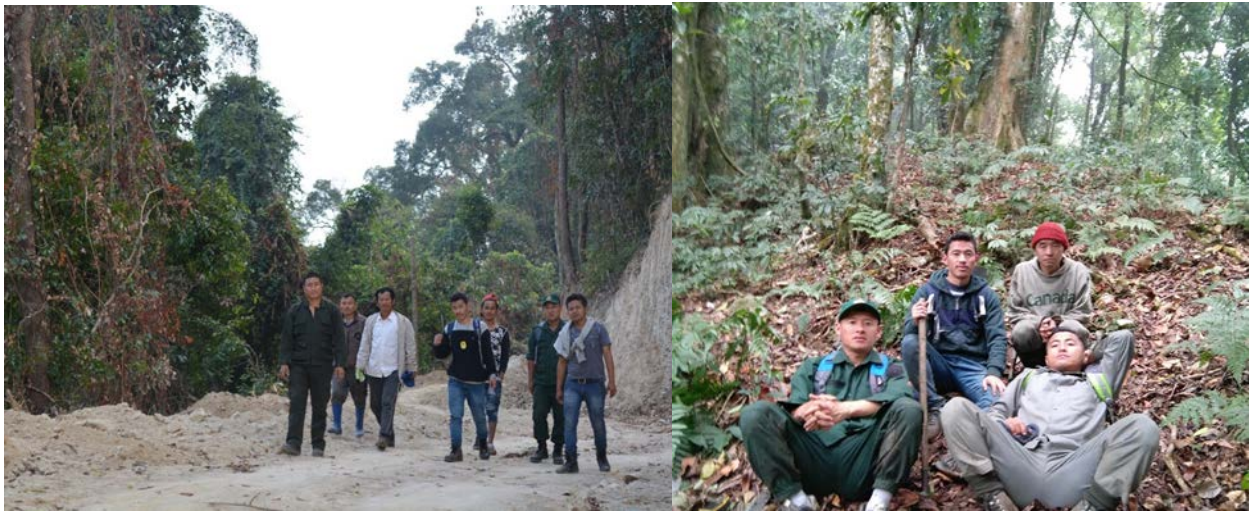
Figure 3: (Left) Three teams while returning after nest search in the forest. (Right) Nest searching team taking rest in the forest.

The hornbill nests were searched in the area. Most of the nests were found with the help of local people. The forestry officials also helped in searching nests. The nest watching were carried to understand diet of the hornbills.