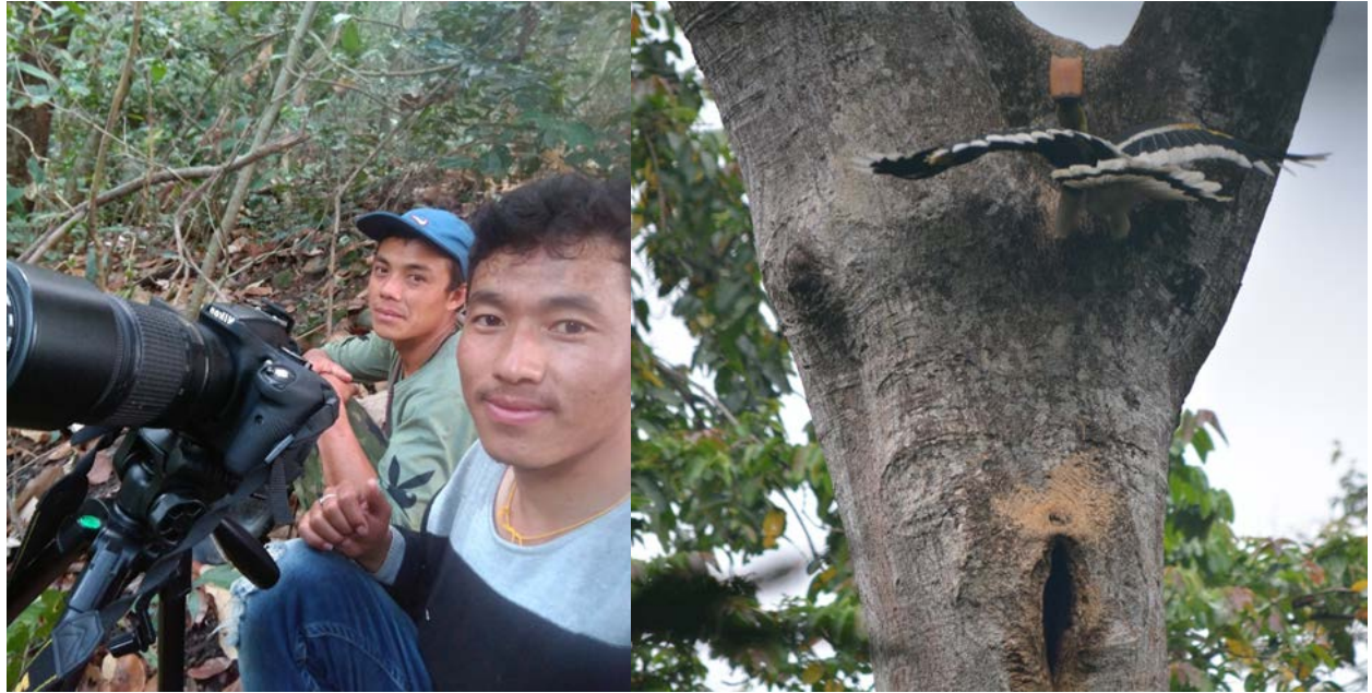
Figure 4: (Left) Nest watching. (Right) Great Hornbill male leaving nest after feeding female.