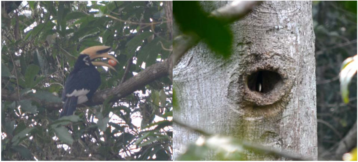
Figure 5: (Left) Male Oriental Pied Hornbill carrying fruit. (Right) Nest of WH (beak of incarcerated female protruded out from slit of sealed nest).