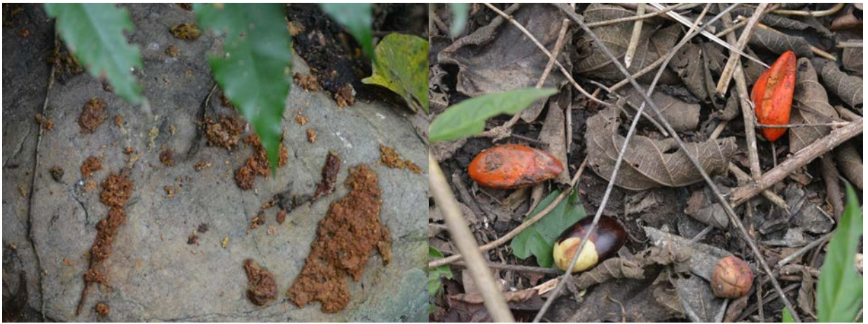
Figure 2: (Left) Waste defecated below Wreathed Hornbill (WH) nest. (Right) Regurgitated seeds below Oriental Pied Hornbill nest.

animal matter are recorded in diet. The most of the fruits hornbills consumed are recorded from Moraceae and Meliaceae family.