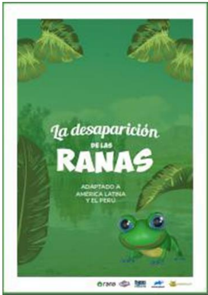
Photograph 08. Environmental Education Manual used for the workshop. (Location of the manual: http://www.amphibianark.org/en/education/links-to-curriculum-materials )