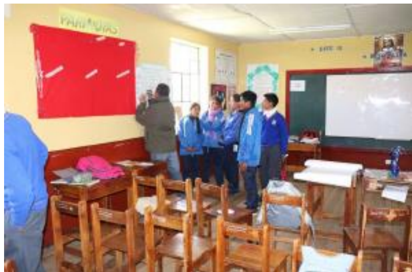
Photography 09. Ranger from SERNANP supporting a group of students with a manual activity.