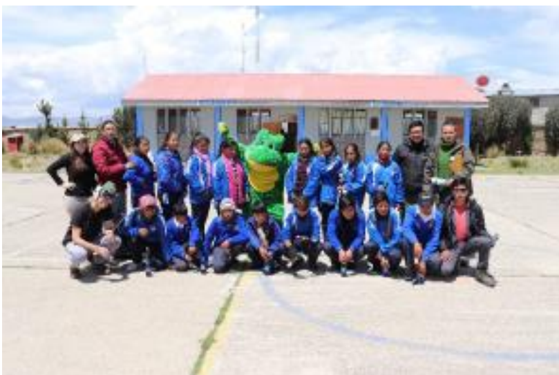
Photograph 10. Group of students benefited by the environmental education workshop.