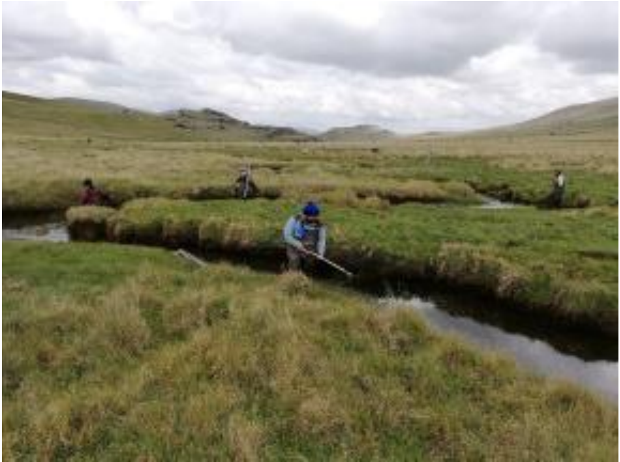
Photograph 05. Frog survey in a stream