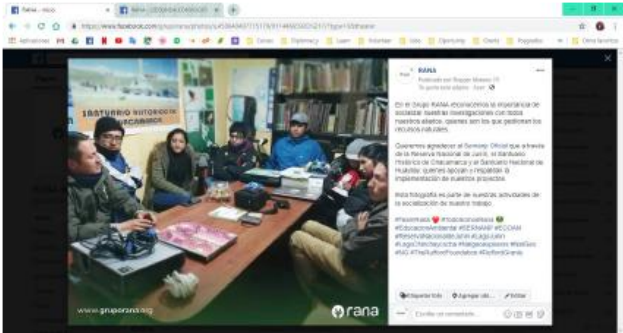
Photograph 07. Socialization of work.