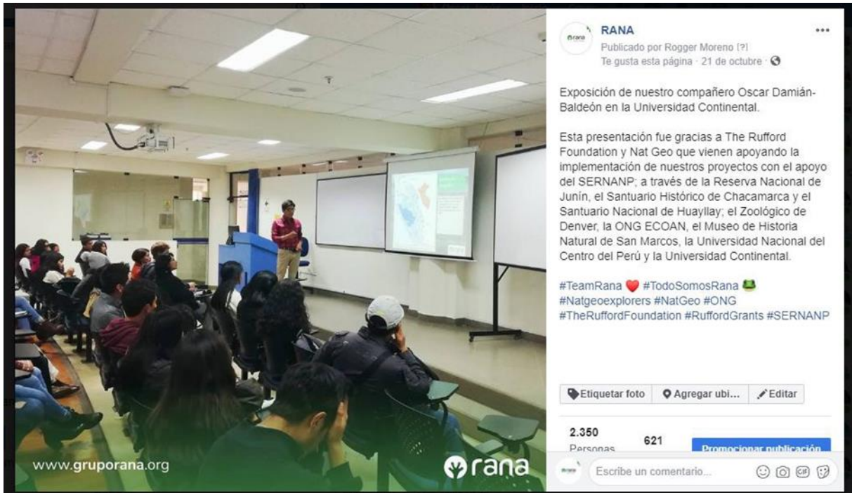
Photograph 02. Development of a talk about the conservation program of the Junin frogs.