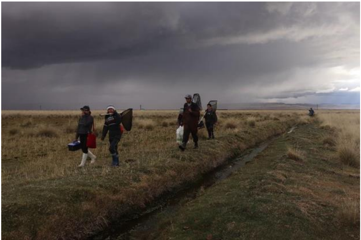
Photograph 06. Field expedition team.