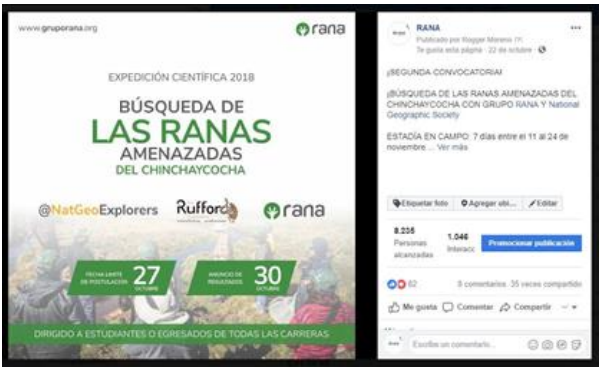
Photograph 03. Announcement/Advertisement poster for field assistants.