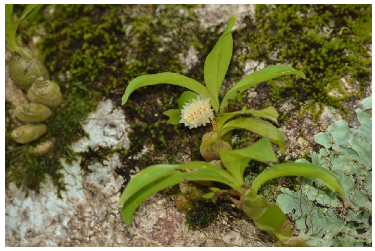
Pinalia globulifera blooming in Jampui Hills