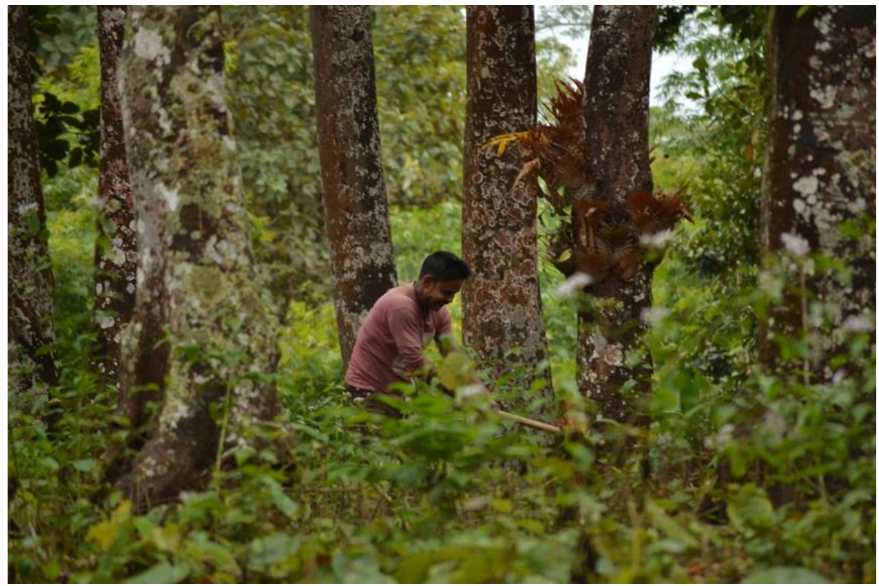
Illegal felling of a Shorea robusta tree in Kumarghat Reserve Forest