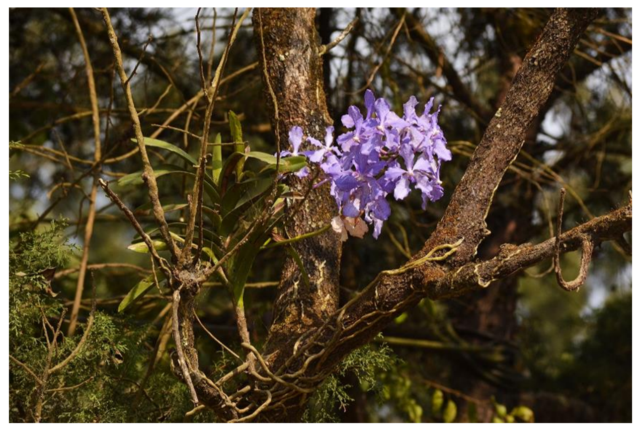
Vanda coerulea during peak flowering in Jampui Hills

One research paper entitled "New Distributional Records to the Orchid Flora of Tripura" containing 10 new reports for the state was communicated in first week of October 2018. We also applied and got accepted for poster presentation in a National Conference on Orchids in February 2019 at Port Blair, Andaman and Nicobar Islands, India. The poster includes a metadata analysis on specialised pollination mechanisms in the Orchidaceae family. This is a consequence of an extensive literature survey carried out by the team during the project. We plan on providing a copy of the poster after the conference.