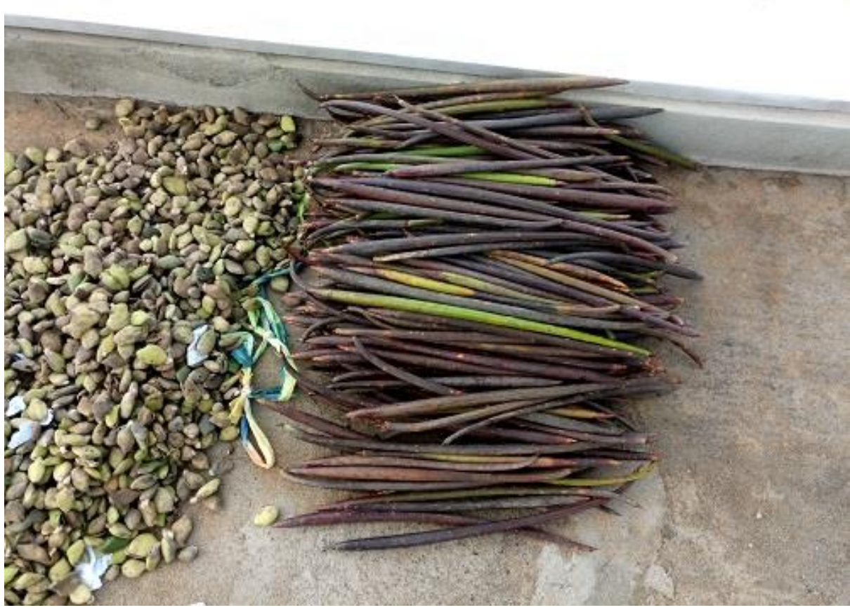
Photo 1. Shows the mature seeds of A. germinans and propagules of R. racemosa collected and put in nursery in order to get seedlings

Avicennia germinans seeds and Rhizophora racemosa propagules (Photo 1) were collected and put in nursery in semi controlled experiment settings. Followed over 30 days, seeds/propagules yielded seedlings transplanted to sites of different characteristics. These seedlings are being monitored and in 6 months, training on the nursery techniques (next step of the project) will be engaged.