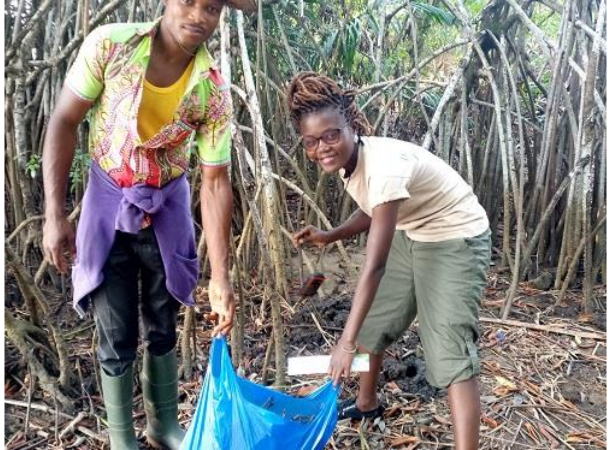
Photo 2, 3 & 5 Collecting seeds of A. germinans and propagules of R. racemosa either with the assistance of a community member or alone.