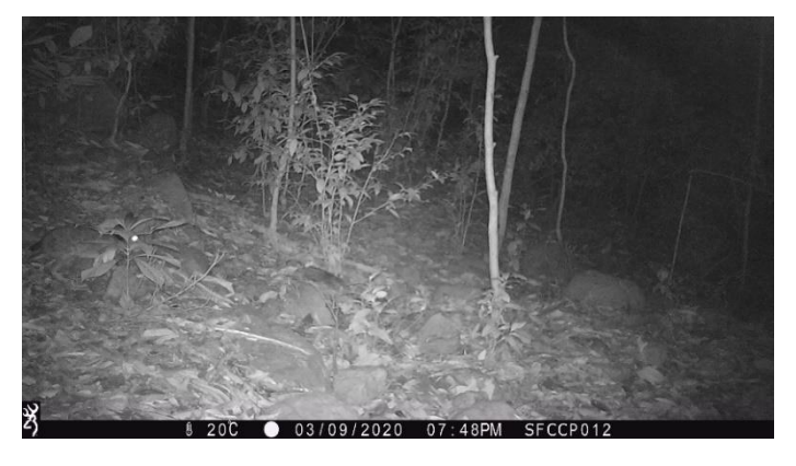
Black napped hare