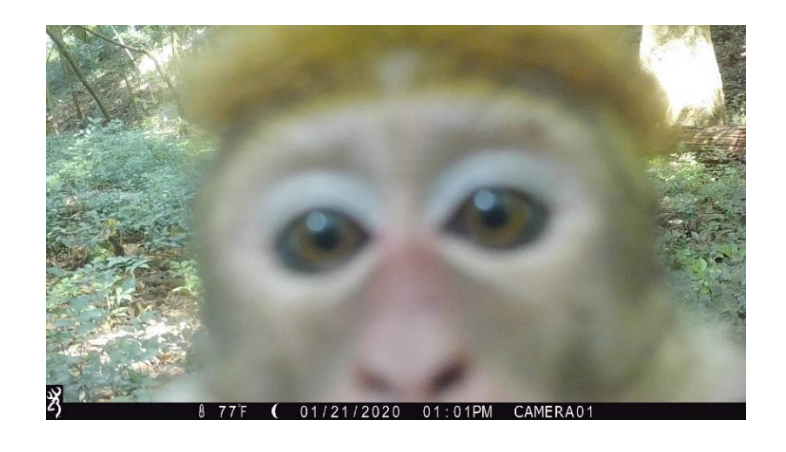
Sri Lanka toque monkey