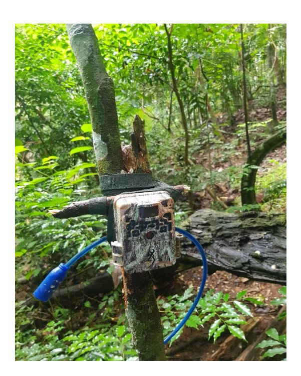
Setting Up and checking camera traps in Dunumadalawa Forest Reserve