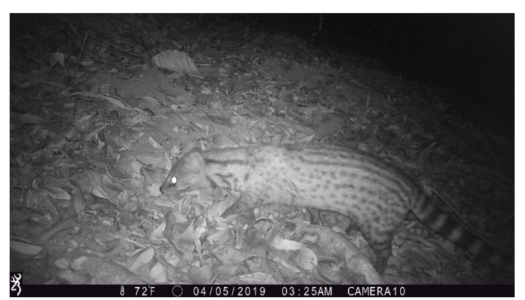
Ring tailed civet