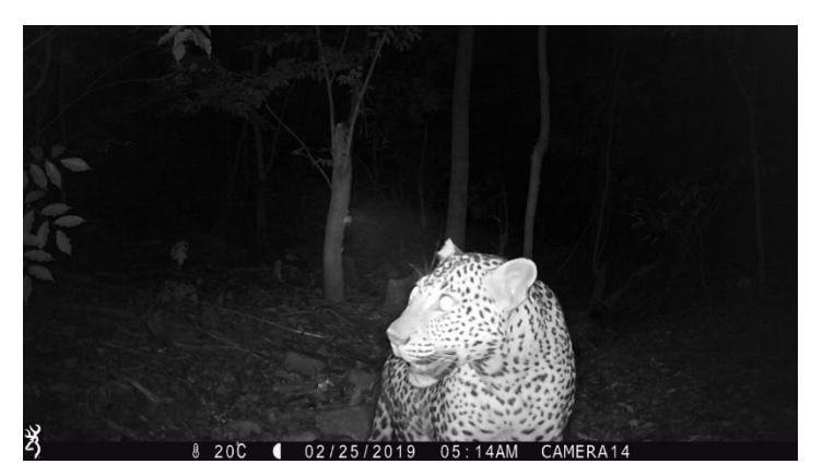
Sri Lankan Leopard