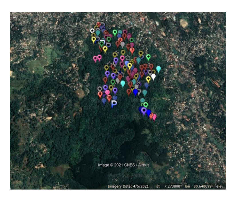
Figure 1. Camera trapping pin point locations in Dunumadalawa Forest reserve (more than 45% of reserve area have been surveyed)

So far we have completed 45% of the Dunumadalawa forest area with camera traping in past time period and we have collected 187870 records including photos and videos through out the project.