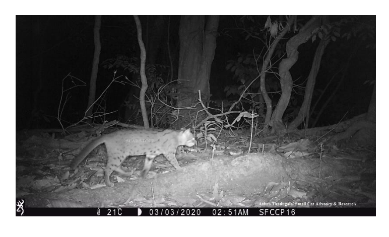
Rusty spotted cat