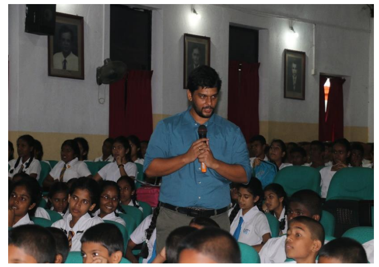
Awareness raising program for school kids (12 schools) in central province Sri Lanka (File covers and leaflets were also used in education)