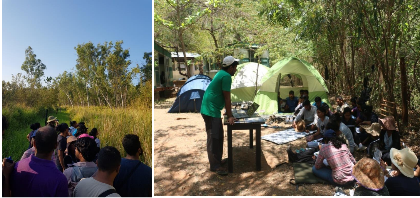
Two day Youth camp event for university students in 2018