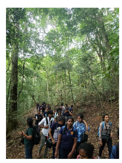
During 2019 program for university students - Nature walk after lecture series