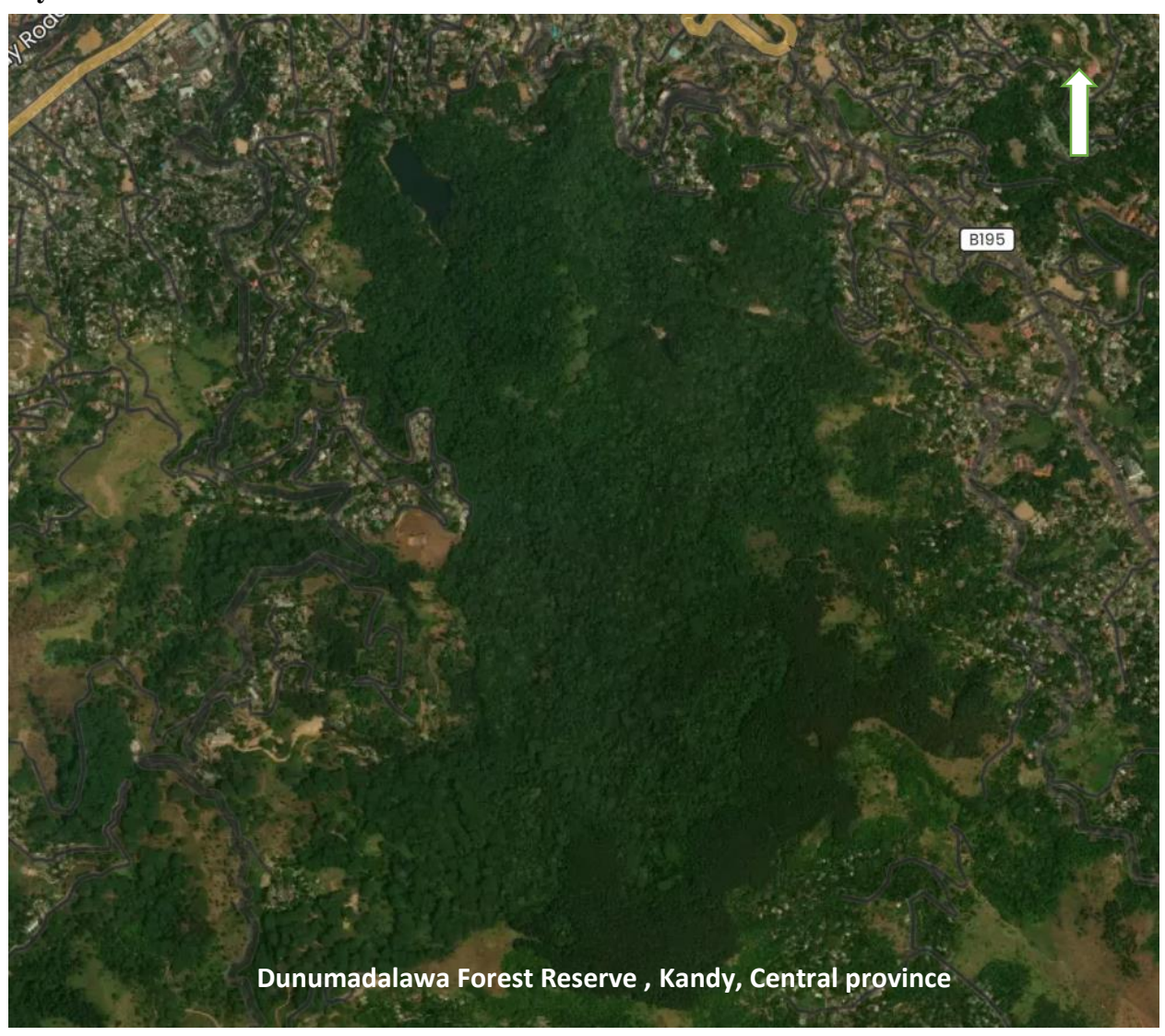
project site - Dunumadalawa forest reserve kandy

Dunumadalawa Forest Reserve (7017'00"N; 800 38'49"E, 548-972 m above sea level; also known as Walker Estate or 'Waraka Wattha'), is a semi isolated, mid-country wet zone forest fragment situated in the Kandy District. It is approximately 480 ha in extent and is located within the municipal limits of the Kandy City. Dunumadalawa comprises mainly of secondary growth forest since the site has been used earlier for tea and cocoa plantations. At present, few primary forestpatches are remaining in the forest reserve. This historical forest reserve forms the catchment and protects the watershed of two reservoirs known as Dunumadala Wewa and Roseneath Wewa