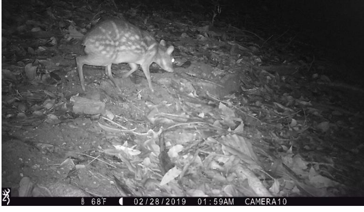
Sri Lankan mouse deer